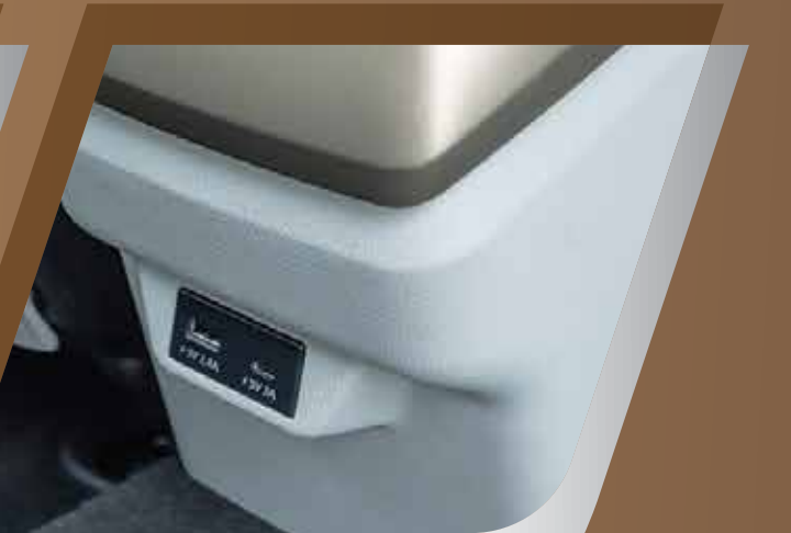
A and C Type Smart USB Chargers for all Rows

Headrests that complement comfort equally with luxury