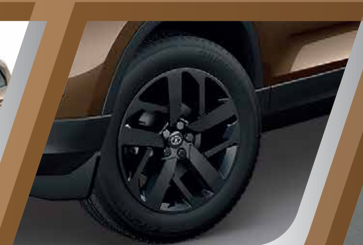
R18 Jet Black Alloys

The Safari #JET Edition comes with a one of a kind exclusive exterior colour that emerges to life when you shoot for the stars