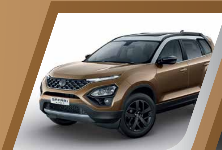
Exclusive Dual-Tone 'Starlight' Exterior

The Safari #JET Edition comes with a one of a kind exclusive exterior colour that emerges to life when you shoot for the stars