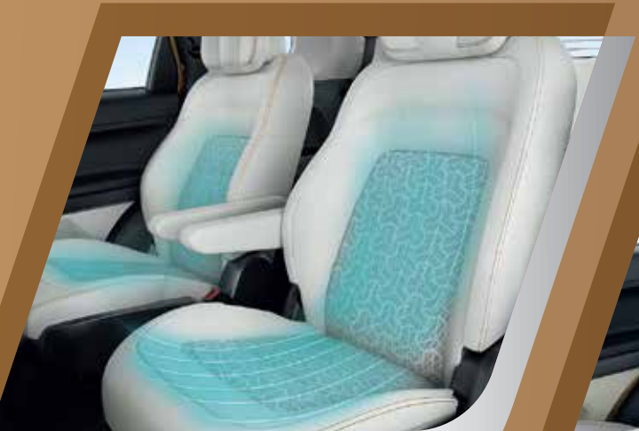
Ventilated Seats in First and Second Row*

Your ride will never let your guard down when it comes to safety with Panic Brake Alert, After Impact Braking, Doze Off Alert and 14 additional functions