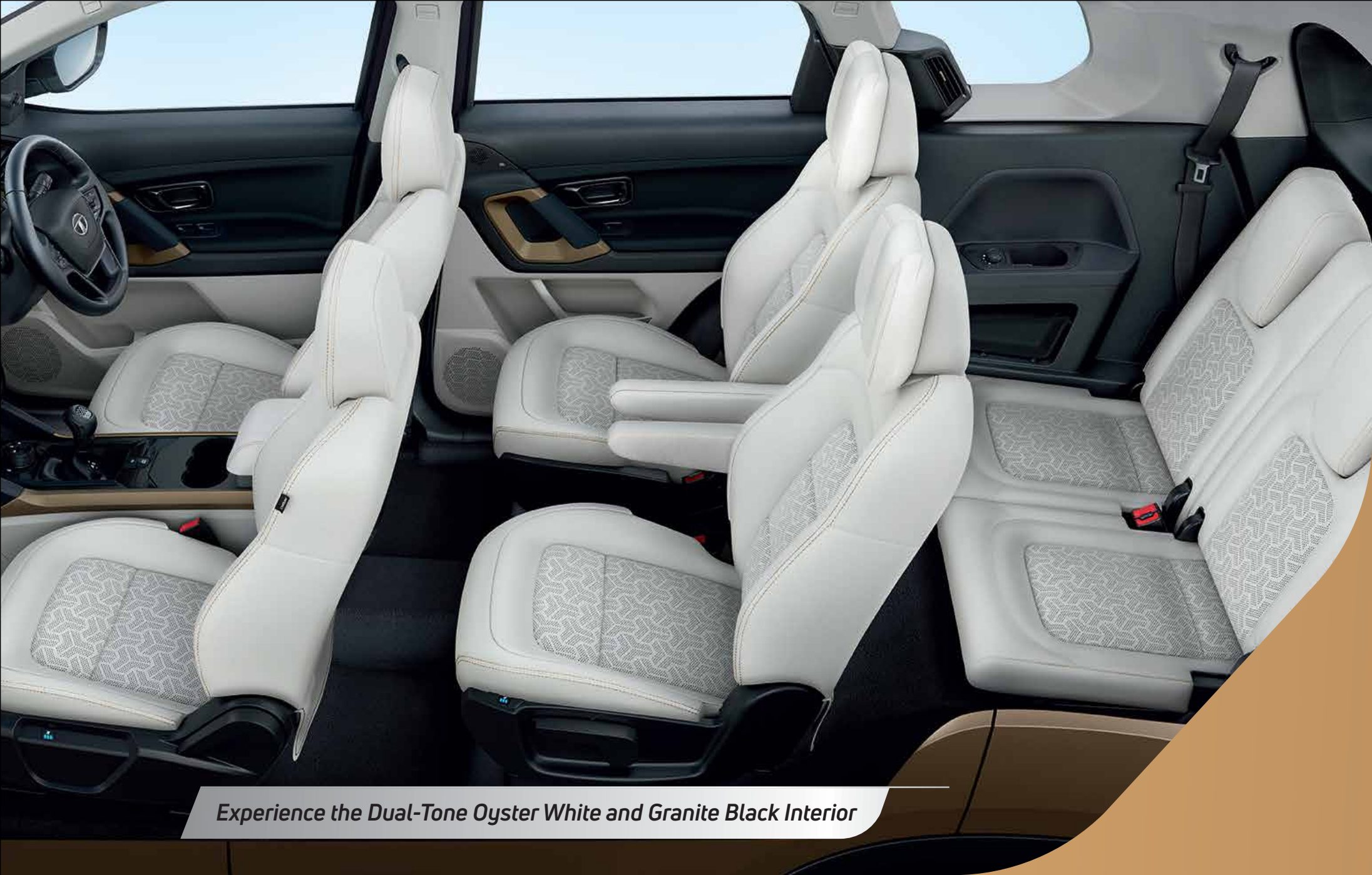
Experience the Dual-Tone Oyster White and Granite Black Interior