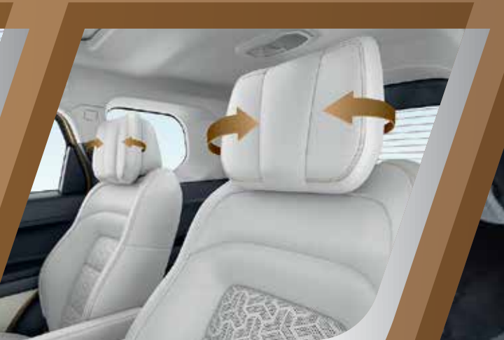
Winged Comfort Head Restraints

Plush seats designed to ensure soothing airflow for all your journeys