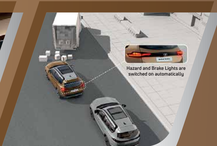
Advanced ESP Safety Features

The Jet Black 18" Diamond Cut Alloys leave a trail of success