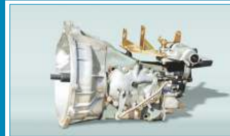
G 17/ 4B Speed Gearbox