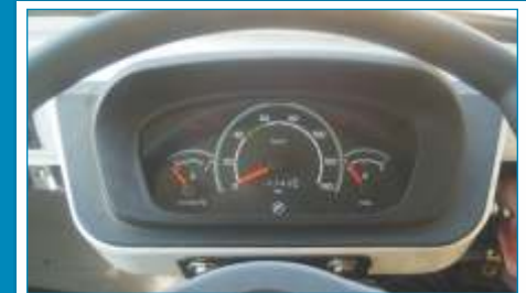
Stylish Instrument panel

NOTE : On account of continuous Research and Development, specifications are subject to change. The data included herein is to be regarded as approximate. Accessories shown may not necessarily be part of standard equipment.