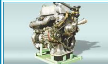
TD-2000 F DI Diesel Engine