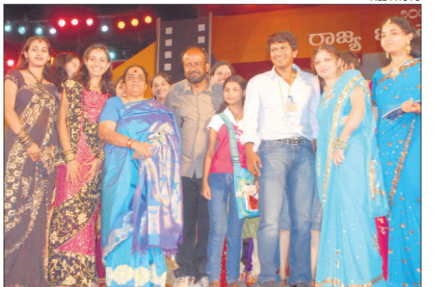
Some of the previous winners of Karnataka film awards

Unreleased and unheard-of films are competing for state awards