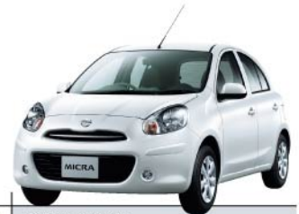
● Storm White