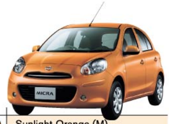
● Sunlight Orange (M)