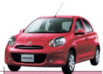
● Brick Red (M)