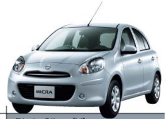
● Blade Silver (M)