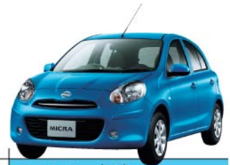
● Pacific Blue (PM)