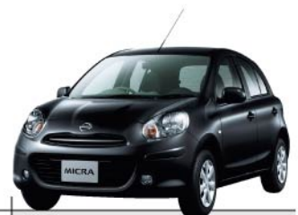
● Onyx Black