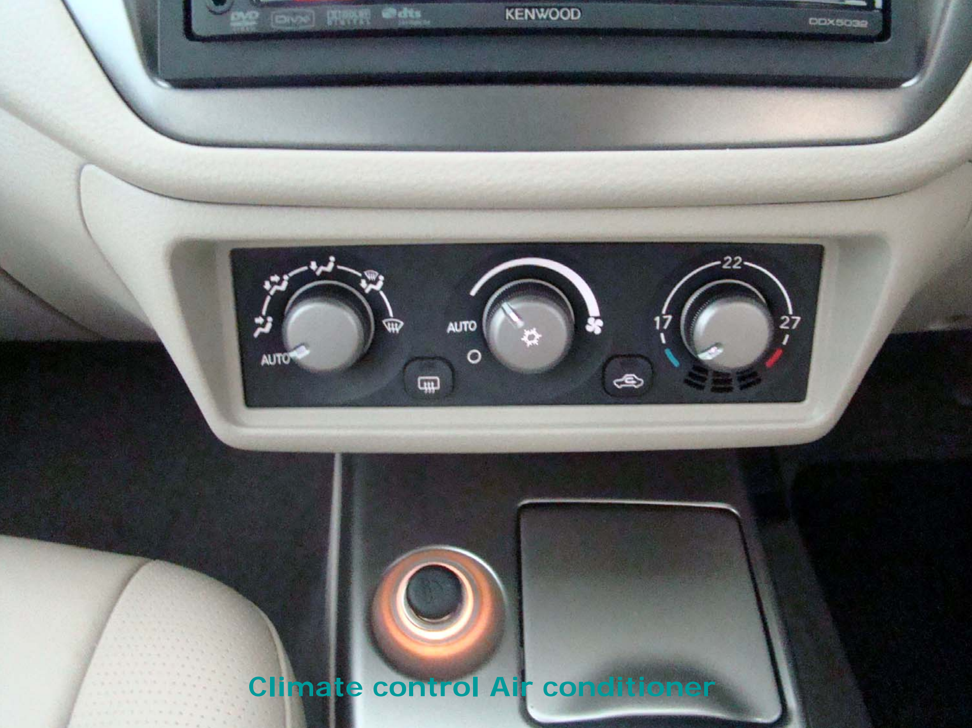
Climate control Air conditioner