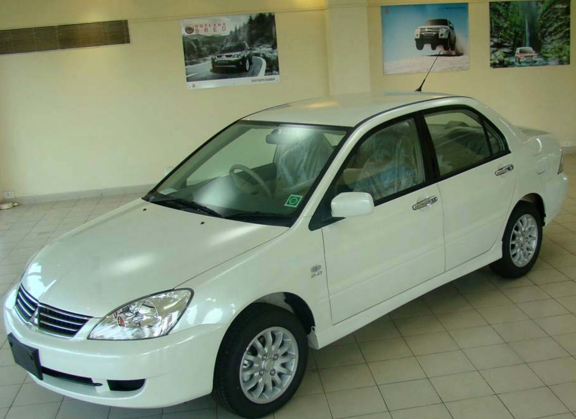
Extended front and rear bumpers with side skirts