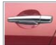
CHROME DOOR HANDLES