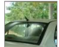
SPORTY ROOF ANTENNA