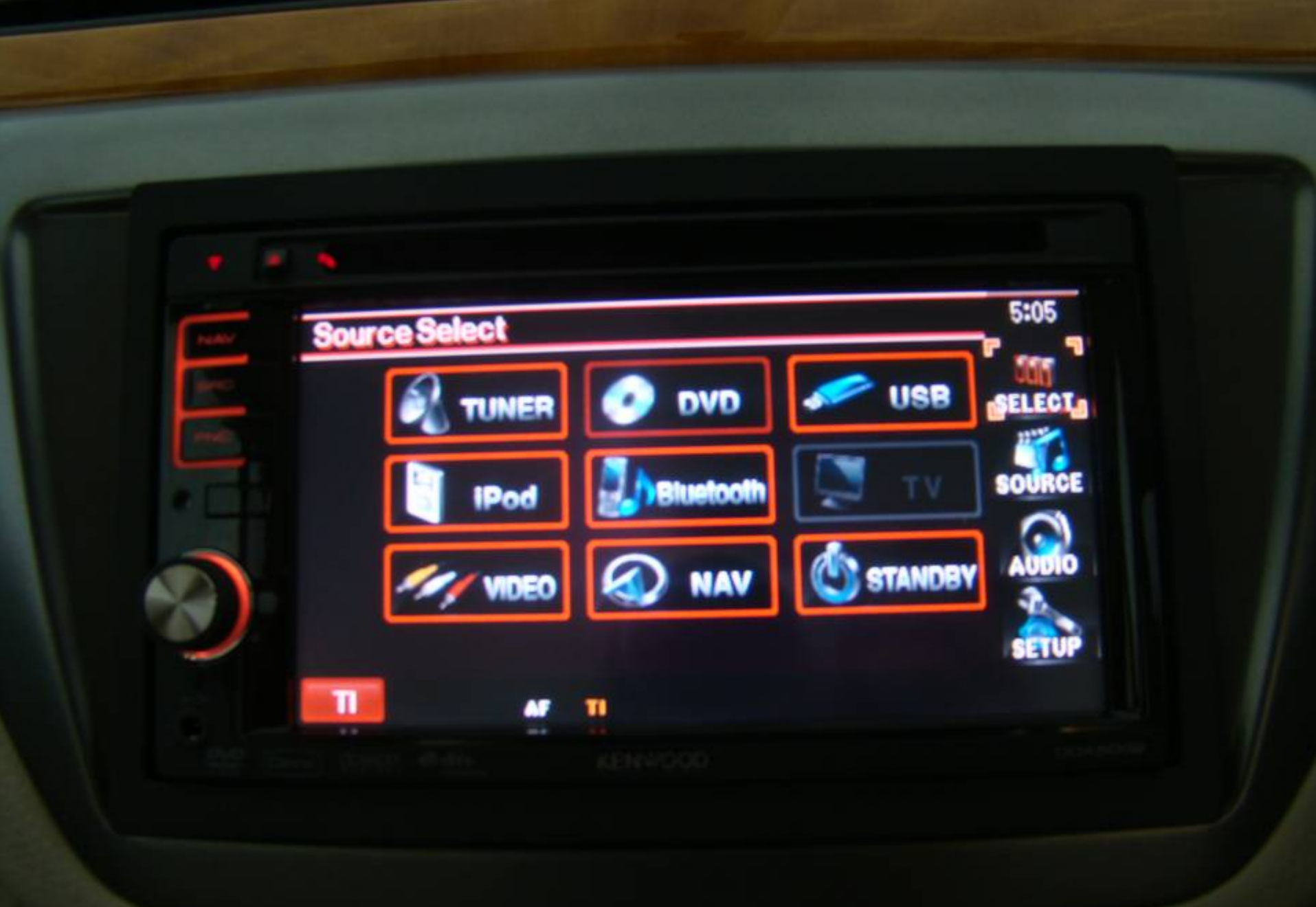
2-Din touch screen Kenwood Music system