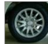
12 SPOKE ALLOOY WHEELS