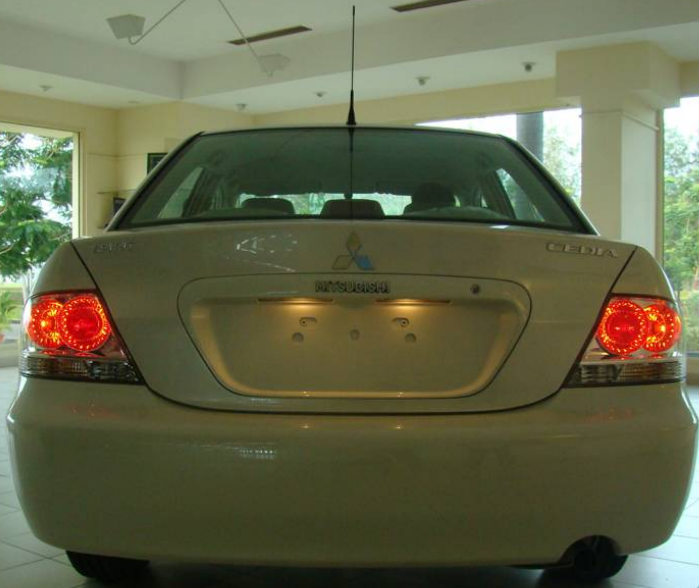
Rear combination tail lamps with clear lens