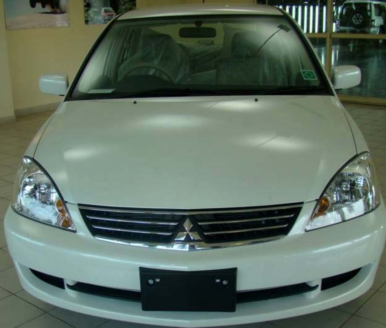
The New look Cedia with Horizontal Chrome Grill