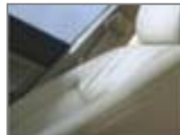
PERFORATED LEATHER SEATS