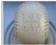
LEATHER WRAPPED GEAR KNOB