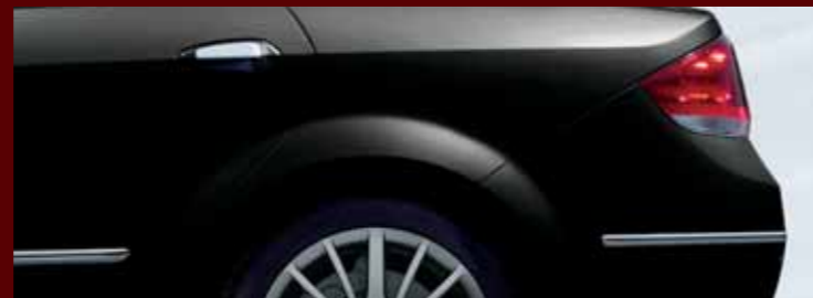
Hip Hop Black

The Fiat Linea comes in a burst of truly wonderful colours*. From Flamenco Red to Perla Champagne, the shades are a feast to the eyes. Take it out for a spin and you can expect admiration to follow.