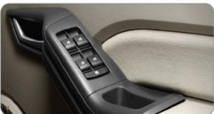
DOOR-MOUNTED POWER WINDOW SWITCHES