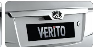
CHROME REAR APPLIQUE