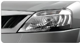
NEW EYEBROW HEADLIGHTS