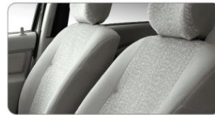
ELEGANT NEW UPHOLSTERY

The cabin of the new Verito is as roomy and comfortable as it has always been. But everything from the centre console to the door trims have been re-designed. Every feature has been tweaked to feel even more convenient. And the new dashboard lends a contemporary and refined two-tone theme to the entire cabin.