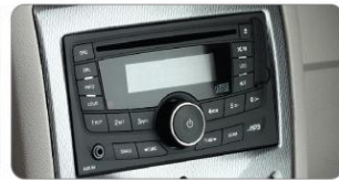
2-DIN MUSIC SYSTEM WITH CD/MP3/USB/AUX-IN