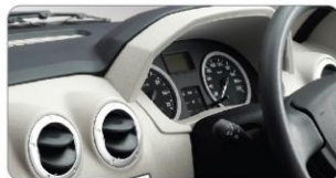
TWO-TONE INSTRUMENT PANEL