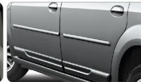
SIDE IMPACT BEAMS