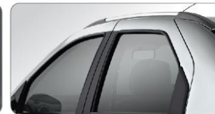
STYLISH ROOF RAILS & BLACKENED PILLARS