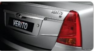
SCULPTED NEW BOOT LID & CLEAR LENS TAIL LAMPS

The Verito has always been the sedan of choice for men who value substance over style. But who says you can't have both? Presenting the new-look Verito. Sophisticated bends, masculine body lines and bold cuts give the car an elegant new look. While re-designed interiors round off the experience. Now the sensible sedan gets the stylish air it deserves.