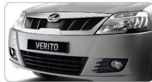
CHROME-PLATED FRONT GRILLE