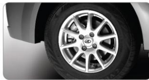
CLASSY NEW ALLOY WHEELS