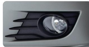
STYLISH NEW FOG LAMPS