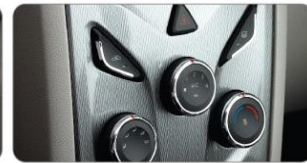
VARIOMETRIC AC WITH ERGONOMIC CONTROLS