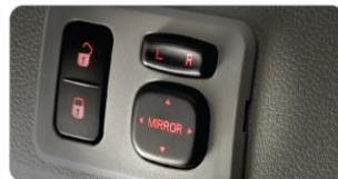
ELECTRIC ORVM CONTROLS