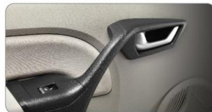
NEW DESIGNED GRAB HANDLES