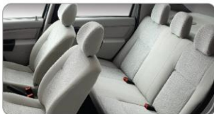
WIDEST REAR SEAT WITH THREE HEAD RESTRAINTS