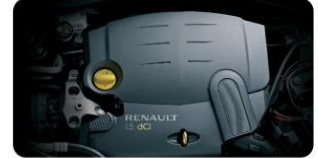
1.5 L dCi CRDi & 1.4 L MPFI ENGINES FROM RENAULT

The practicality of a Verito holds true for its on-road performance too. The responsive power steering, high ground clearance and modern suspension keep the drive quality high. While the renowned Renault CRDi and MPFI engines keep fuel efficiency high too. All this, with the convenience of a Driver Information System giving you live information about your car's performance.