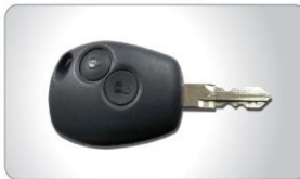
ANTI-THEFT ENGINE IMMOBILISER