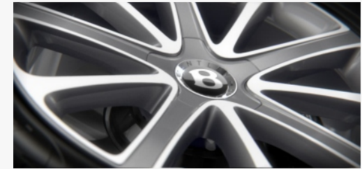
WHEELS 21" TEN SPOKE WHEEL - GREY PAINTED AND BRIGHT MACHINED