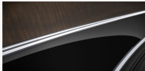
DARK FIDDLEBACK EUCALYPTUS OVER GRAND BLACK