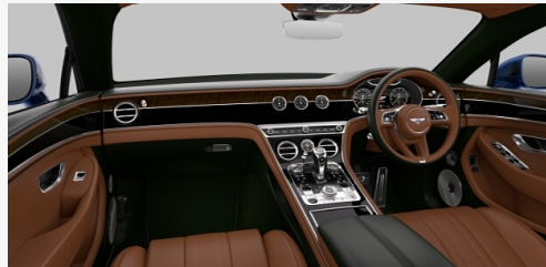
COLOUR SPLIT COLOUR SPLIT - B