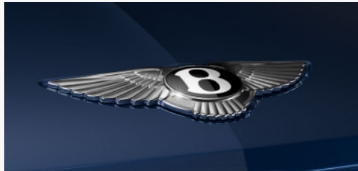
PAINTS SEQUIN BLUE