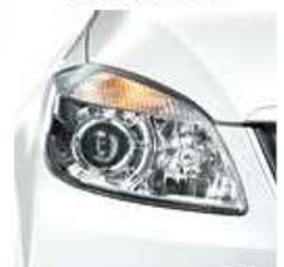
Halogen Projector Headlights