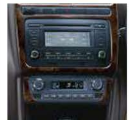
ŠKODA Audio Player, 2-DIN + Climatronic