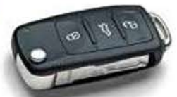
Engine Immobiliser with Floating Code System