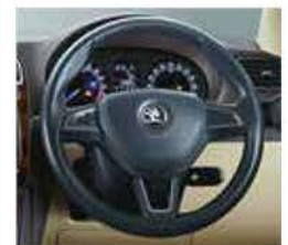
Leather Wrapped Multi-function Steering Wheel