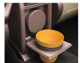
Cup Holders, Front and Rear