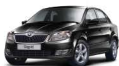
Deep Black Pearl