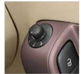
Electrically Adjustable External Mirrors