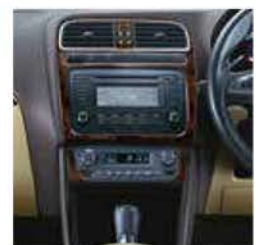
Chrome Interior Trim with Wood Decor