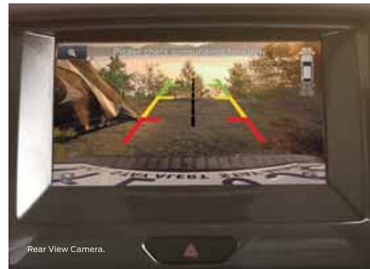
Rear View Camera.