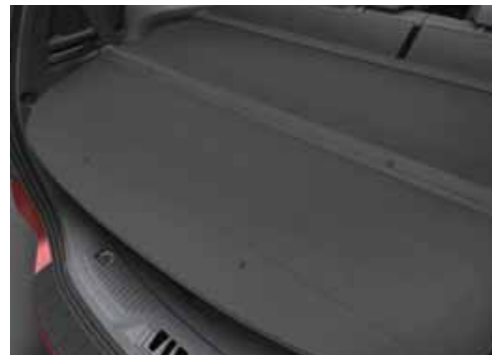
Cargo Cover. Retractable cover helps keep equipment and valuables out of sight.