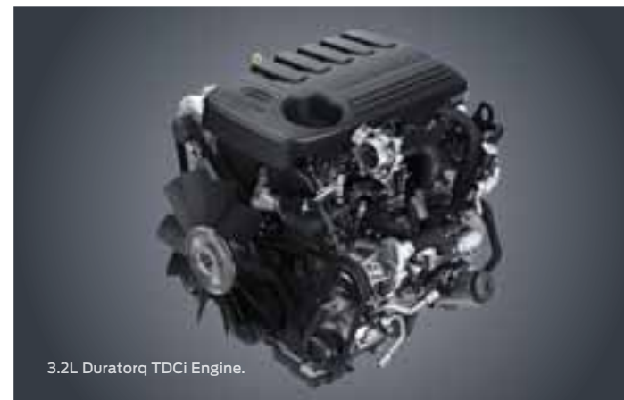
3.2L Duratorq TDCi Engine.