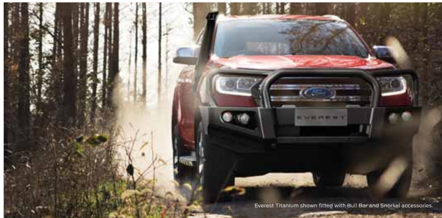
Everest Titanium shown fitted with Bull Bar and Snorkel accessories.