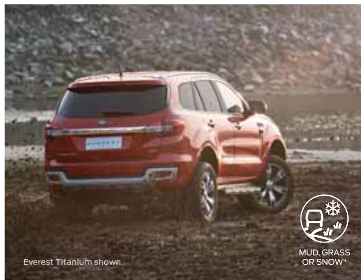
Everest Titanium shown.

In the Everest 4WD, the world is yours to explore. With its Terrain Management System , you get optimal control at the turn of a dial! From winding city roads to rugged dirt tracks, the Everest makes every drive incredible.