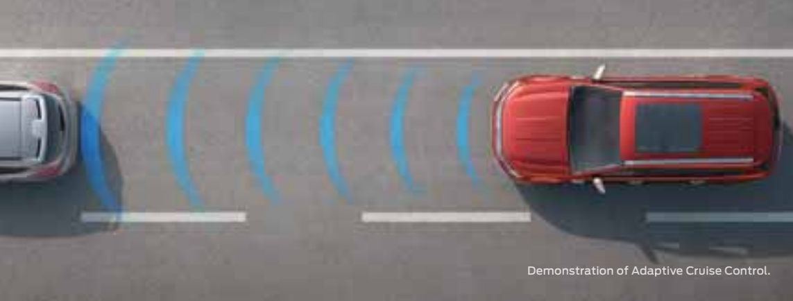
Demonstration of Adaptive Cruise Control.