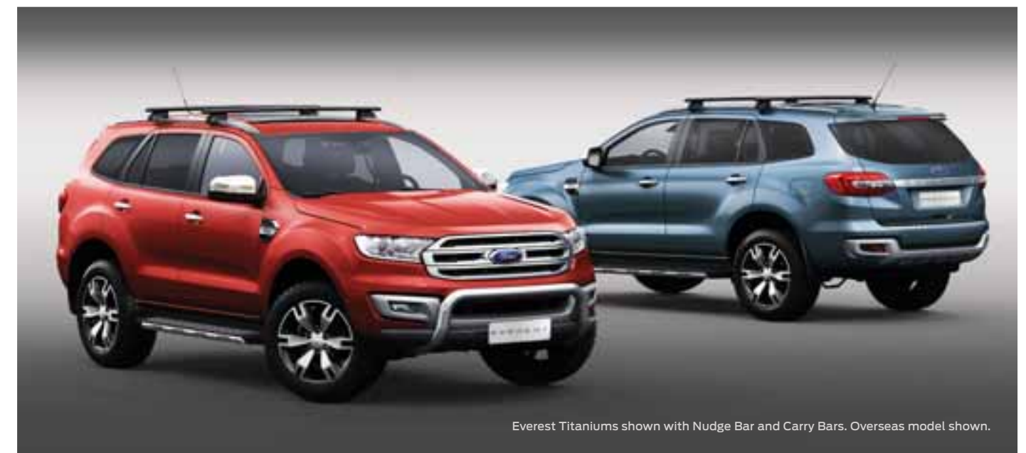
Everest Titaniums shown with Nudge Bar and Carry Bars. Overseas model shown.

S = Standard. A = Accessory that can be added at any time. – = Not available. O = Factory Option that can be ordered before a vehicle is manufactured.