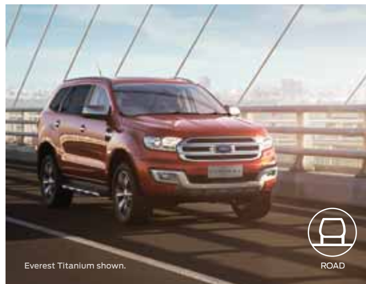
Everest Titanium shown.