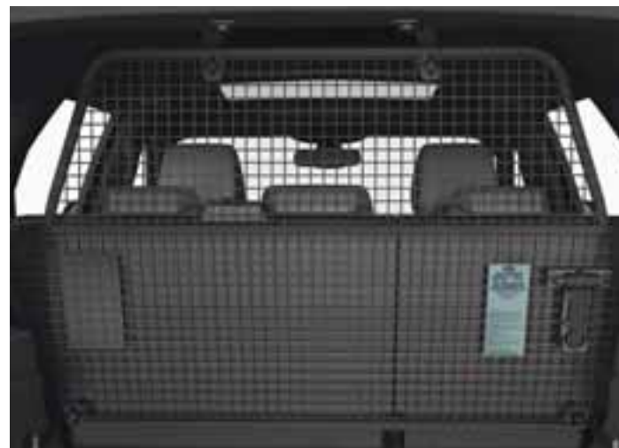
Cargo Barrier. Rated to 60 kg and meets Australian Standard AS/NZ4034.1:2008.