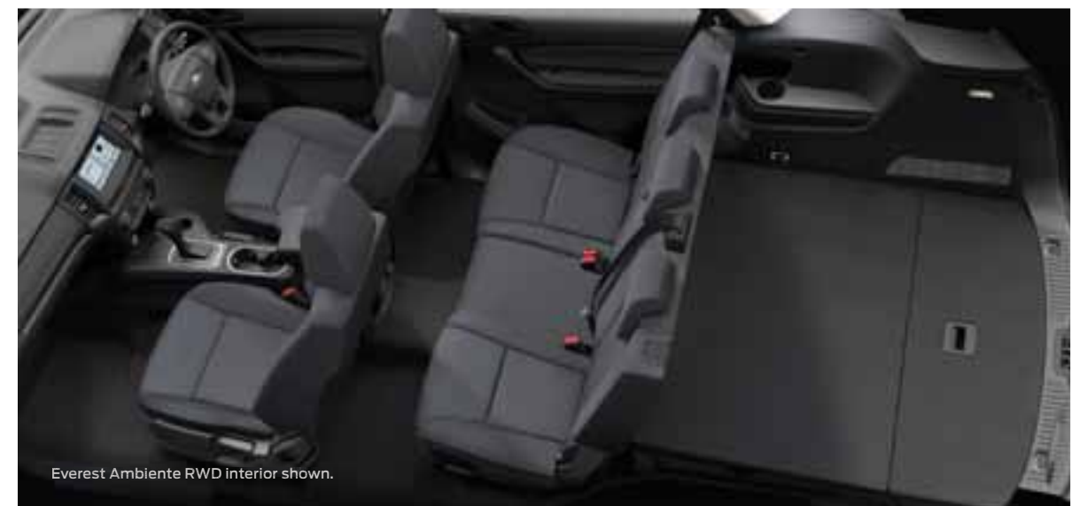
Everest Ambiente RWD interior shown.

With the Power Rear Liftgate on Trend and Titanium models, it's never been easier to pack a heavy load. Simply press the power button and watch the tailgate open and close by itself.