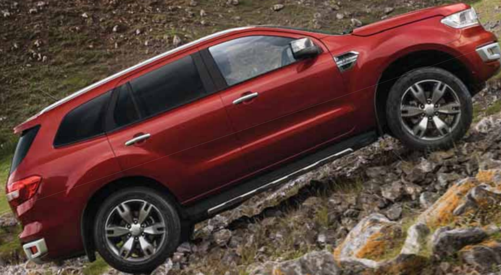
Everest Titanium shown.