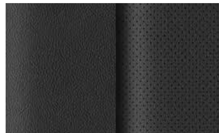
Titanium Seat insert: Soho Grain leather in River Rock (excludes 3rd row) Seat bolster: Soho Grain perforated leather in River Rock (excludes 3rd row)