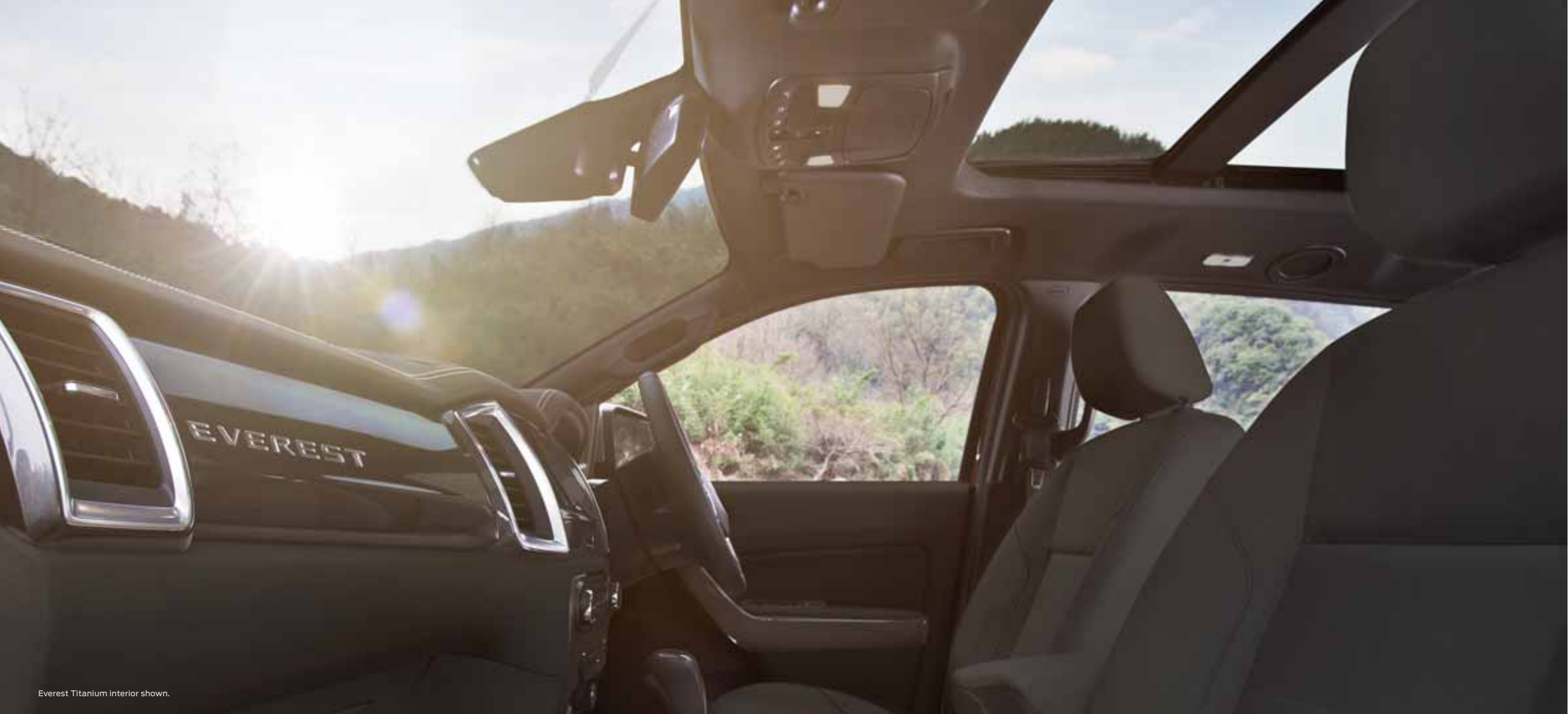
Everest Titanium interior shown.