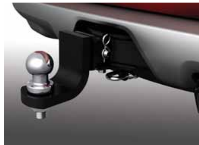
Tow Pack. Pack includes towbar, hitch, trailer wiring, LED compatible trailer wiring module and replacement lower bumper panel for a fully integrated finish.