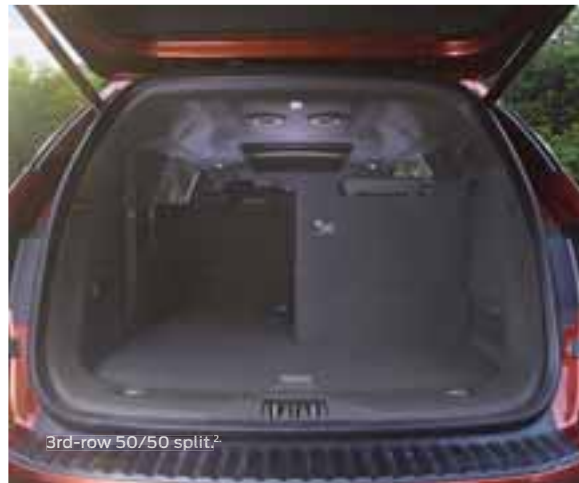
3rd-row 50/50 split. 2