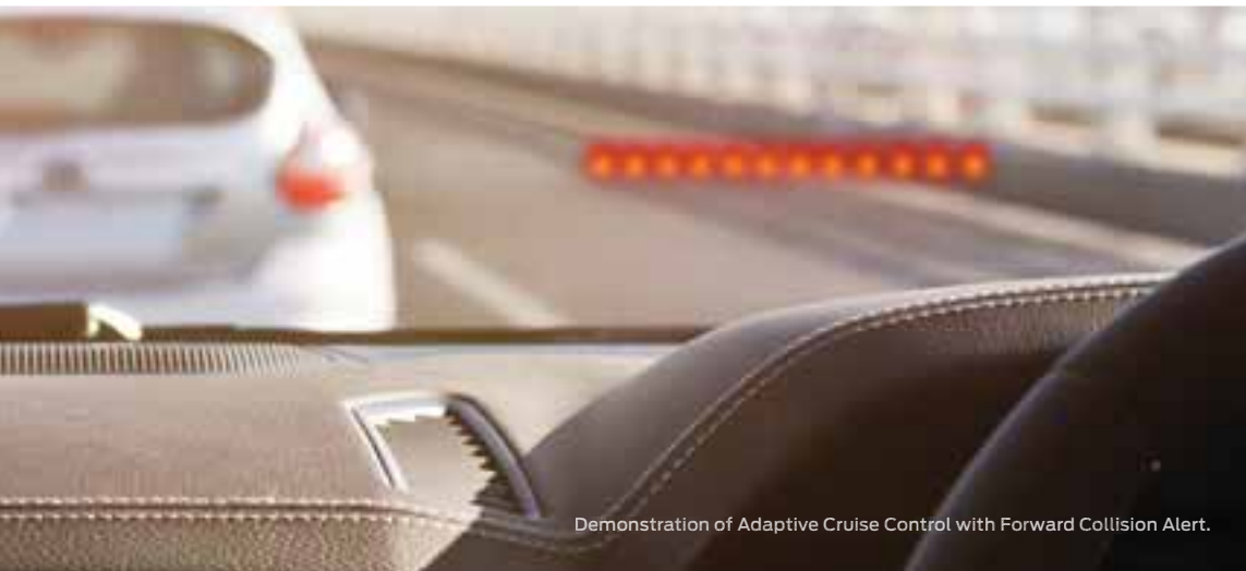
Demonstration of Adaptive Cruise Control with Forward Collision Alert.