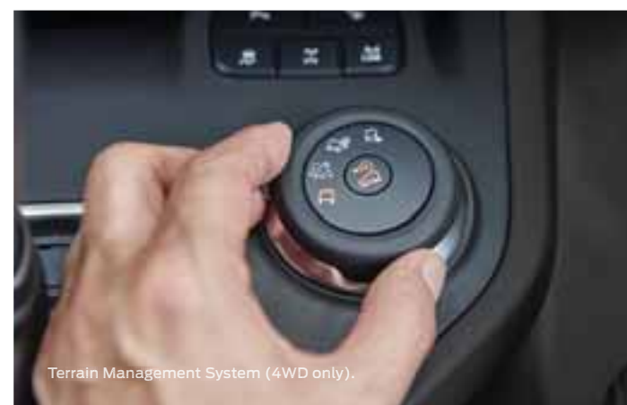
Terrain Management System (4WD only).