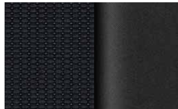
Trend Seat insert: Mason fabric in Ebony Seat bolster: Fineline fabric in Ebony