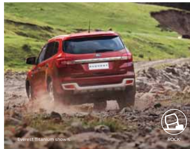
Everest Titanium shown.