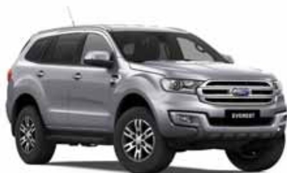
Everest Trend shown in Aluminium.