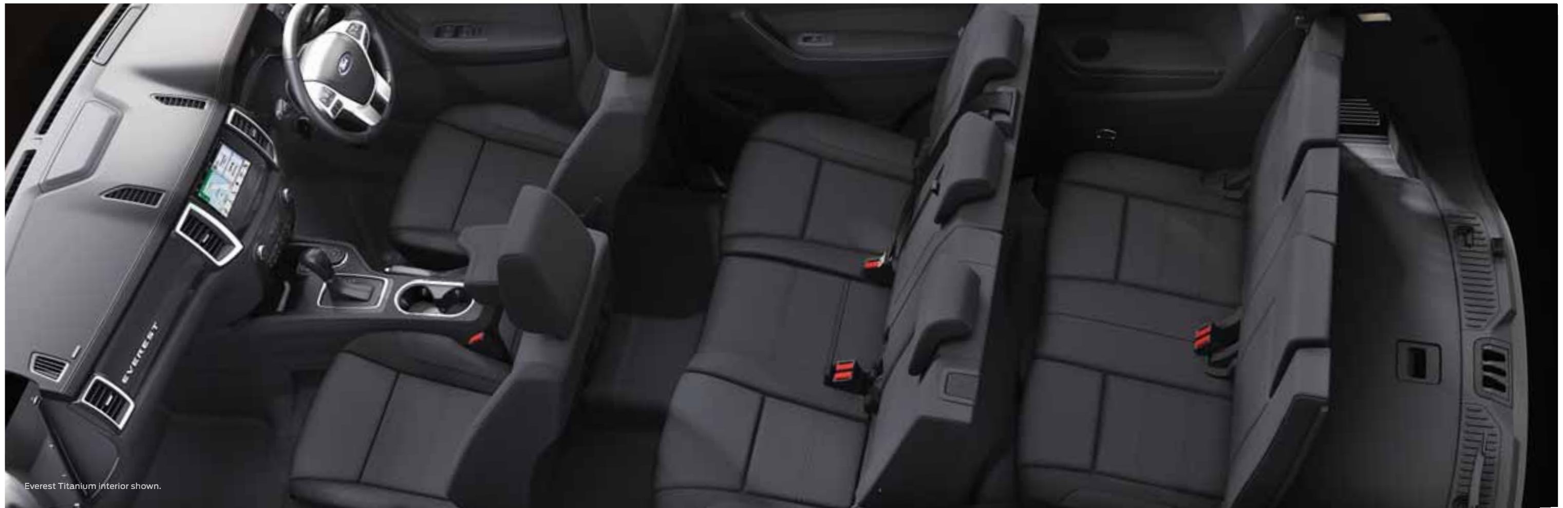
Everest Titanium interior shown.