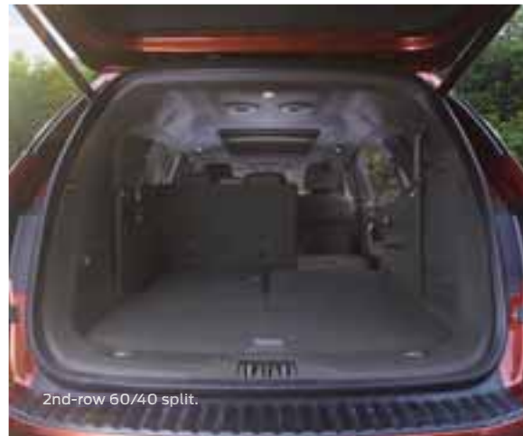
2nd-row 60/40 split.