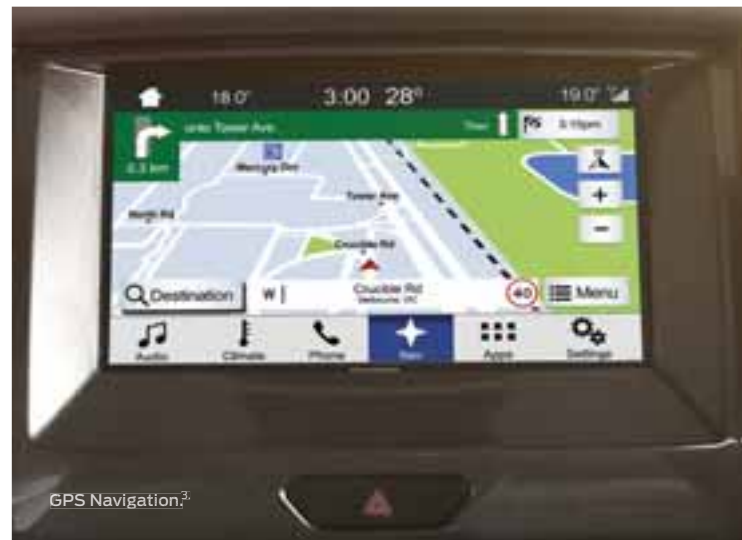
GPS Navigation 2