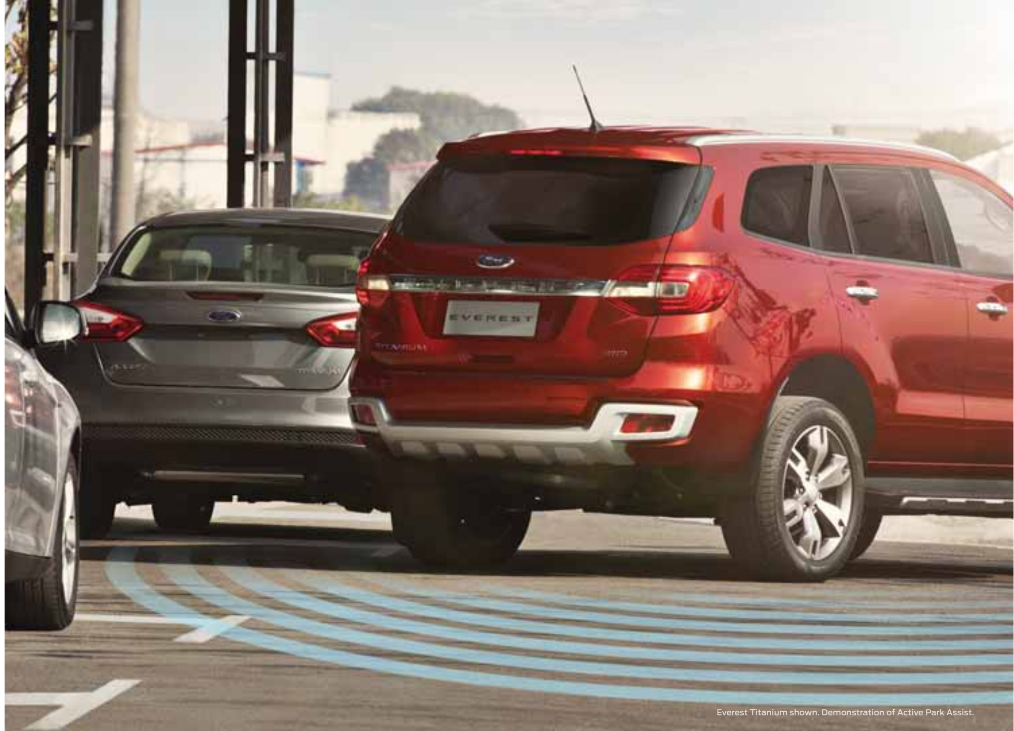
Everest Titanium shown. Demonstration of Active Park Assist.