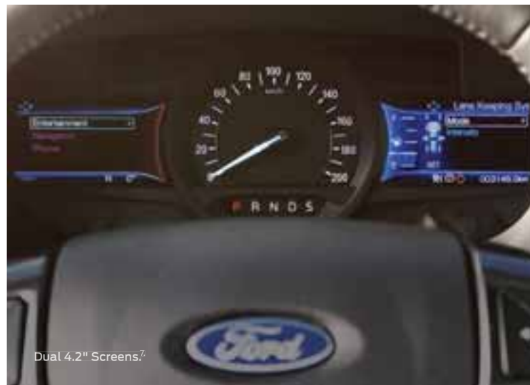
Dual 4.2" Screens 2