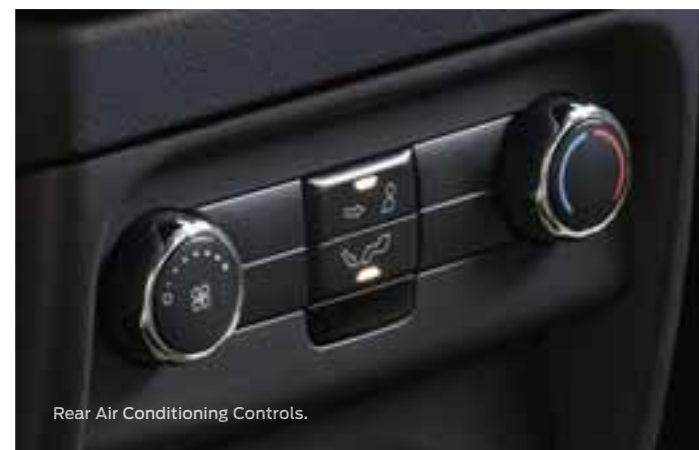
Rear Air Conditioning Controls.