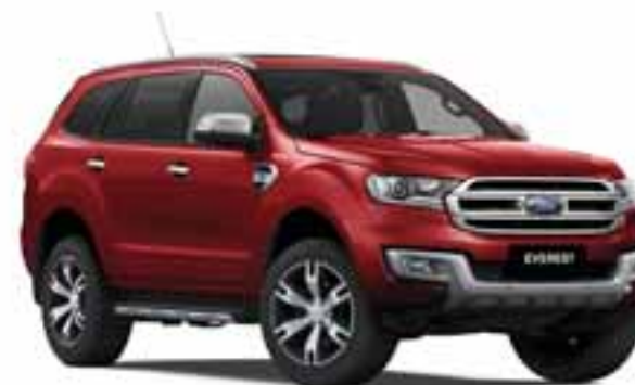
Everest Titanium shown in Sunset.