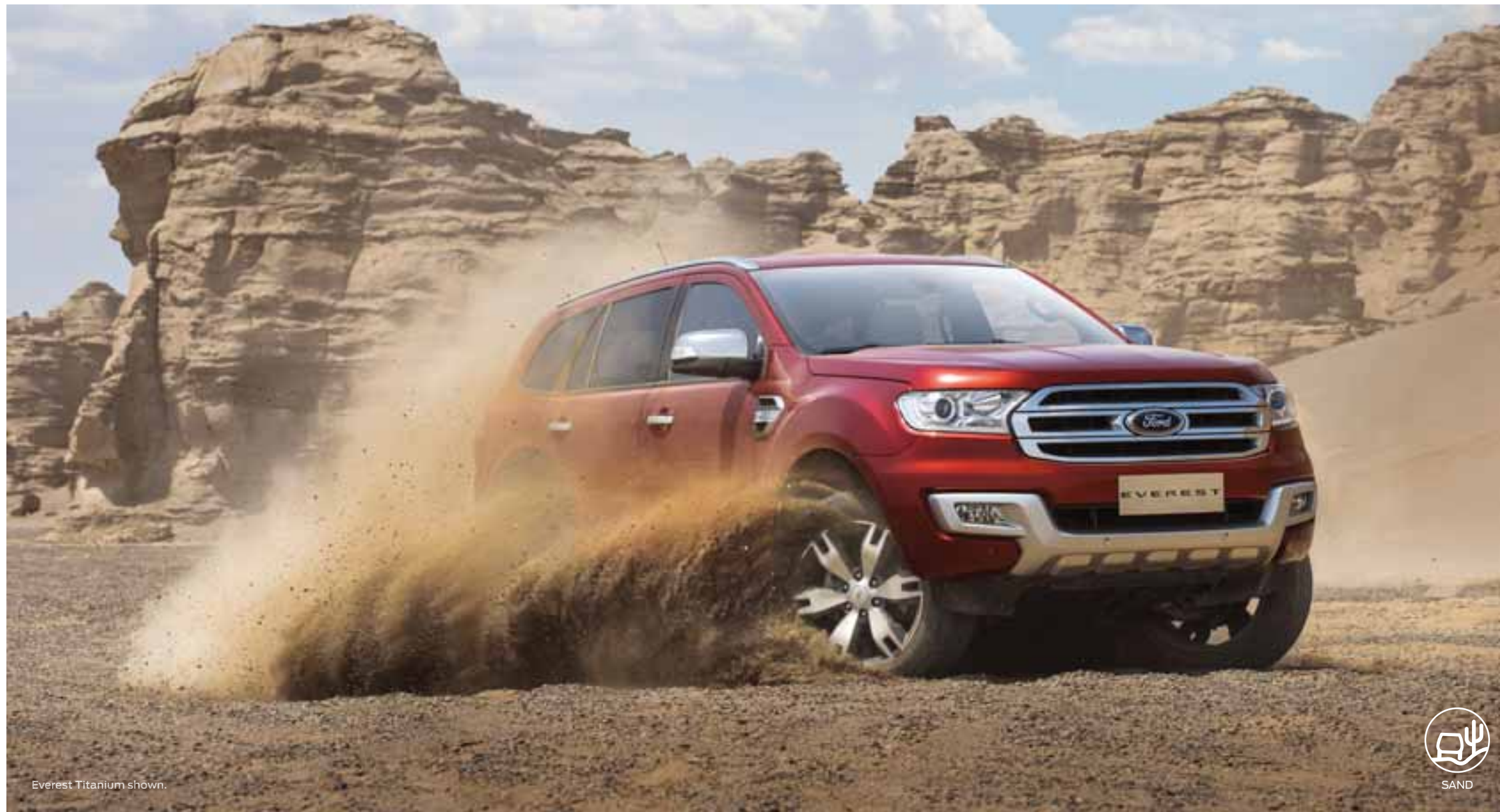
Everest Titanium shown.