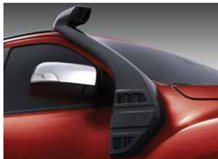
Snorkel. Draws air from roof level providing cooler cleaner air to the engine and also provides a higher air intake position to assist with water crossings.