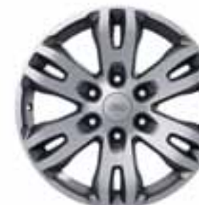
Titanium 20" wheel - standard 20" x 8.5" alloy wheels 265/50 R20 tyres Matching spare wheel & tyre