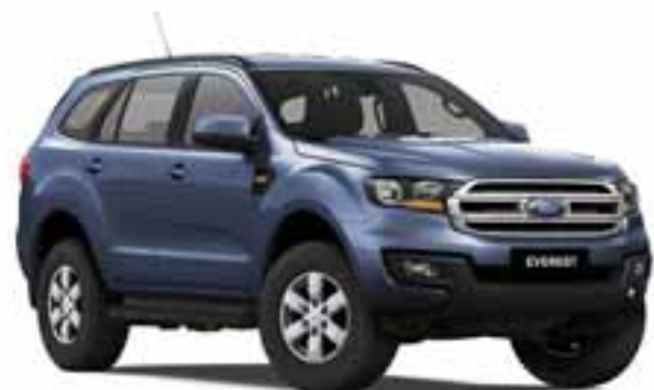
Everest Ambiente shown in Blue Reflex.