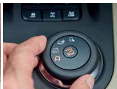
TERRAIN MANAGEMENT SYSTEM