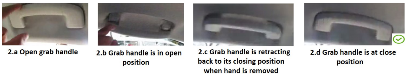
Fig. 2 – Grab handle function ok

After replacement check for proper working of new Grab handle as per Fig. 2- Grab handle function ok.