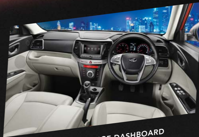
DUAL-TONE BLACK & BEIGE DASHBOARD