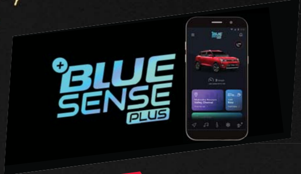
BLUE SENSE PLUS

Absolute control at your fingertips: that's what Bluesense Plus offers you. Lock/ Unlock with Phone, Live vehicle tracking & sharing, Safety & Security Alerts, Emergency Assist, Infotainment Controls and 40+ connected features.