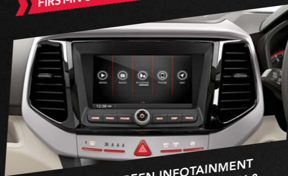
17.78 CM TOUCHSCREEN INFOTAINMENT WITH GPS NAVIGATION, APPLE CARPLAY & ANDROID AUTO™