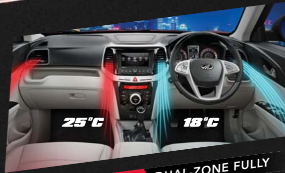
FIRST-IN-SEGMENT DUAL-ZONE FULLY AUTOMATIC TEMPERATURE CONTROL