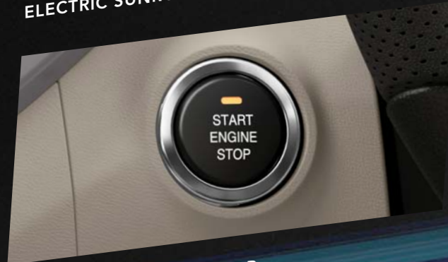
PUSH BUTTON START / STOP