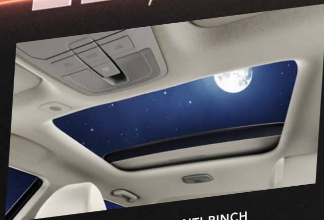
ELECTRIC SUNROOF WITH ANTI-PINCH