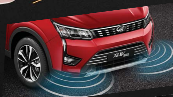
FIRST-IN-SEGMENT FRONT PARKING SENSORS

With BlueSense Plus connected SUV technology, stay connected to your XUV300 at all times. With an inviting, 17.78 cm infotainment system that dominates the center console. Get GPS navigation, connect your smartphone through Android Auto™ or Apple CarPlay and gain access to a plethora of entertainment and information options from here.