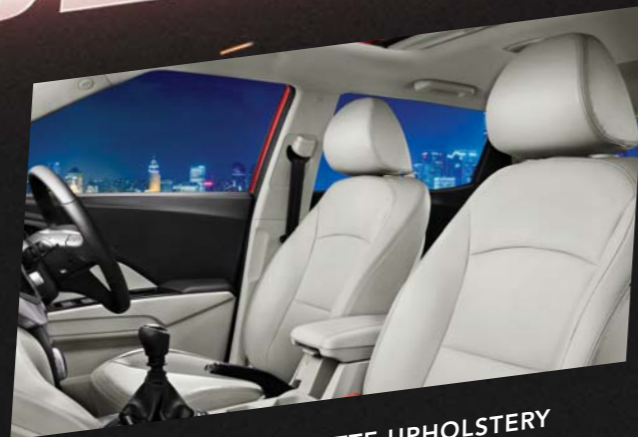
PREMIUM GREY LEATHERETTE UPHOLSTERY