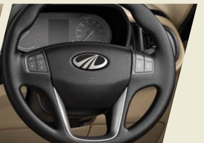
Tilt steering with mounted controls.