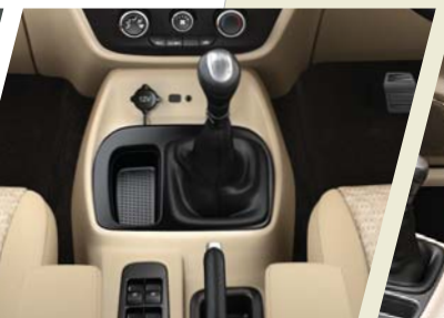
Premium center console