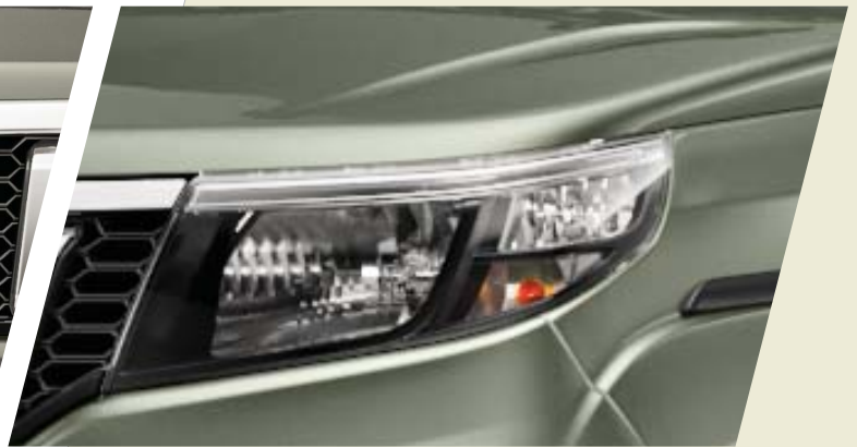
Sporty headlamps with DRLs