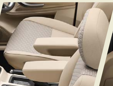
Armrests in the front and middle rows