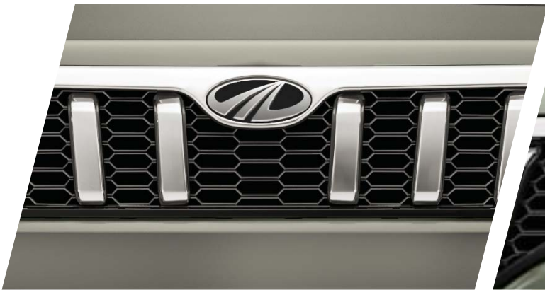
Bolero family grill with chrome inserts