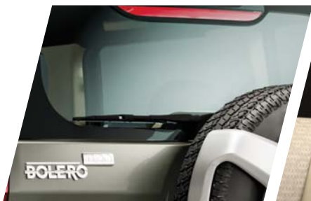
Rear wash and wipe with defogger