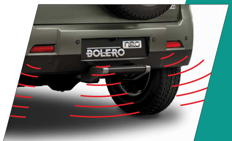
Intellipark reverse assist