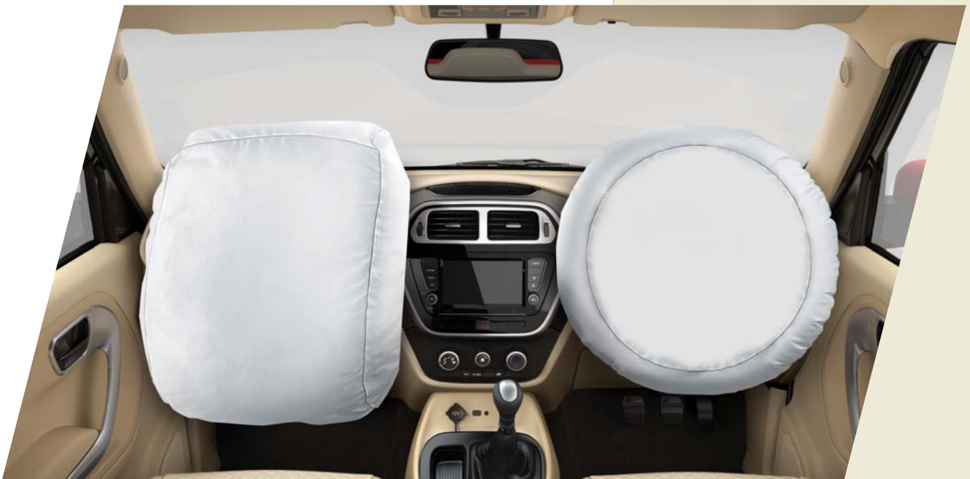
Dual airbags for driver and co-driver