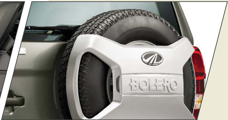
Signature Bolero branding on spare wheel cover