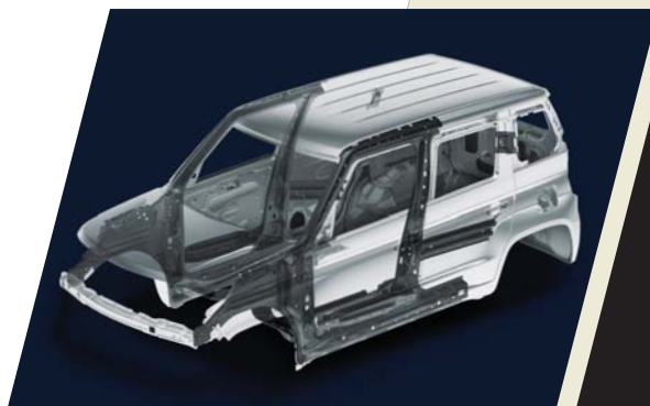
High strength steel body shell