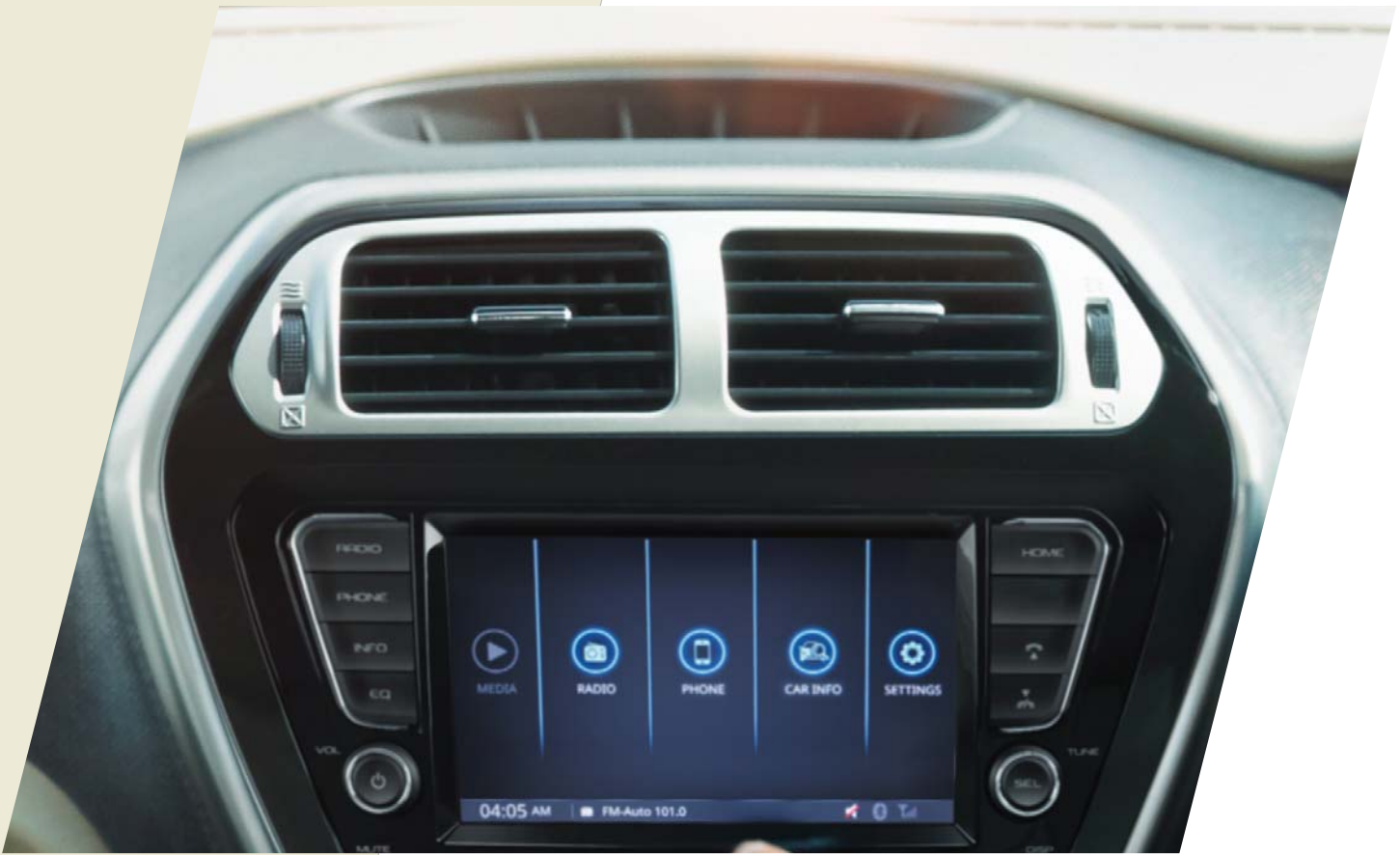
Advanced 17.8 cm touchscreen infotainment system