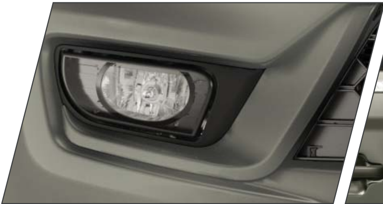
Stylish fog lamp