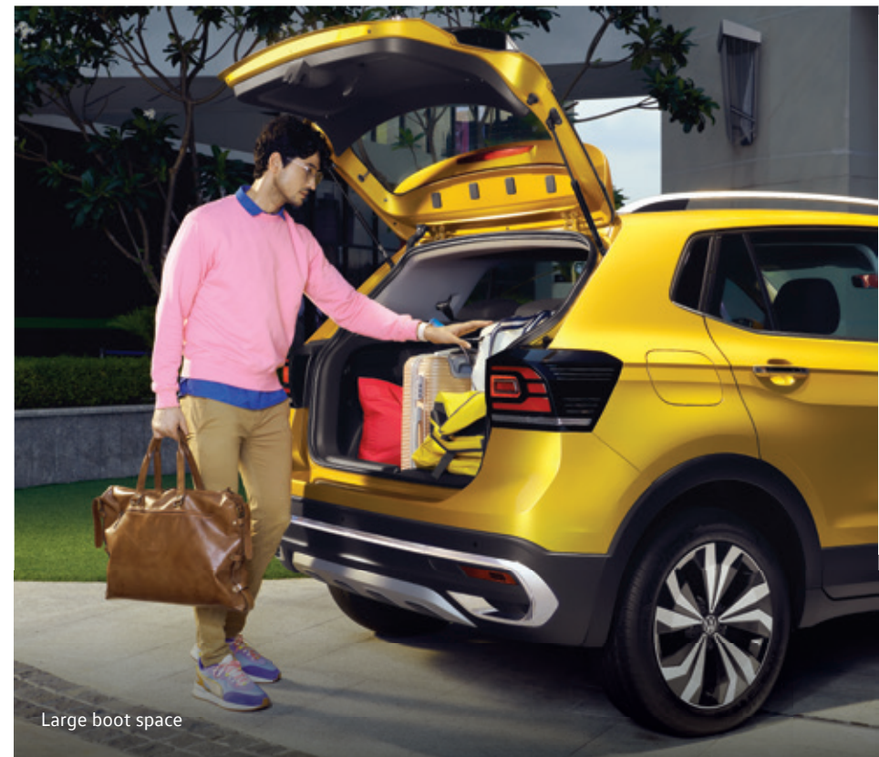
Large boot space

Once inside, the Taigun sets the mood for your hustle, with its sporty ambient lighting. The Dual tone premium interiors are designed by and for those with an eye for detail. The carbon finish complements the sporty look, while the massive boot space lets you accommodate a lot more in your everyday hustle.