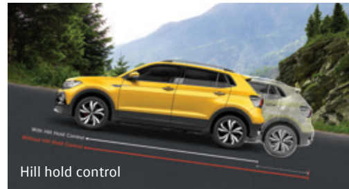
Hill hold control