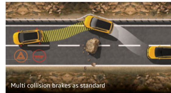
Multi collision brakes as standard

No one ever hustled to the top by playing it safe. Until now. Armed with over 40 world-class safety features like ESC (Electronic stability control) and Multi-collision brakes as standard, and up to 6 airbags, the Taigun's reliable German Engineering will always keep you safe, as you go all in.