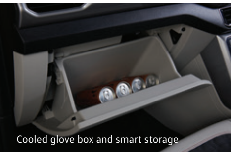
Cooled glove box and smart storage