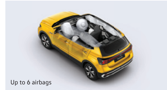
Up to 6 airbags