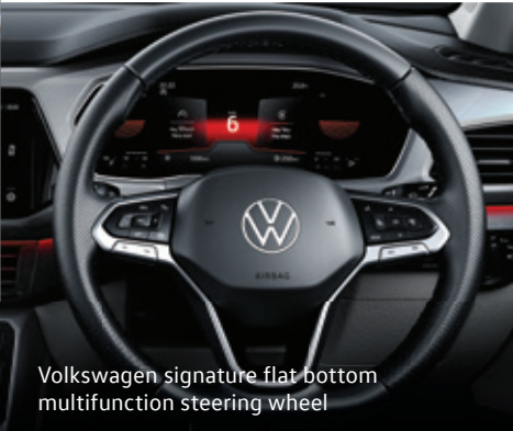
Volkswagen signature flat bottom multifunction steering wheel

The intuitive and thoughtful Taigun helps you play smart to stay ahead in the hustle. The Volkswagen signature flat bottom multi-function steering wheel allows you stay on top of all that drives you ahead. While the Smart touch Climatronic AC and the ventilated seats set the temperature and keep you comfortable in any condition.