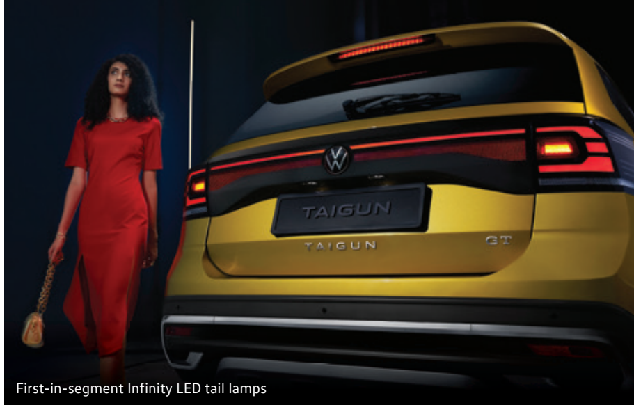
First-in-segment Infinity LED tail lamps