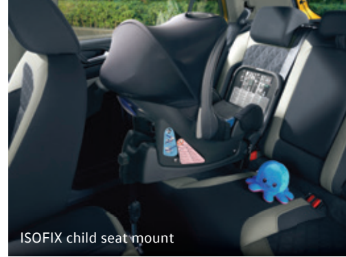
ISOFIX child seat mount