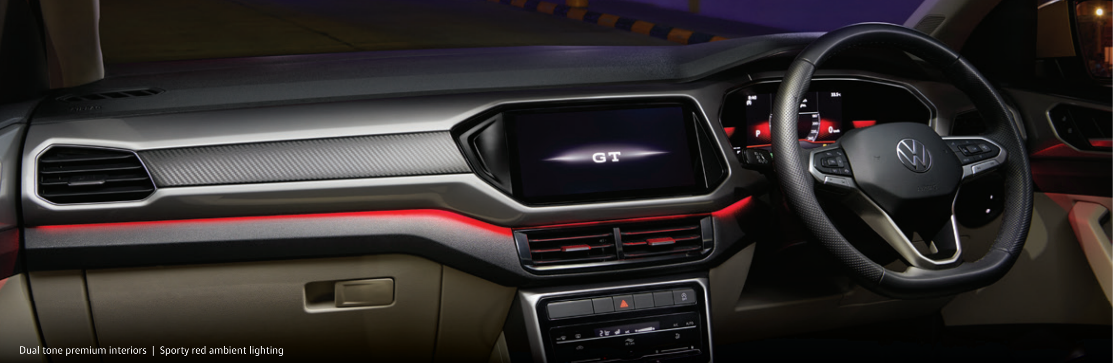
Dual tone premium interiors | Sporty red ambient lighting