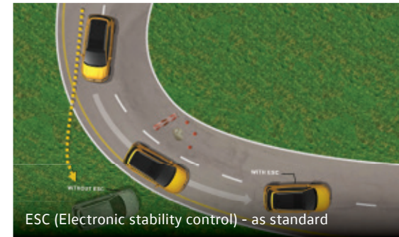
ESC (Electronic stability control) - as standard