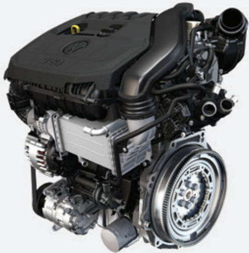
1.5 TSI EVO engine