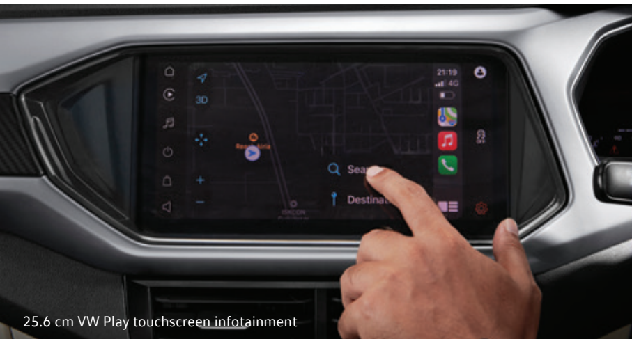
25.6 cm VW Play touchscreen infotainment

When it comes to technology, the Taigun is one step ahead. With the largest-in-segment 20.32 cm Digital cockpit, the Taigun always gives you an insight about your driving style. While the 25.6 cm VW Play touchscreen infotainment ensures that you stay connected to the hustle.