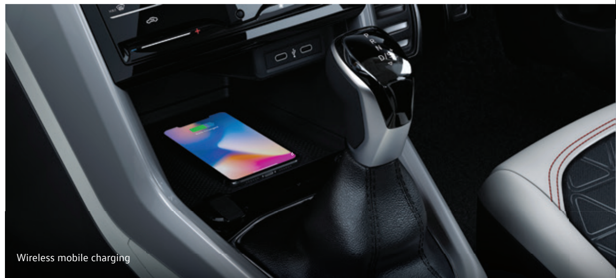
Wireless mobile charging