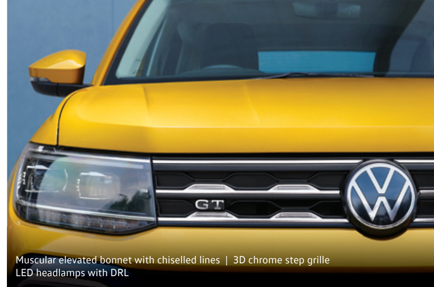
Muscular elevated bonnet with chiselled lines | 3D chrome step grille LED headlamps with DRL