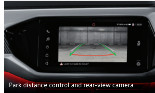
Park distance control and rear-view camera