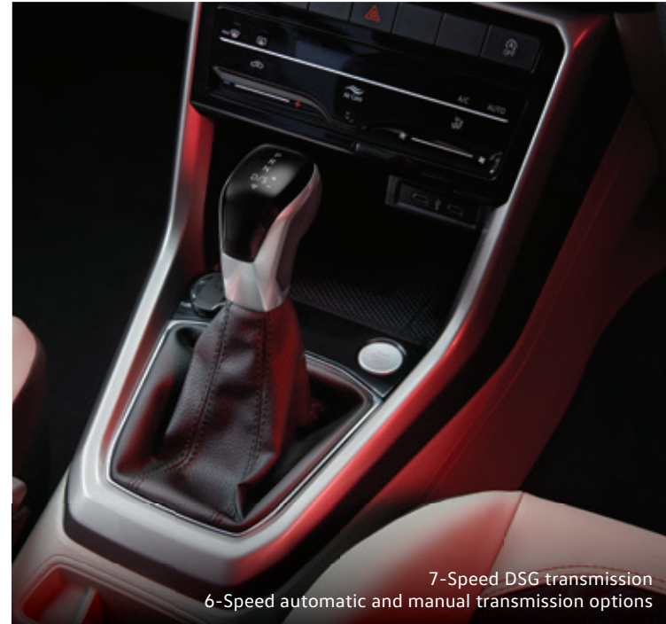
7-Speed DSG transmission 6-Speed automatic and manual transmission options

The thrill of hustle is in the chase of perfection. With the revolutionary TSI engine at its heart, the Taigun brings to the race, unabashed power combined with thoughtful efficiency. The 1.0 TSI engine available with manual and automatic transmission options, and the 1.5 TSI engine that comes with manual and DSG transmission options, lets you pick the best combination to set the pace for every chase. The Manila alloy wheels provide that edge to complement the Taigun's performance.