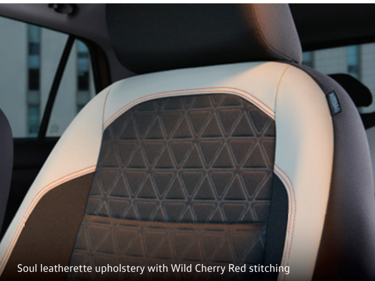
Soul leatherette upholstery with Wild Cherry Red stitching

Once inside, the Taigun sets the mood for your hustle, with its sporty ambient lighting. The Dual tone premium interiors are designed by and for those with an eye for detail. The carbon finish complements the sporty look, while the massive boot space lets you accommodate a lot more in your everyday hustle.