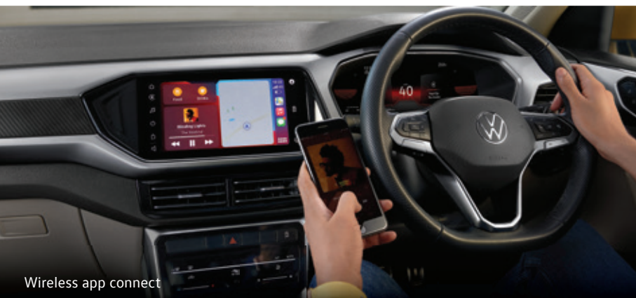
Wireless app connect