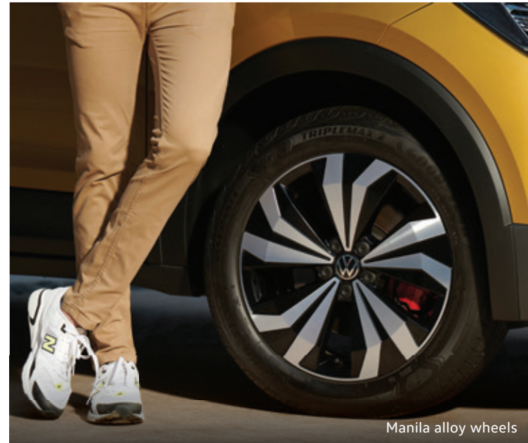
Manila alloy wheels