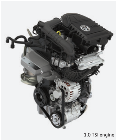
1.0 TSI engine