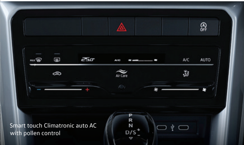
Smart touch Climatronic auto AC with pollen control