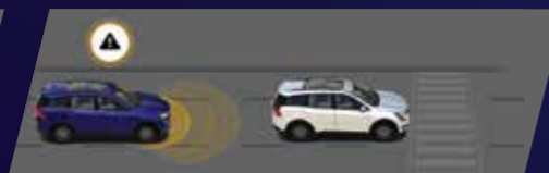
FORWARD COLLISION WARNING