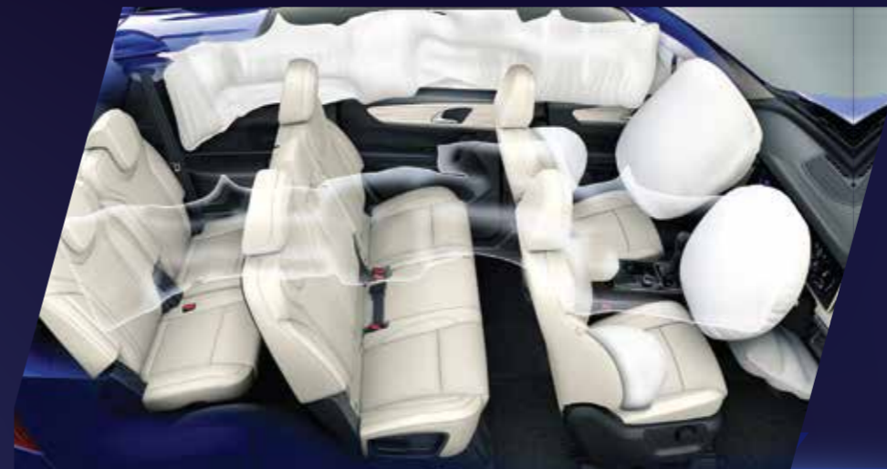
BEST-IN-CLASS 7 AIRBAG SAFETY