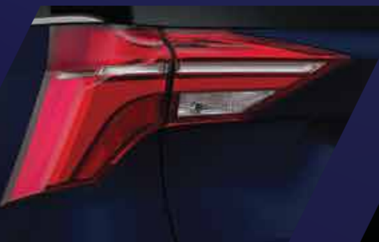
CAPTIVATING ARROW-HEAD LED TAILLAMPS