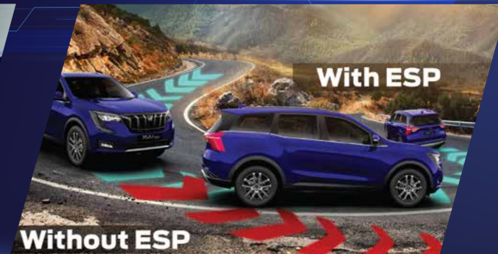
LATEST-GEN ELECTRONIC STABILITY PROGRAM