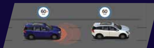
ADAPTIVE CRUISE CONTROL