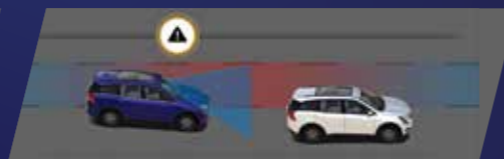
LANE DEPARTURE WARNING