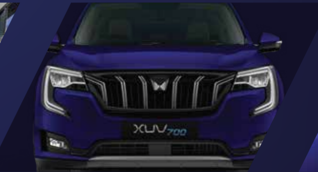
STRIKING CLEAR-VIEW LED HEADLAMPS WITH DRL AND SEQUENTIAL TURN INDICATOR