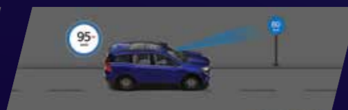
TRAFFIC SIGN RECOGNITION