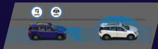
SMART PILOT ASSIST