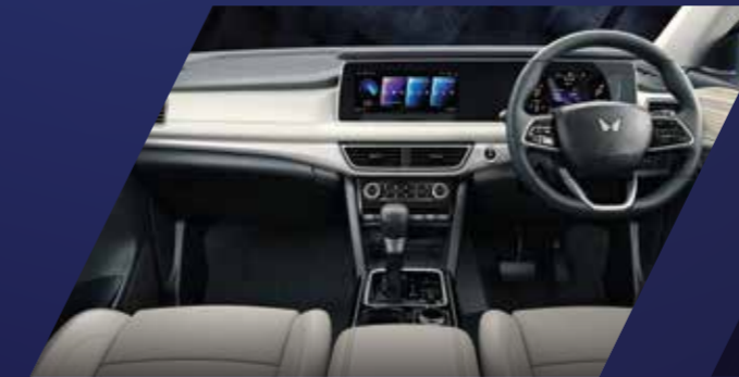
LUXURIOUS AND SOPHISTICATED INTERIORS

With the expansive Skyroof™ in the Mahindra XUV700, panoramic views are the new default. Blazing sunsets or sparkling city lights. Now bring your love for the outside, inside with every drive.