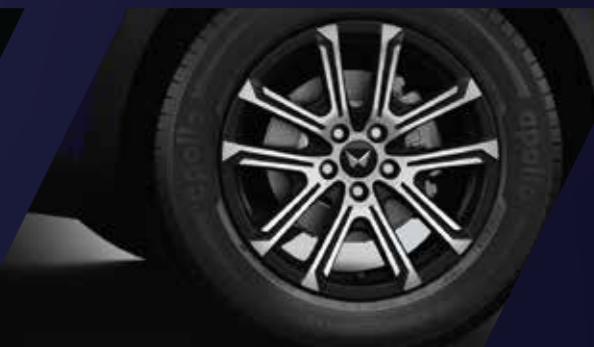
R18 DIAMOND-CUT ALLOY WHEELS