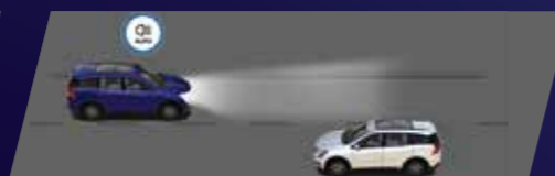
HIGH BEAM ASSIST