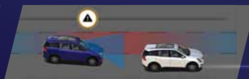
LANE KEEP ASSIST