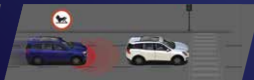
AUTOMATIC EMERGENCY BRAKING