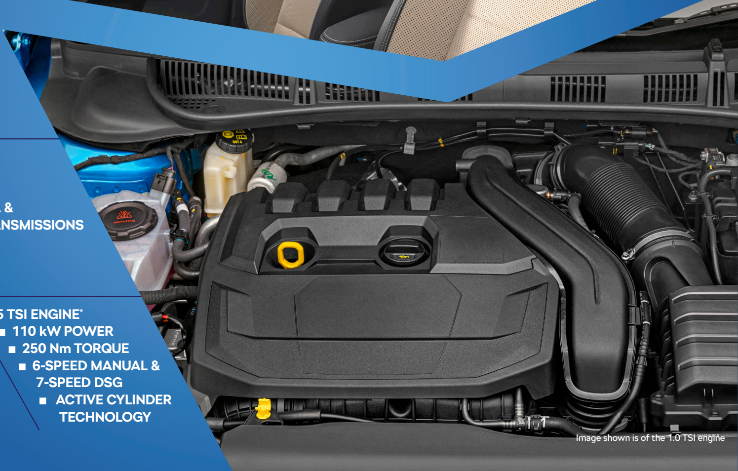
Image shown is of the 1.0 TSI engine