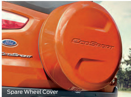
Spare Wheel Cover