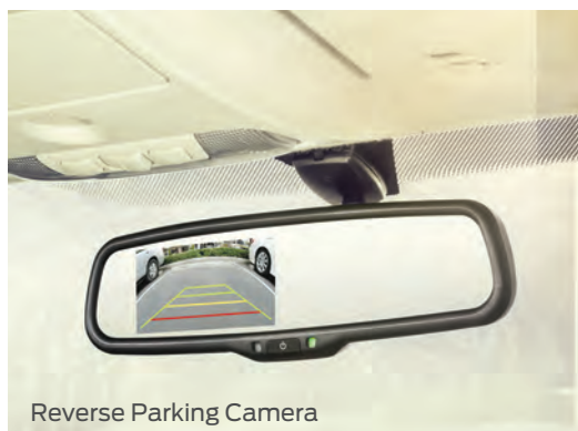
Reverse Parking Camera