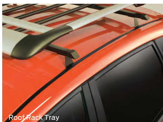
Roof Rack Tray