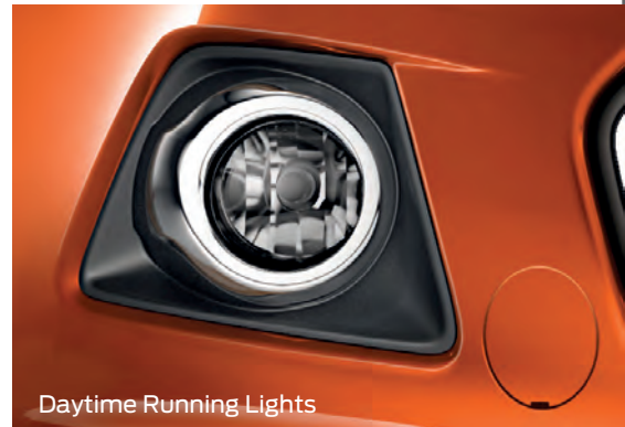
Daytime Running Lights