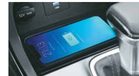
1 st & 2 nd row smartphone wireless charger