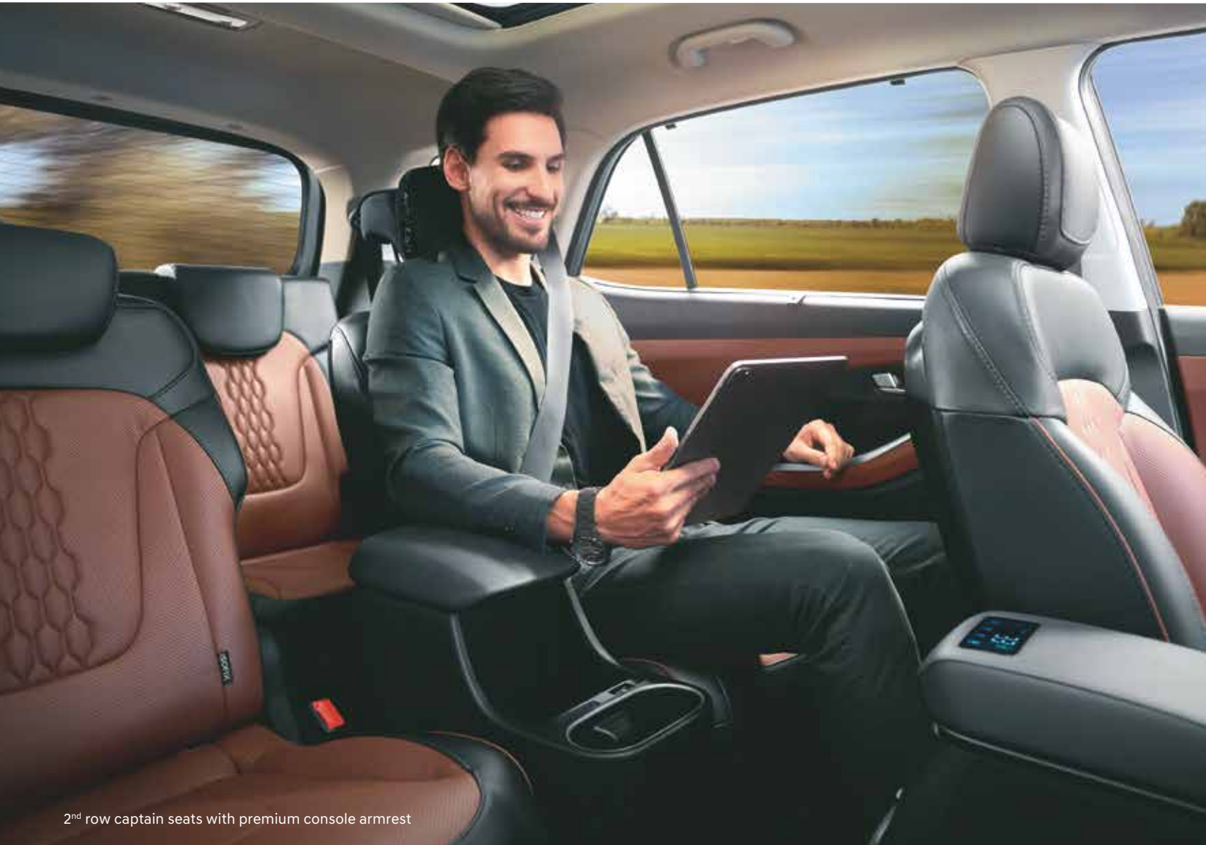
2 nd row captain seats with premium console armrest

Adore your private palatial retreat on wheels wherever the journey takes you.