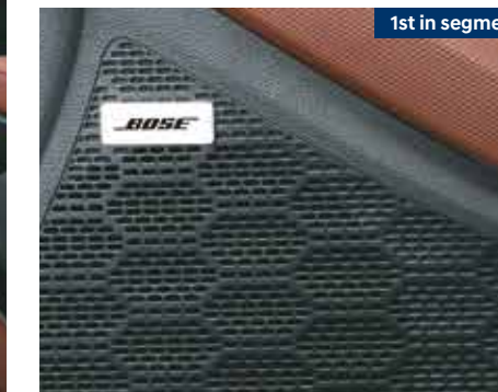
Bose premium sound system (8 speakers)