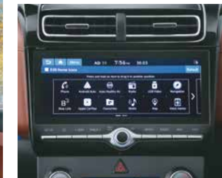
26.03 cm (10.25") HD touchscreen system