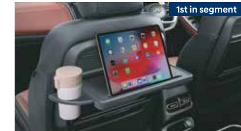
1 st in segment Front row seatback table with retractable cup-holder and IT device holder