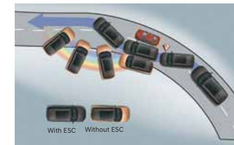
Electronic stability control (ESC)