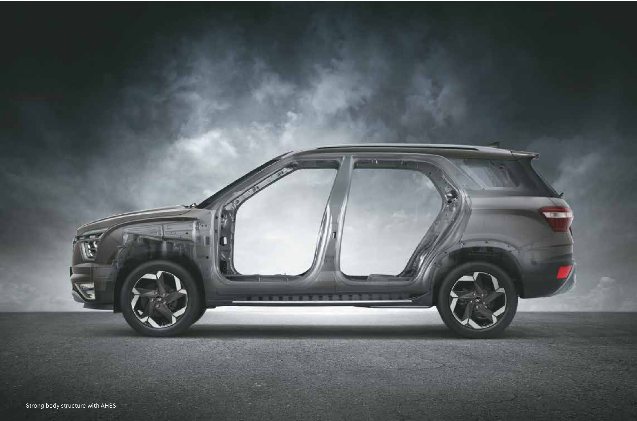
Strong body structure with AHSS