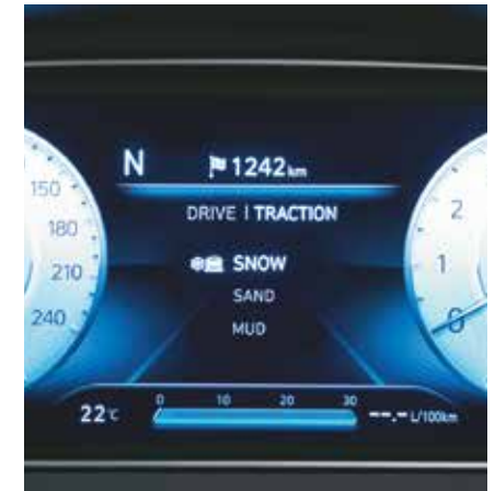
Traction control modes