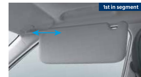
1 st in segment Front row sliding sunvisor