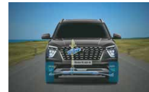
Vehicle stability management (VSM)