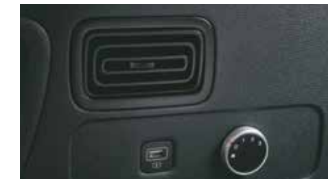
3 rd row AC vents with speed control (3-stage)