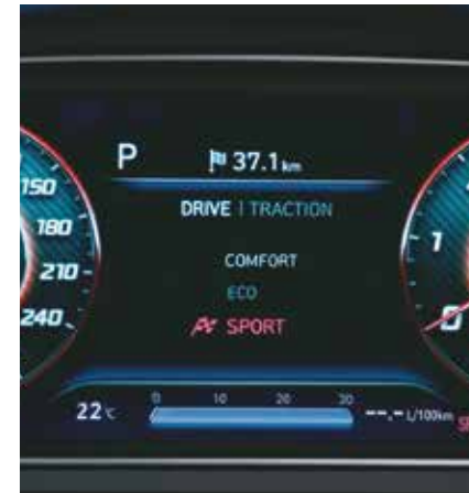
Drive mode select