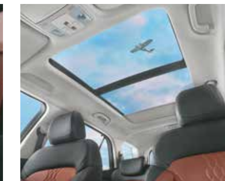
Voice enabled smart panoramic sunroof