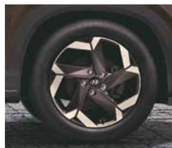
R18 (D=462 mm) Diamond cut alloys