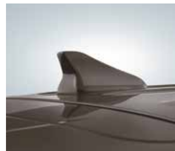
Shark fin antenna