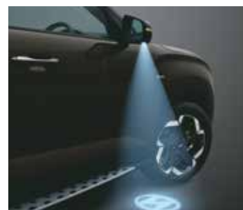
Puddle lamps with Hyundai logo projection