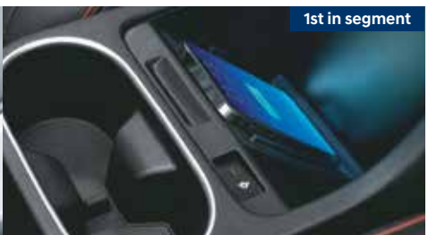
1 st in segment