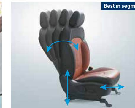
Power driver seat – 8 way