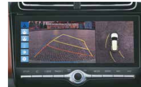
Surround view monitor (SVM)