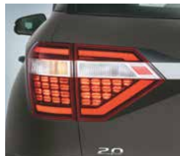
Honey-comb inspired LED tail lamps