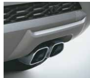
Twin tip exhaust