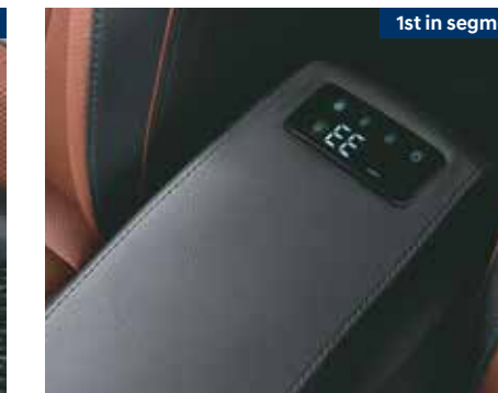
Auto healthy air purifier with AQI display