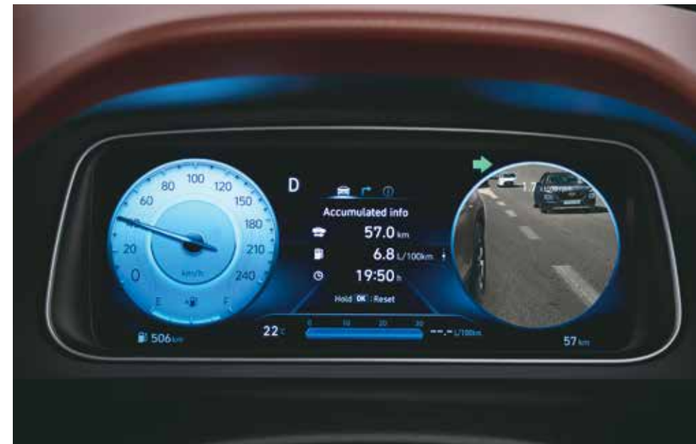
Blind view monitor (BVM)

Each element of the Hyundai ALCAZAR has been designed to provide excellence, in comfort and in safety. Complete with highly accurate front & rear parking sensors and state-of-the-art security alerts like speed alert system, you're always one step ahead of unexpected events on the road. Each journey in the Hyundai ALCAZAR inspires awe and admiration as it carries passengers in uncompromised safety.