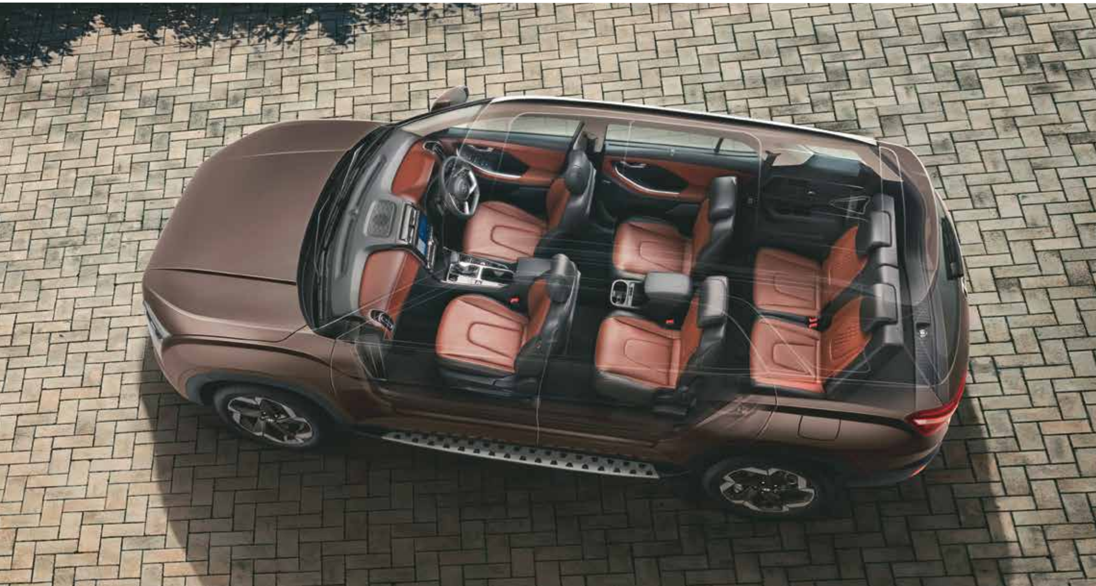
Leather pack: Perforated D-cut steering wheel | Perforated gear knob | Cognac brown and black seat upholstery | Door armrest

The interior of the Hyundai ALCAZAR immerses you in uncluttered design. Complete with premium dual tone cognac brown interiors, the 64 colours ambient lighting offers a regal touch to the cabin. Carefully selected materials accentuate the aesthetic, complete with Hyundai ALCAZAR's advanced technology, ensuring that your entertainment knows no bounds. Experience serenity thanks to a voice controlled panoramic sunroof and an auto healthy air purifier. The tranquil sanctuary is also outfitted with an HD touchscreen system with powerful Bose premium sound system, immersing you in a rich and balanced premium audio experience.