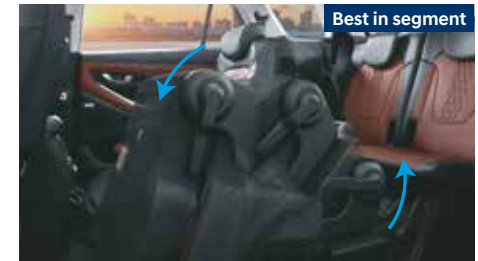
Best in segment 2 nd row - one touch tip tumble captain & split seats