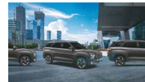
Parking assist: Front and rear parking sensors

Other features: Emergency stop signal | Speed alert system | Speed sensing auto door lock | Driver rear view monitor Impact sensing auto door unlock | Child seat anchor (ISOFIX) | Electric parking brake with auto hold