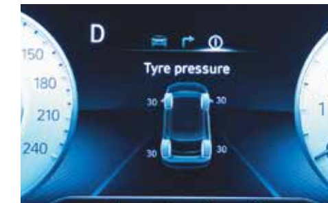
Tyre pressure monitoring system (Highline)