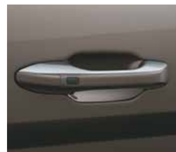
Dark chrome exterior finish outside door handles

Other features: LED positioning lamps | Crescent glow LED DRLs | Trio beam LED headlamps Dark chrome exterior signature cascading grille | LED fog lamps