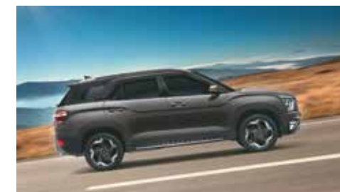
Hill start assist control (HAC)