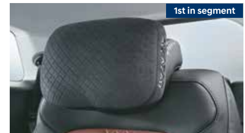
1 st in segment 2 nd row headrest cushion