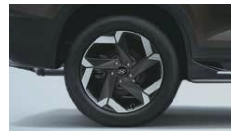
Rear disc brakes