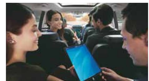
4 USB chargers for 3 rows