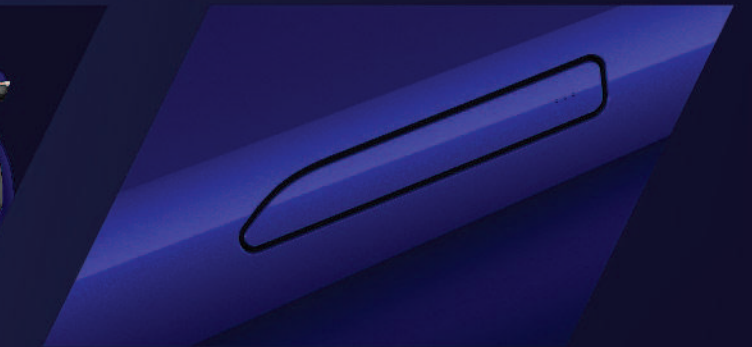
SMART DOOR HANDLES