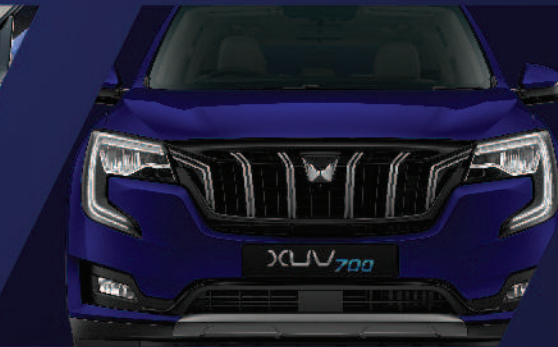
STRIKING CLEAR-VIEW LED HEADLAMPS WITH DRL AND SEQUENTIAL TURN INDICATOR