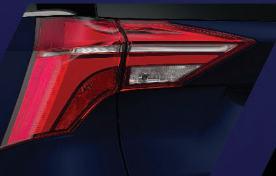
CAPTIVATING ARROW-HEAD LED TAILLAMPS