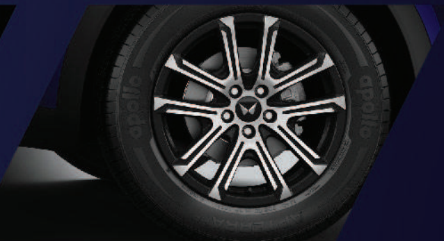
R18 DIAMOND-CUT ALLOY WHEELS