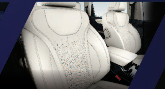
PLUSH LEATHERETTE SEATS