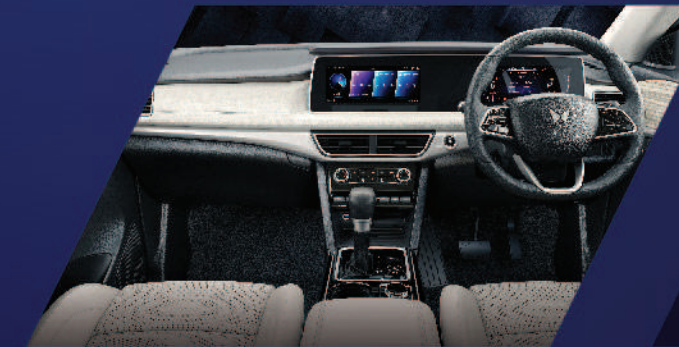
LUXURIOUS AND SOPHISTICATED INTERIORS

With the expansive Skyroof™ in the Mahindra XUV700, panoramic views are the new default. Blazing sunsets or sparkling city lights. Now bring your love for the outside, inside with every drive.