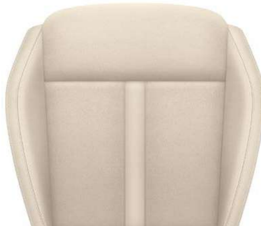
BEIGE SUEDE LEATHER