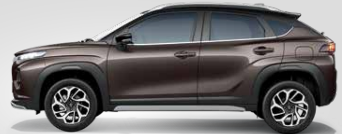
EARTHEN BROWN + BLUISH BLACK