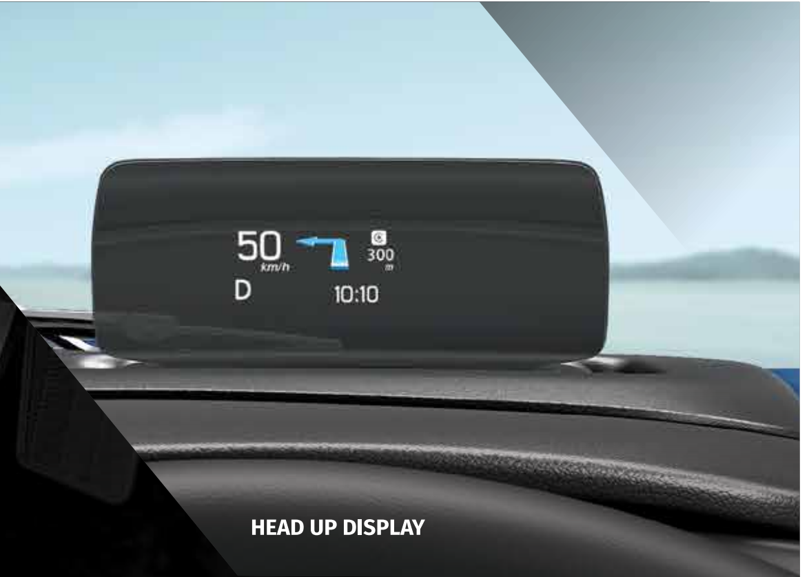
HEAD UP DISPLAY