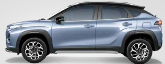
SPLENDID SILVER + BLUISH BLACK