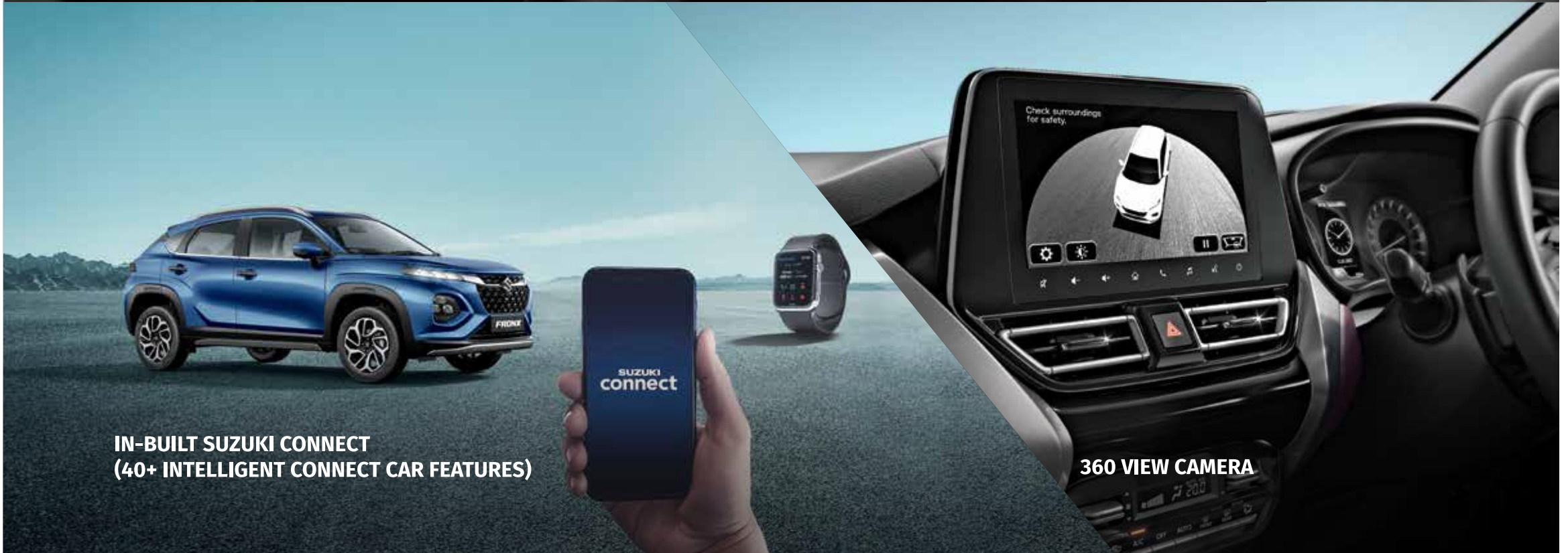
IN-BUILT SUZUKI CONNECT (40+ INTELLIGENT CONNECT CAR FEATURES)