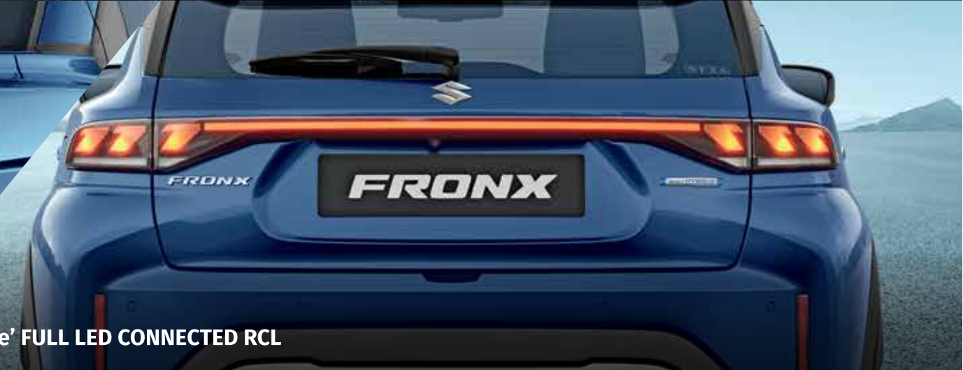
NEXTre' FULL LED CONNECTED RCL