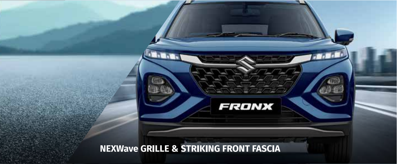
NEXWave GRILLE & STRIKING FRONT FASCIA