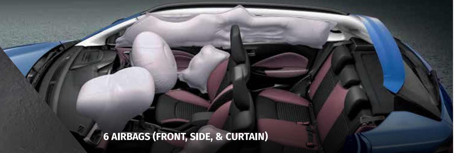
6 AIRBAGS (FRONT, SIDE, & CURTAIN)