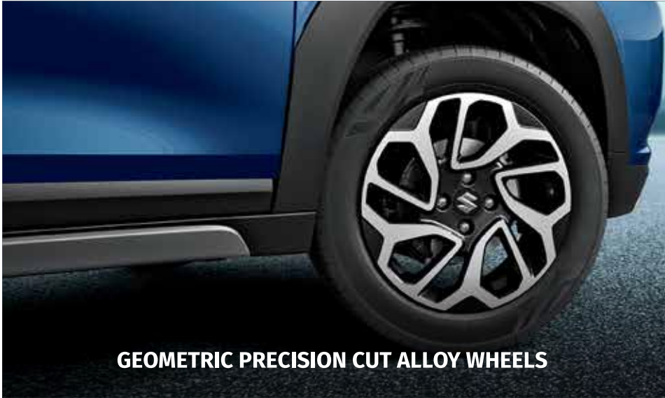
GEOMETRIC PRECISION CUT ALLOY WHEELS