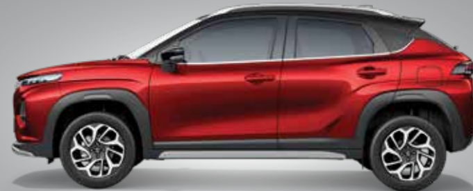
OPULENT RED + BLUISH BLACK