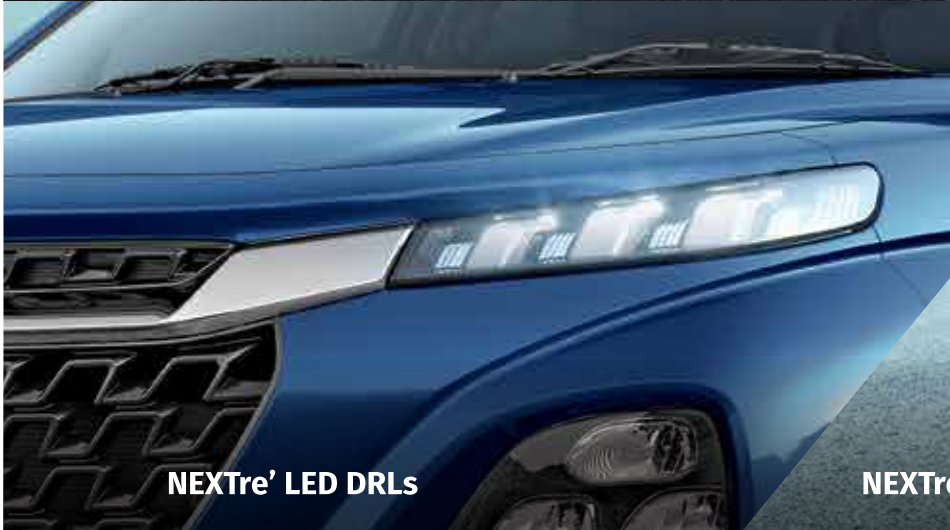
NEXTre' LED DRLs