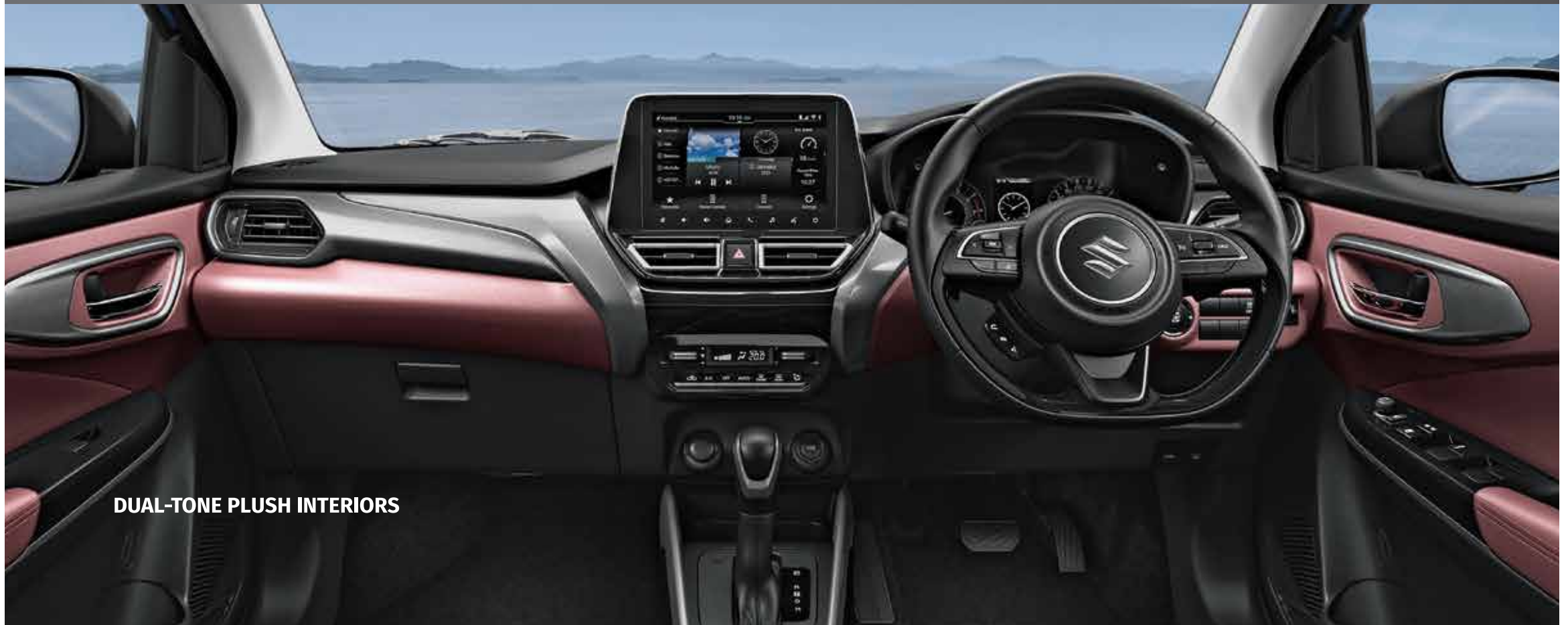
DUAL-TONE PLUSH INTERIORS

From the moment you step in, FRONX enhances the SUV experience with its structural precision and integrated function. The dual-tone dashboard with special forged metal finish and accents seamlessly connects the steering, infotainment system and rounds off the interiors in style. Cruise control and steering-mounted controls ensure you never have to take your hands off the wheel. What amps up the luxury for you, and yours, are details like the driver armrest; rear AC vents; and rear fast charging.