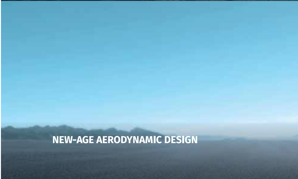
NEW-AGE AERODYNAMIC DESIGN