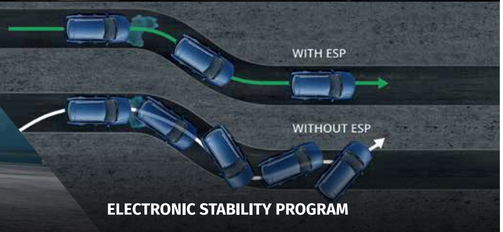
ELECTRONIC STABILITY PROGRAM