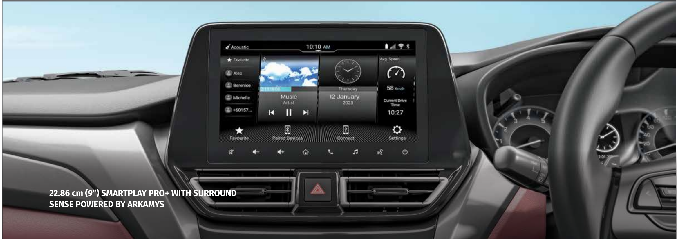
22.86 cm (9") SMARTPLAY PRO+ WITH SURROUND SENSE POWERED BY ARKAMYS

While FRONX is tuned to perform, it is also primed with technology. The 22.86 cm (9") SmartPlay Pro+ Infotainment System takes center stage and offers an HD display with acoustic pleasure at your fingertips. Couple that with the 360 View Camera, Wireless Charging, Heads-Up Display and Next-Gen Suzuki Connect — and you get an unparalleled driving experience, sharpened by technology.