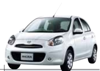
● Storm White