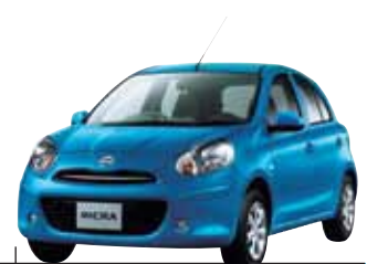
● Pacific Blue (PM)