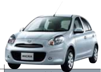
● Blade Silver (M)