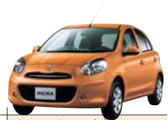
● Sunlight Orange (M)