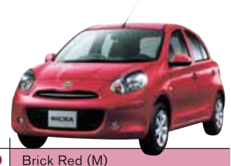
● Brick Red (M)