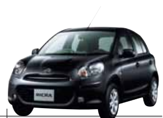
● Onyx Black