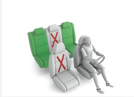
BeSafe iZi Kid X3 ISOFix (ISOFIX)