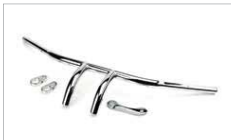
TWIN "T" HANDLEBAR ✂ 0.5 Supplied complete with High quality chrome plated cast cable/harness guides. A9638044