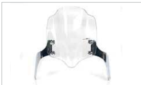
SPORT SCREEN ✂ 0.5 Requires front end fixing kit, A9738051. A9748048