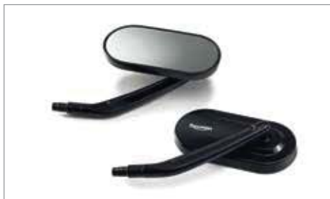
OVAL MIRRORS - BLACK ✂ 0.2 Satin Black finish. Fits all Triumph Cruisers. A9638084