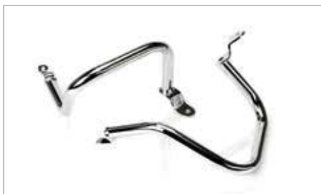
REAR DRESSER BAR KIT ✂ 0.4 Supplied complete with all mounting hardware and chromed mount finishers. A9738119