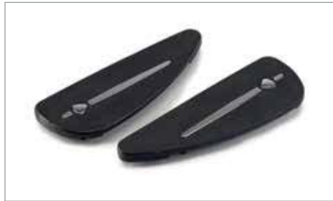
"CHROME LINE" RIDER FOOTBOARD MATS ✂ 0.1 Chromeline Upgrade for Classic Rider Footboard kit, A9758157. A9718014