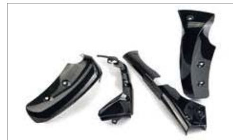
RADIATOR END CAPS - PAINTED ✂ 0.4 Painted alternative to the chrome end caps which are standard on the Rocket III. A9748026-##