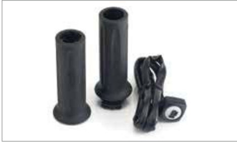
HEATED GRIP KIT ✂ 1.3 Fits all Triumph thunderbird handlebar options. Internally wired with dual colour heat indicator. A9638123