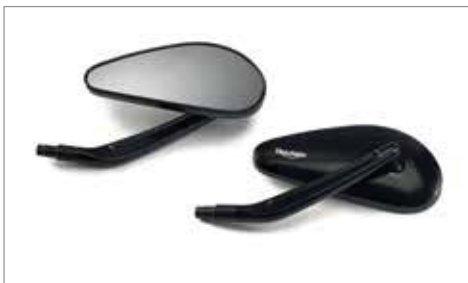
TEARDROP MIRRORS - BLACK ✂ 0.2 Tapered Teardrop Style. Satin Black finish. Fits all Triumph Cruisers. A9638085