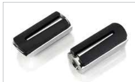
"CHROME LINE" HIGHWAY PEGS ✂ 0.2 Features rubber foot grip and Triumph logo. For use with either A9750455 or A9750463 Mounting Kits. Requires Engine Dresser Bars A9738118. A9750523