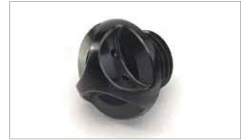
CNC MACHINED OIL FILLER CAP - BLACK ✂ 0.1 Stylish 'Tri Corner' CNC machined oil filler cap finished in black. A9610209