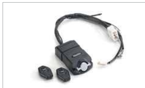
ALARM KIT, S4, THATCHAM ✂ 1.0 Supplied with 2 x Waterproof Alarm Fob's which can be integrated with ignition key. A9808112