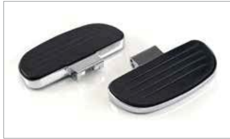
"CLASSIC" PILLION FOOTBOARDS ✂ 0.2 To be installed in conjunction with Adjustable Pillion Footboards hardware kit, A9758125. A9758159