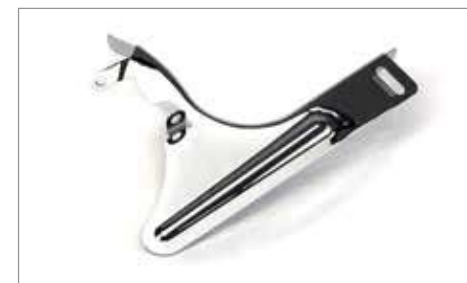
LOWER BELT GUARD - CHROME ✂ 0.2 Ideal for use with chrome Swingarm Covers, A9738134. A9738135