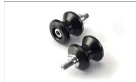
CNC MACHINED NYLON Paddock STAND BOBBINS ✂ 0.1 Nylon paddock stand bobbins for use with Street Triple and Daytona 675. VIN specific product - consult parts catalogue. A9640022