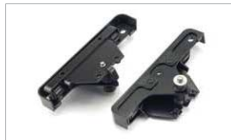
PANNIER MOUNTING KIT ✂ 1.0 Required to fit Leather Pannier Kit, T2350853. A9528030