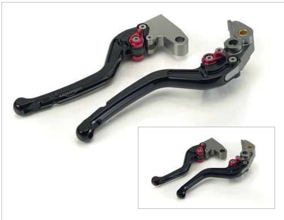
CNC MACHINED BRAKE & CLUTCH LEVERS – RADIAL MASTER CYLINDER ✂ 0.2 CNC machined brake and clutch levers manufactured from Aerospace grade aluminium with a hard anodised finish. Featuring Contrasting red span adjusters and laser etched Triumph branding. A9620027 / A9620029