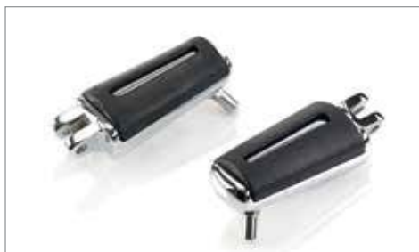
"CHROME LINE" RIDER FOOTPEGS ✂ 0.2 Chromed Rider Foot Peg featuring high gloss detailing with high grip rubber insert. A9718013