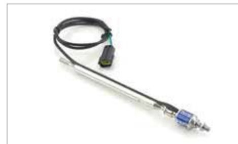
TRIUMPH INTELLISHIFT QUICKSHIFTER ✂ 0.5 New Intellishift Quickshifter functionality for seamless efficient gearchanges. A9930222