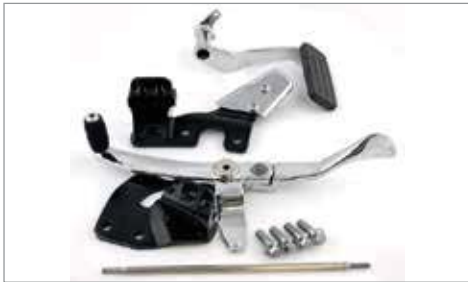
RIDER FOOTBOARD HARDWARE KIT ✂ 1.3 To be installed with Rider Footboard kits, A9758157 or A9758158. A9758124