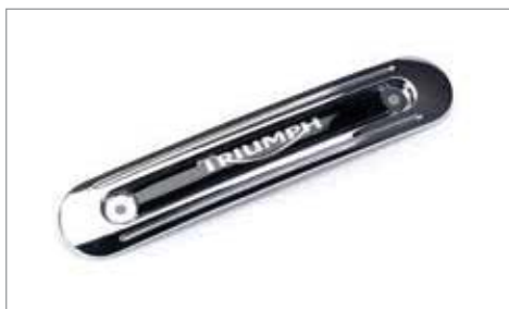
OIL TANK EMBELLISHER - TRIUMPH ✂ 0.1 Chrome plated Oil Tank Embellisher replaces original equipment part. A9738140