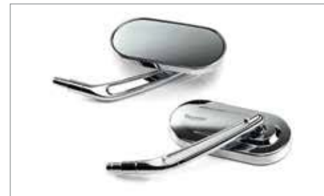
OVAL MIRRORS - SOLID STEM ✂ 0.2 High gloss chrome mirror kit, featuring laser etched Triumph logo. A9638031