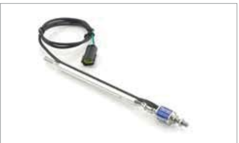
TRIUMPH INTELLISHIFT QUICKSHIFTER ✂ 0.5 New intellishift quickshifter functionality for seamless efficient gearchanges. A9930222