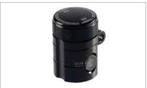
CNC MACHINED REAR BRAKE RESERVOIR ✂ 0.5 Features sight glass and knurled lid. Laser etched with Triumph Logo. T2025065