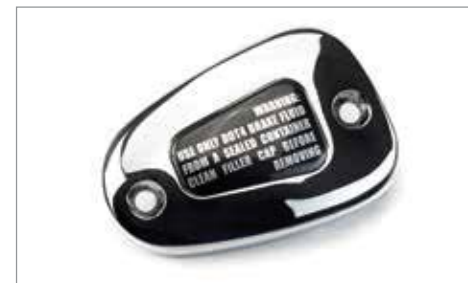
MASTER CYLINDER COVER - CHROME ✂ 0.1 High gloss chrome alternative to standard equipment. A9738061