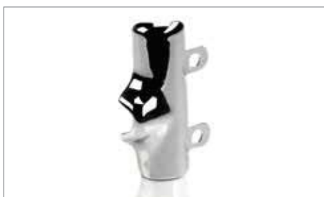
REAR MASTER CYLINDER COVER - CHROME ✂ 0.6 High gloss chrome version of the original equipment part. A9738148