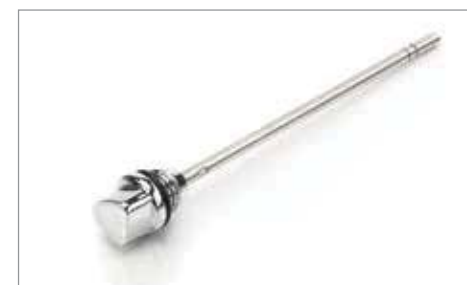
OIL FILLER CAP - CHROME ✂ 0.0 Chrome plated oil filler/dipstick. Features "Tri-Corner" ergonomic grip with smooth top. A9610201