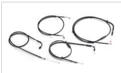
EXTENDED CABLE KIT - ABS MODELS ✂ 1.0 Long Cable Kit for use with Wide Handlebars, A9638026. A9638072