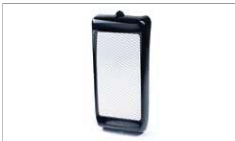
RADIATOR COVER - PAINTED ✂ 0.2 Factory colour coded Radiator cover manufactured from high strength ABS. (Black is std equipment). A9708232-##