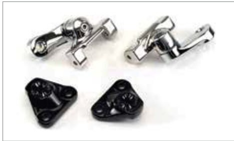
PILLION FOOTBOARD HARDWARE KIT ✂ 0.5 Adjustable mounts to be installed with Pillion Footboards, A9758159 or A9758160. A9758125