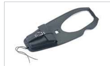
LEATHER TANK COVER ✂ 0.2 Features chrome plated cast buckle with embossed Triumph logo. A9520100