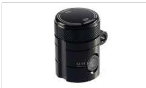
CNC MACHINED REAR BRAKE RESERVOIR ✂ 0.5 Features sight glass and knurled lid. Laser etched with Triumph Logo. T2025065