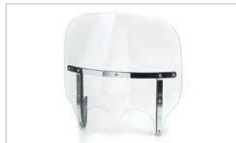
ROADSTER SCREEN ✂ 0.3 Requires front end fixing kit, A9738051. A9748036