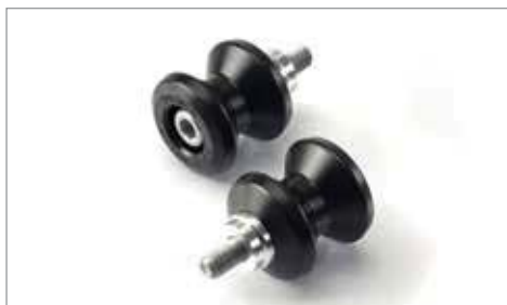
PADDOCK STAND BOBBINS - NYLON ✂ 0.1 Nylon Paddock Stand Bobbins for use with Street Triple and Daytona 675. Vin specific product, consult Parts Catalogue. A9640022