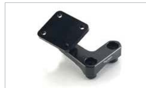
GPS MOUNT ✂ 0.2 CNC machined GPS mount designed to accommodate the Garmin Nuvi 660 & 220 units. (May fit others) A9820012