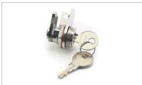
QUICK RELEASE SCREEN LOCK KIT ✂ 0.2 Supplied complete with two keys. Fits with Quick Release Screen kits A9700316, A9741024 & A9700318. (Does not fit Storm). A9748076