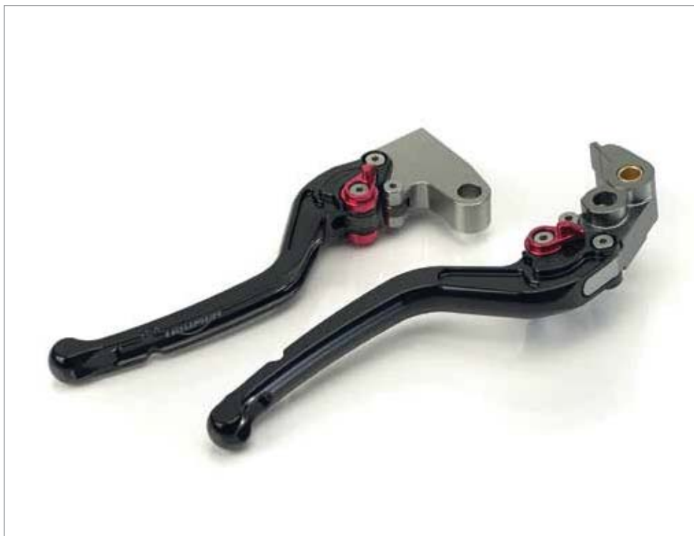
MACHINED ALLOY LONG LEVERS - RADIAL ✂ 0.2 CNC machined brake and clutch levers. Manufactured from aerospace grade aluminum with hard anodized finish. Featuring contrasting machined and anodized span adjusters and laser etched Triumph branding. Suitable for "R" models only. A9620027