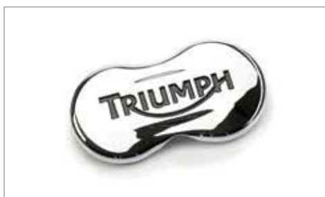
REAR CALIPER CAP - CHROME ✂ 0.1 Single Caliper Cap, featuring embossed Triumph Logo. Supplied complete with 3m adhesive fixings. A9730641