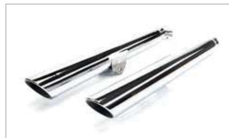
HIGH FLOW SILENCER KIT - LONG* ✂ 0.7 Off-road use only. Can be installed with Performance Air Filter and Big Bore Kit. Requires engine tune download. A9618052