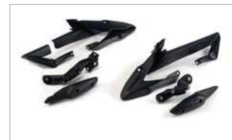
FRAME PROTECTORS ✂ 1.0 Nylon frame protectors designed to minimise frame damage in the event of a fall. Designed to integrate perfectly with the Daytona 675 bodywork. A9788014