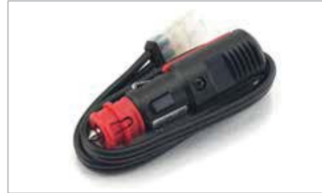
OPTIMATE ADAPTOR ✂ 0.0 Facilitates use of a Battery Optimiser when used in conjunction with an auxiliary power socket. A9930011