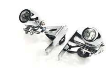
FOG LIGHT KIT ✂ 0.9 Streamlined auxiliary lamps offering functionality and style. Requires Front End Fixing Kit, A9738051. A9938142