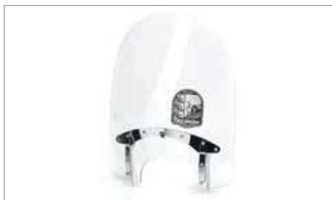
QUICK RELEASE ROADSTER SCREEN ✂ 0.1 Approximately 57cm high. (measured from headlamp cut out.) Requires A9750510 Mounting kit. (Does not fit Storm). A9700316