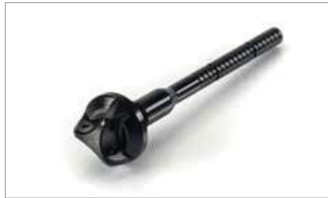
CNC MACHINED OIL DIPSTICK - ANODISED BLACK ✂ 0.1 Stylish 'Tri Corner' CNC machined oil dipstick finished in black. A9610128