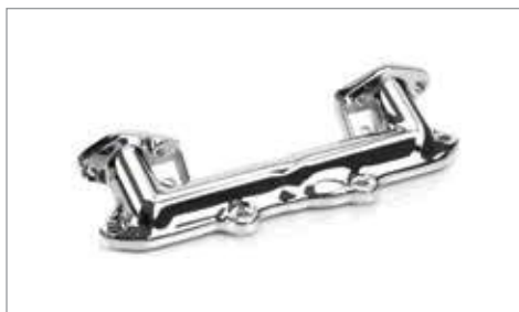
WATER MANIFOLD - CHROME ✂ 1.0 Supplied with replacement gasket & fasteners. A9738132