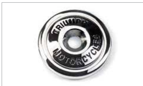
REAR FENDER MEDALLION - CHROME ✂ 0.1 Requires removal of Pillion Seat unit. A9738114