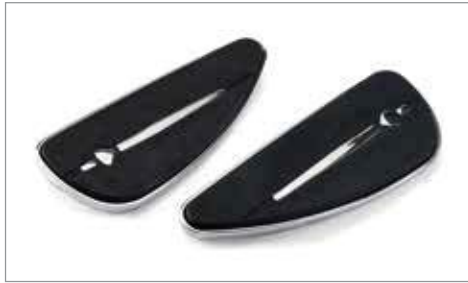
"CHROME LINE" RIDER FOOTBOARDS ✂ 0.2 To be installed in conjunction with rider footboards hardware & controls kit, A9758124. A9758158