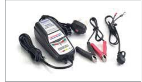
TRIUMPH BATTERY OPTIMISER ✂ 0.0 Fully Automatic Battery Charger for lead acid batteries. A9930218 (UK) A9930219 (EU)