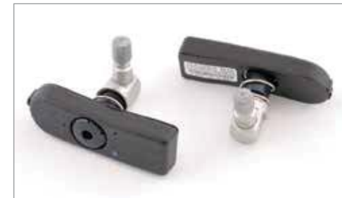
TYRE PRESSURE MONITORING SYSTEM ✂ 1.0 Current front and rear tyre pressures are displayed via instrument panel. Utilises integral warning light within instrument assembly. Supplied with wheel rim warning stickers. Dealer install only (must sync with ECM). A9640057