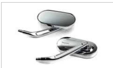
OVAL MIRRORS - SOLID STEM ✂ 0.2 High gloss chrome mirror kit, featuring laser etched Triumph logo. A9638031