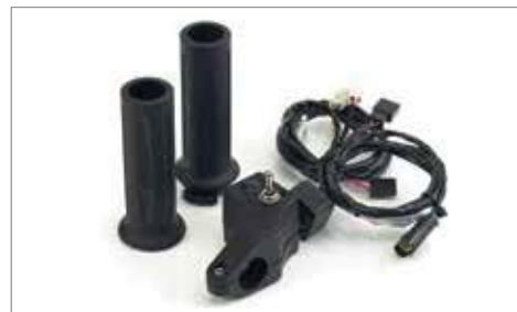
HEATED GRIP KIT ✂ 1.3 Internally wired heated grip kit and switch mount. A9638053