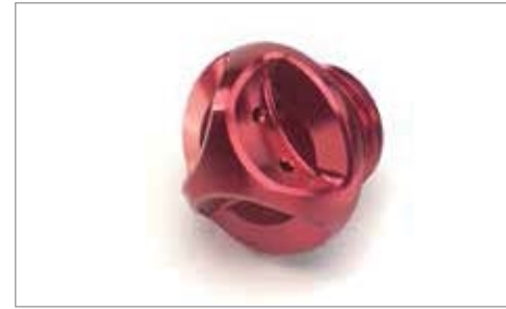
CNC MACHINED OIL FILLER CAP - RED ✂ 0.1 Stylish 'Tri Corner' CNC machined oil filler cap finished in red. A9610210