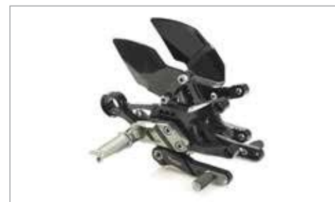
CNC MACHINED ADJUSTABLE REARSETS ✂ 0.7 Fully machined rearsets offering 20mm of lateral and vertical adjustment. Finished in anodised grey and black with carbon fibre heel guards. A9770044