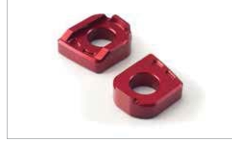
CNC MACHINED CHAIN ADJUSTERS - RED ANODISED ✂ 0.3 Machined and anodised replacement for OE part offered for fitment to Street Triple or Daytona 675 models. A9640046