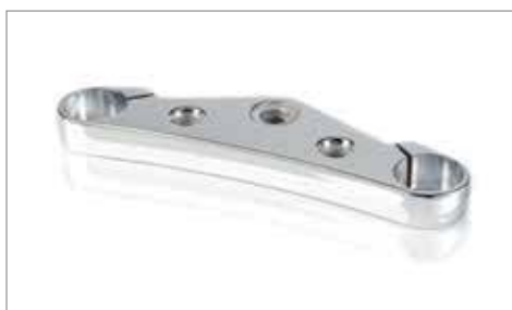
UPPER YOKE - CHROME ✂ 1.0 High gloss, hand polished triple plated chrome Upper Yoke, supplied complete with replacement fasteners. A9638051