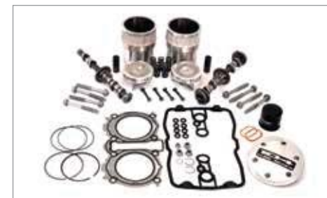
BIG BORE PERFORMANCE KIT - 1700CC ✂ 10.0 Dealer fit only. Can be installed in conjunction with Performance Air Filter and Hi Flow Silencers (Storm 1700cc as standard). A9618043