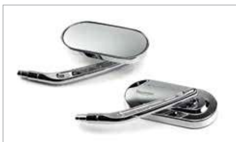
OVAL MIRRORS - DRILLED STEM ✂ 0.2 High gloss chrome mirror kit, featuring laser etched Triumph logo. A9638032