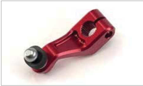
GEAR ACTUATOR RED ✂ 0.2 Machined and anodised replacement for OE part offered for fitment to Street Triple or Daytona 675 models. A9610125