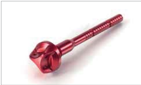
CNC MACHINED OIL DIPSTICK - ANODISED RED ✂ 0.1 Stylish 'Tri Corner' CNC machined oil dipstick finished in red. A9610129