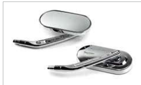
OVAL MIRRORS - DRILLED STEM ✂ 0.2 High gloss chrome mirror kit, featuring laser etched Triumph logo. A9638032