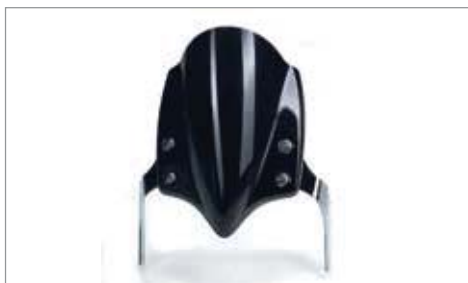
FLY SCREEN - PAINTED ✂ 0.5 Requires front end fixing kit, A9738051. A9748045-##