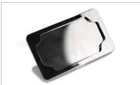
LICENSE PLATE FRAME - CHROME ✂ 0.2 Designed for use with registration plates, 7.25 x 4.25". A9730221