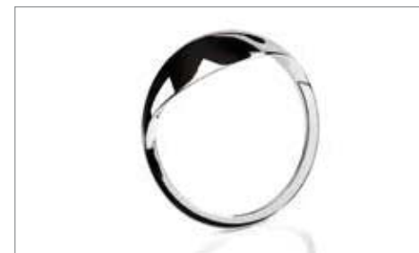
INSTRUMENT VISOR - CHROME ✂ 0.1 Supplied complete with self adhesive 3M fixings. A9730610