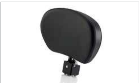
LONGHAUL RIDER BACKREST ✂ 0.2 Spring loaded and folds forward for easy pillion access. Requires Longhaul Dual Seat, T2305357. A9708158