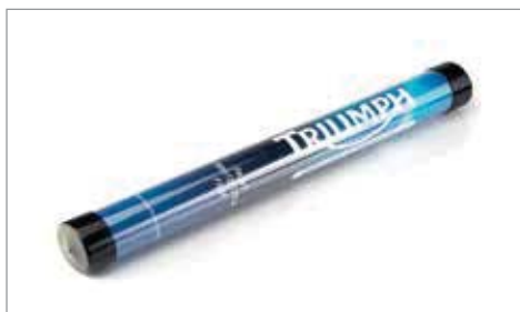
PAINT PROTECTION KIT - MATTE PAINT ✂ 0.1 5 fuel tank panels & installation pack - Industry first matte paint finish. A9930382