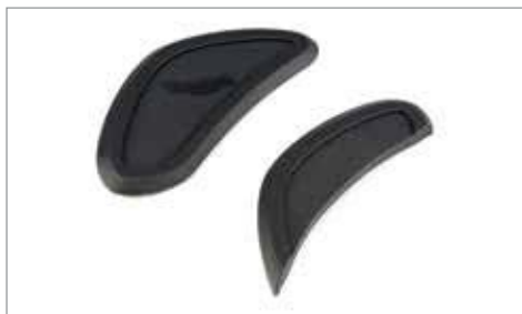
KNEE PADS ✂ 0.2 Protects the sides of the fuel tank from everyday knocks and scratches. Self adhesive. A9718005