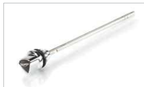
OIL FILLER CAP - LOGO CHROME ✂ 0.0 Chrome plated oil filler/dipstick. Features "Tri-Corner" ergonomic grip with Triumph badge logo. A9610200