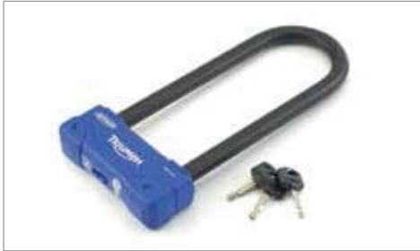
TRIUMPH U LOCK High quality, 270mm D lock. ART****. FFMC, Sold Secure Gold, NK Test & SRA approved. A9810006