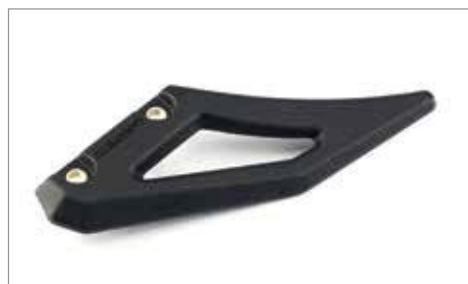
LOWER CHAIN GUARD ✂ 0.2 Moulded lower chain guard manufactured from glass filled nylon for durability. A9648020