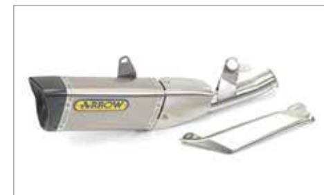
ARROW SLIP-ON SILENCER (E APPROVED) ✂ 1.0 Bespoke performance slip on silencer developed with Arrow Special Parts. Offers 2ps power increase. E approved for noise and emissions. A9600442