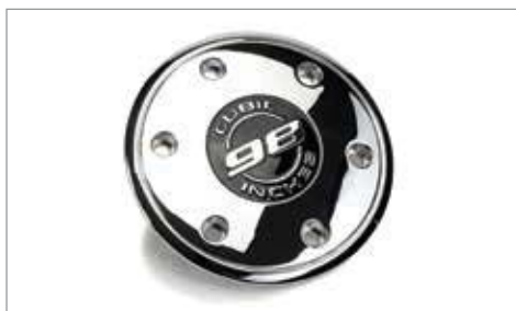
CLUTCH COVER - "98 CUBIC INCHES" ✂ 0.2 High gloss chrome Clutch Cover, features embossed and painted "98 CI" Logo. A9730519