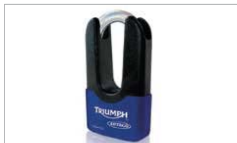
TRIUMPH DISC LOCK ✂ 0.0 High quality, forged disc lock and nylon branded carry pouch. Offered with SRA and Sold Secure approvals. A9810000