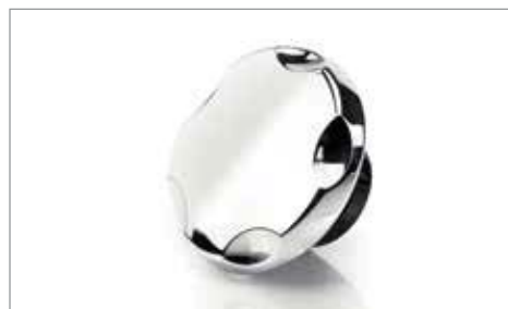
FUEL CAP - BILLET STYLE ✂ 0.0 High gloss chrome Fuel Filler Cap, billet style detailing. A9730176