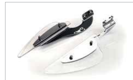
LOWER AIR DEFLECTOR KIT ✂ 0.2 Requires A9750510 Mounting kit. For use with Quick Release screens A9700316, A9741024 & A9700318. A9741047