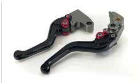
MACHINED ALLOY SHORT LEVERS - RADIAL ✂ 0.2 Suitable for "R" models only. A9620029