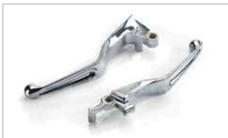
CHROME LEVERS ✂ 0.2 Ideal for use with Chrome Switch Housing Kit, A9738156. A9738167