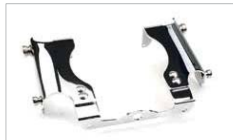
QUICK RELEASE SCREEN MOUNTING KIT ✂ 0.6 For use with Quick Release Screen kits A9700316, A9741024 & A9700318. (Does not fit Storm). A9750510