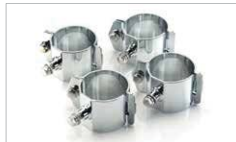
FRONT END FIXING KIT ✂ 0.3 Required to install Rocket Screens/Fog Light Kits. A9738051