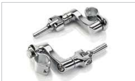
ADJUSTABLE HIGHWAY PEG MOUNTS ✂ 0.3 Can only be used in conjunction with Triumph Highway Pegs, A9750459 (Logo) & A9750523 (Chromeline). A9750455