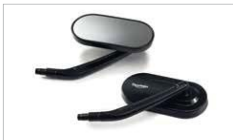
OVAL MIRRORS - BLACK ✂ 0.2 Satin Black finish. Fits all Triumph Cruisers. A9638084