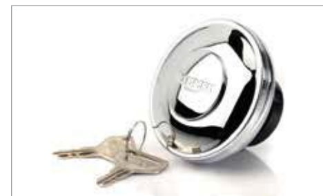
FUEL CAP - LOCKABLE ✂ 0.0 Features Triumph branded bezel and knurled edge. Supplied with two keys. A9930170