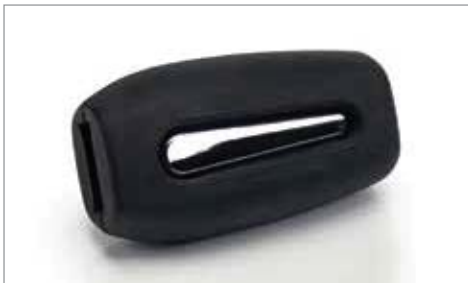
"CHROME LINE" BRAKE PEDAL FINISHER - SMALL ✂ 0.1 For use with standard equipment brake pedal. A9718018