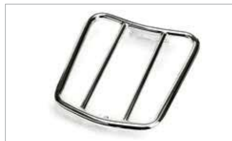
CHROME SINGLE SEAT RACK - TUBULAR ✂ 0.2 This product can only be installed when the pillion seat is removed. Carrying Capacity 3kg. A9730308