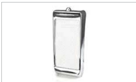
RADIATOR COVER - CHROME ✂ 0.2 High gloss chrome ABS Radiator Cover, pre-installed with protective mesh insert. A9708176