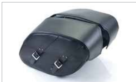
LEATHER PANNIERS ✂ 0.3 Requires Pannier Mounting Kit, A9528030. Capacity 22 litres per bag. T2350853