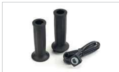
HEATED GRIP KIT ✂ 1.3 Bespoke heated grips featuring dual temperature controls with illuminated switching Internally wired through handlebars for a neat installation Supplied complete with all mounting hardware and wiring. A9638122