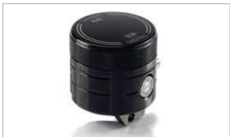
CNC MACHINED FRONT BRAKE RESERVOIR ✂ 0.5 Features sight glass and knurled lid. Laser etched with Triumph Logo. T2025066