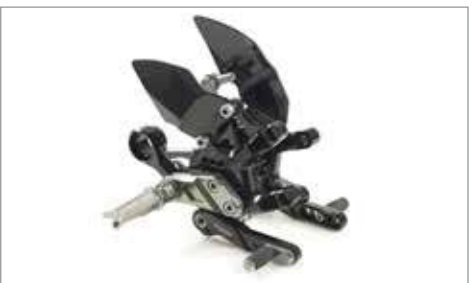
CNC MACHINED ADJUSTABLE REARSETS ✂ 0.7 Fully machined rearsets offering 20mm of lateral and vertical adjustment. Finished in anodised grey and black with carbon fibre heel guards. A9770046