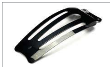
BLACK CHROME SINGLE SEAT RACK - PRESSED ✂ 0.2 High gloss black finish solo rack. A9758100