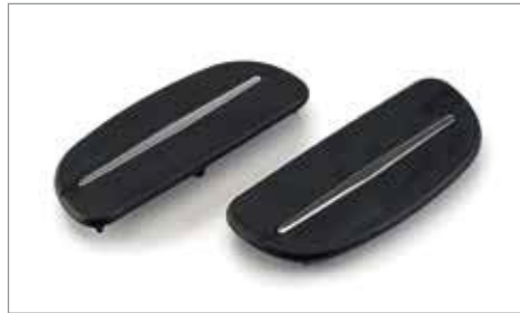
"CHROME LINE" PILLION BOARD MATS ✂ 0.1 Chromeline Upgrade for Classic Pillion Footboard Kit, A9758159. A9718016