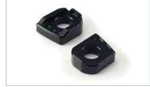
CNC MACHINED CHAIN ADJUSTERS - BLACK ANODISED ✂ 0.3 Machined and anodised replacement for OE part offered for fitment to Street Triple or Daytona 675 models. A9640045