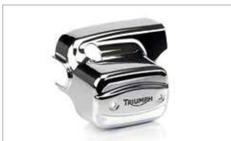
MASTER CYLINDER COVER - CHROME ✂ 0.2 Can be installed in isolation or combined with Chrome Switch cube housing kits. A9738069