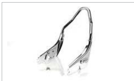
QUICK RELEASE SISSY BAR KIT ✂ 0.5 Features an integral lock and key security system. Can only be installed with pillion backrest pad. A9750516