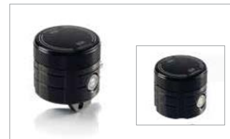
CNC MACHINED FRONT BRAKE RESERVOIR ✂ 0.5 Features sight glass and knurled lid. Laser etched with Triumph Logo. T2025066 (675) / A9628022 (675R)