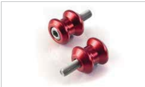
CNC MACHINED ALUMINIUM Paddock STAND BOBBINS - RED ANODISED ✂ 0.1 Machined M8 paddock stand bobbins for use with hook type paddock stands. Red anodised. A9640049