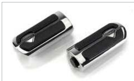
HIGHWAY PEGS - LOGO BADGE ✂ 0.2 Features rubber foot grip and Triumph logo. For use with either A9750455 or A9750463 Mounting Kits. Requires Engine Dresser Bars A9738118. A9750459