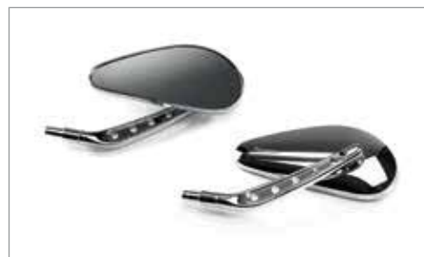
TEARDROP MIRRORS - DRILLED STEM ✂ 0.2 High gloss chrome mirror kit, featuring laser etched Triumph logo. A9638034