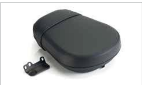
LONGHAUL PILLION SEAT ✂ 0.1 To be installed with Longhaul Rider Seat, T2301138. Fabric matched with Longhaul Sissy bar backrest pad. A9708261