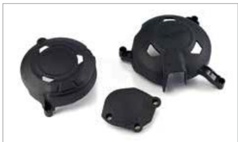
ENGINE COVER PROTECTORS ✂ 0.7 Designed to offer additional protection to exposed engine covers, Triumph Engine Cover Protectors are manufactured from injection moulded long glass nylon for superior strength and abrasion resistance. A9618171