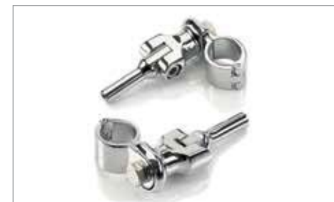
FIXED HIGHWAY PEG MOUNTS ✂ 0.2 Can only be used in conjunction with Triumph Highway Pegs, A9750459 (Logo) & A9750523 (Chromeline). A9750463