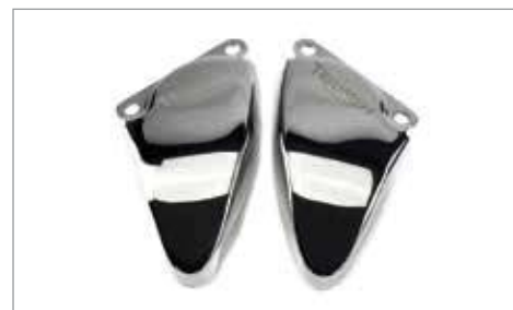
CALIPER COVERS - CHROME ✂ 0.3 Cannot be installed with chrome Caliper Caps, A9730642. A9738194