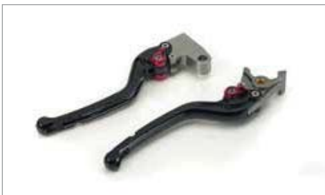
MACHINED ALLOY LONG LEVERS - STANDARD ✂ 0.2 Not suitable for "R" models. A9620037