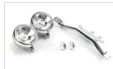
AUXILIARY LAMPS ✂ 1.0 Complete with all necessary mounting hardware and wiring. Suitable for US Market, SAE approved. A9938100

* Please refer to the rear cover for further information.