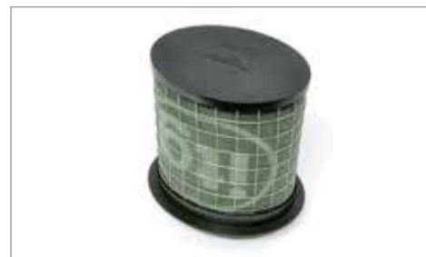
PERFORMANCE AIR FILTER ✂ 0.2 Can be installed in conjunction with 1700cc Big Bore Kit, A9618043 and Triumph High Flow Silencer kits. A9610045