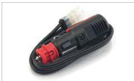
OPTIMATE ADAPTOR ✂ 0.0 Facilitates use of a Battery Optimiser when used in conjunction with an auxiliary power socket. A9930011