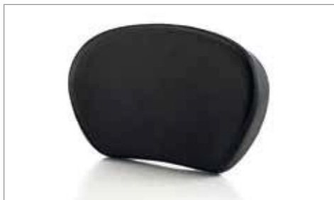
LONGHAUL BACKREST PAD - PILLION ✂ 0.2 To be used with the Quick Release Sissy Bar kit. Fabric matched with A9708261. A9708239