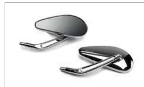
TEARDROP MIRRORS - SOLID STEM ✂ 0.2 High gloss chrome mirror kit, featuring laser etched Triumph logo. A9638033