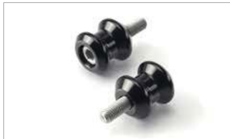
CNC MACHINED ALUMINIUM Paddock STAND BOBBINS - BLACK ANODISED ✂ 0.1 Machined M8 paddock stand bobbins for use with hook type paddock stands. Black anodised. A9640048