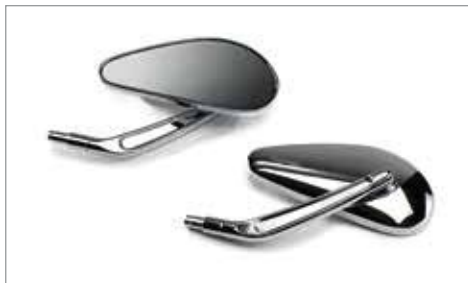
TEARDROP MIRRORS - SOLID STEM ✂ 0.2 High gloss chrome mirror kit, featuring laser etched Triumph logo. A9638033