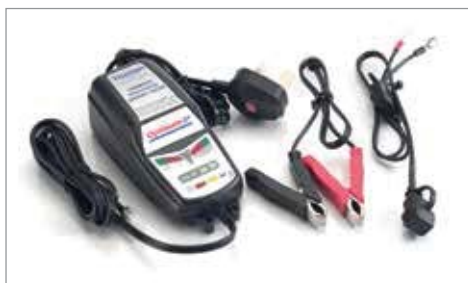
TRIUMPH BATTERY OPTIMISER ✂ 0.2 Fully Automatic Battery Charger for lead acid batteries. A9930218 (UK) A9930219 (EU)