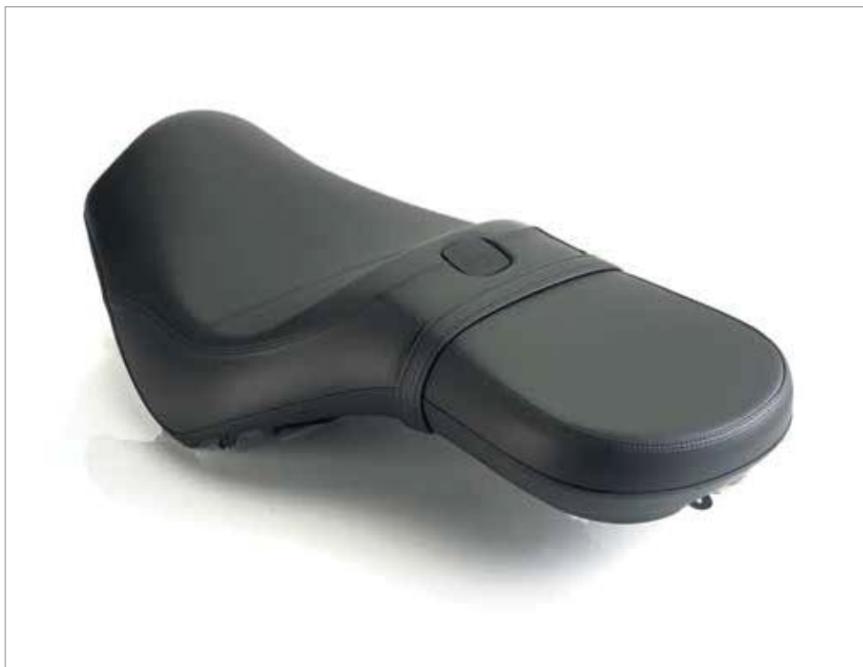
LONGHAUL TOURING SEAT - DUAL ✂ 0.2 Fabric matched with A9708261, Longhaul Sissy bar pad, can be installed with Rider Backrest OBA. T2305357