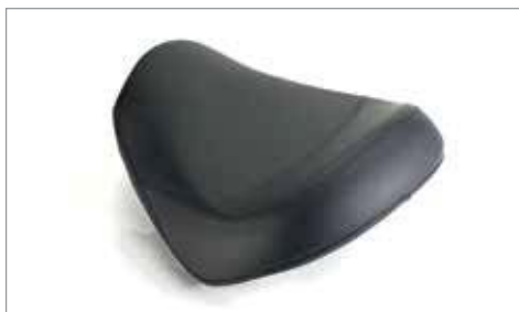
LONGHAUL RIDER SEAT ✂ 0.2 To be installed with Longhaul Pillion Seat, A9708261. Fabric matched with Longhaul Sissy bar backrest pad. T2301138