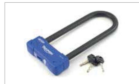
TRIUMPH U LOCK ✂ 0.0 High quality, 270mm D lock. A9810006