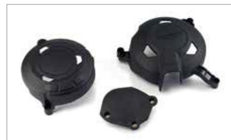
ENGINE COVER PROTECTORS ✂ 0.7 Designed to offer additional protection to exposed engine covers. Manufactured from injection moulded long glass nylon for superior strength and abrasion resistance. A9618132