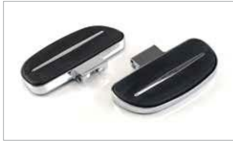
"CHROMELINE" PILLION FOOTBOARDS ✂ 0.2 To be installed in conjunction with Adjustable Pillion Footboards hardware kit, A9758125. A9758160