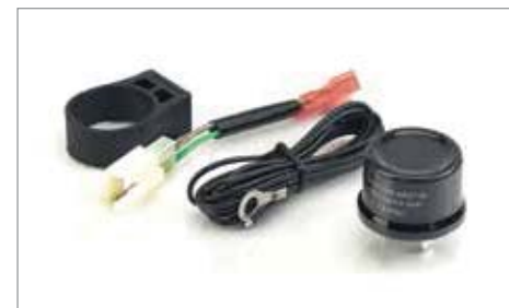
LED INDICATOR RELAY ✂ 0.4 Relay Kit required for fitment of LED Indicator Kit. One relay required per bike. A9830046