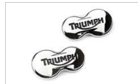
FRONT CALIPER CAPS - CHROME ✂ 0.2 Cannot be installed with chrome Caliper Covers, A9738194. Supplied complete with 3m adhesive fixings. A9730642