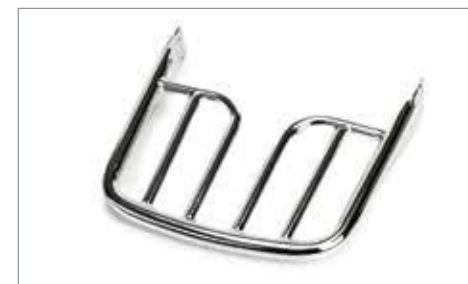
CHROME LUGGAGE RACK ✂ 0.2 Can only be installed with quick release Sissy Bar A9750516. Carrying capacity 5kg. A9750570