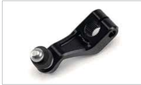
GEAR ACTUATOR BLACK ✂ 0.2 Machined and anodised replacement for OE part offered for fitment to Street Triple or Daytona 675 models. A9610124