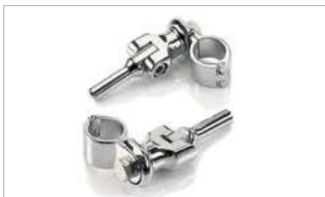
FIXED HIGHWAY PEG MOUNTS ✂ 0.2 Can only be used in conjunction with A9750459 (Logo) & A9750523 (Chromeline). A9750463