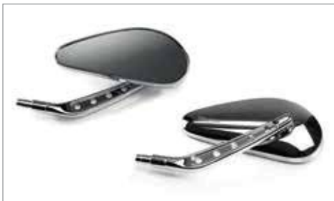
TEARDROP MIRRORS - DRILLED STEM ✂ 0.2 High gloss chrome mirror kit, featuring laser etched Triumph logo. A9638034