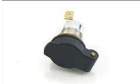
AUXILIARY POWER SOCKET ✂ 0.1 Auxiliary Power Socket for use with Optimate Adaptor, A9930011. A9938039