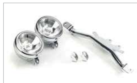
FOG LAMPS ✂ 1.0 Complete with all necessary mounting hardware and wiring. Suitable for EU Market. E approved. A9938099