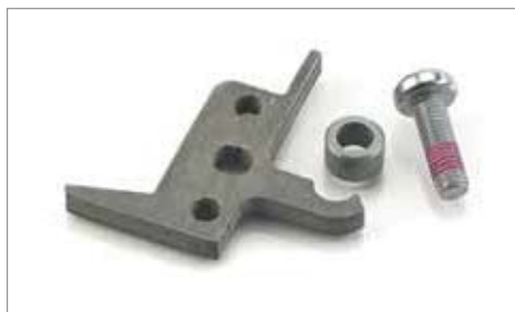
RESTRICTOR KITS 25KW, Street Triple/Street Triple R 35KW, Street Triple 70KW 75KW, Street Triple/Street Triple R A9618155 A9618156 A9618157