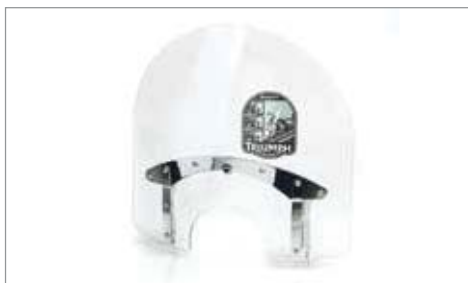
QUICK RELEASE MIDSIZE SCREEN ✂ 0.1 Approximately 42cm high. (measured from headlamp cut out.) Requires A9750510 Mounting kit. (Does not fit Storm). A9700318