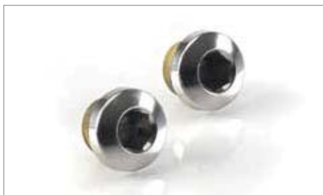
OIL GALLERY PLUGS - POLISHED ✂ 0.5 Highly polished stainless steel oil gallery plugs (pair). A9738133