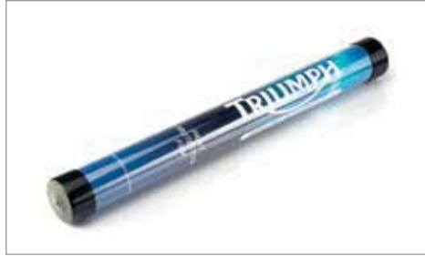
PAINT PROTECTION KIT ✂ 1.0 Super strong clear film protects high contact area's from wear. Manufactured by class leaders 3M. A9930332