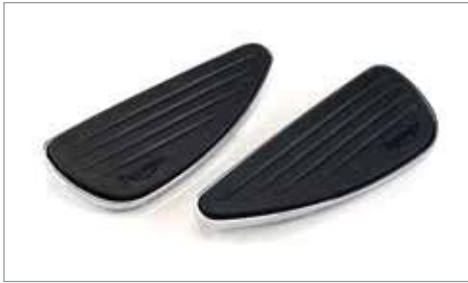
"CLASSIC" RIDER FOOTBOARDS ✂ 0.2 To be installed in conjunction with rider footboards hardware & controls kit, A9758124. A9758157