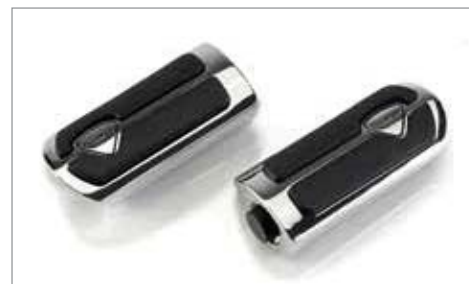
HIGHWAY PEGS - LOGO BADGE ✂ 0.2 Features rubber foot grip and Triumph logo. For use with either A9750455 or A9750463 Mounting Kits. A9750459