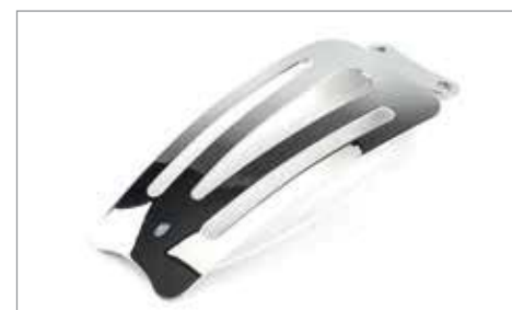
CHROME SINGLE SEAT RACK - PRESSED ✂ 0.2 This product replaces the pillion seat. A9758102