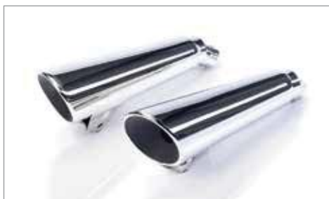
HIGH FLOW SILENCER KIT - SHORT* ✂ 0.7 Off-road use only. Can be installed with Performance Air Filter and Big Bore Kit. Requires engine tune download. A9618050