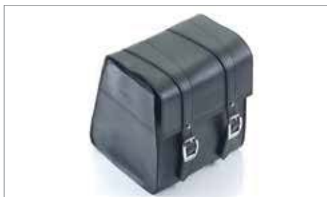
LEATHER SISSY BAR BAG - LARGE ✂ 0.1 Requires Sissy Bar A9750516 and Luggage Rack A9750517. Capacity 8 litres. A9520080