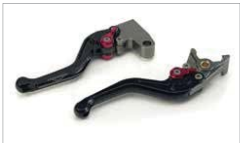
MACHINED ALLOY SHORT LEVERS STANDARD ✂ 0.2 Not suitable for "R" models. A9620038