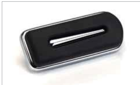
"CHROME LINE" BRAKE PEDAL FINISHER - LARGE ✂ 0.2 For use with standard equipment brake pedal. A9758148