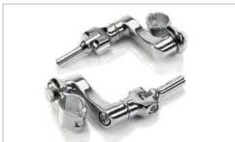
ADJUSTABLE HIGHWAY PEG MOUNTS ✂ 0.3 Can only be used in conjunction with A9750459 (Logo) & A9750523 (Chromeline). A9750455