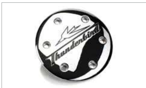
CLUTCH COVER - "THUNDERBIRD" ✂ 0.2 High gloss chrome Clutch Cover, features embossed and painted Thunderbird Logo. A9730517