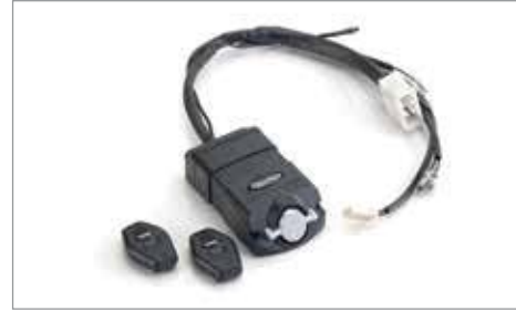
ALARM IMMOBILISER ✂ 1.0 Alarm immobiliser system developed in conjunction with Datatool. Cat 1 Thatcham approved. A9808081