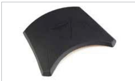
TANK PAD ✂ 0.1 Self adhesive rubber Tank Pad with embossed Triumph logo. A9718006