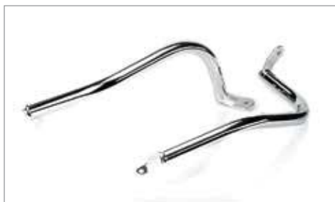
ENGINE DRESSER BAR KIT ✂ 0.5 Can be installed with Highway Peg Mount kit, A9750455 (Adjustable) or A9750463 (Fixed Position). A9738118