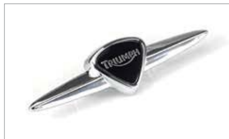
EMBELLISHER - CHROME ✂ 0.1 Self adhesive. A9938097