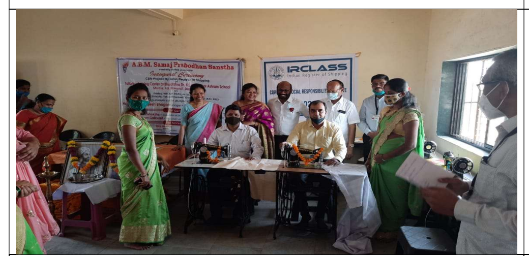
Free Tailoring Unit at Bharatratna Dr.Babasaheb Ambedkar Tribal Residenatils School Shirole especially for Girls and Womens of Near by Villages.1st oct 2021.