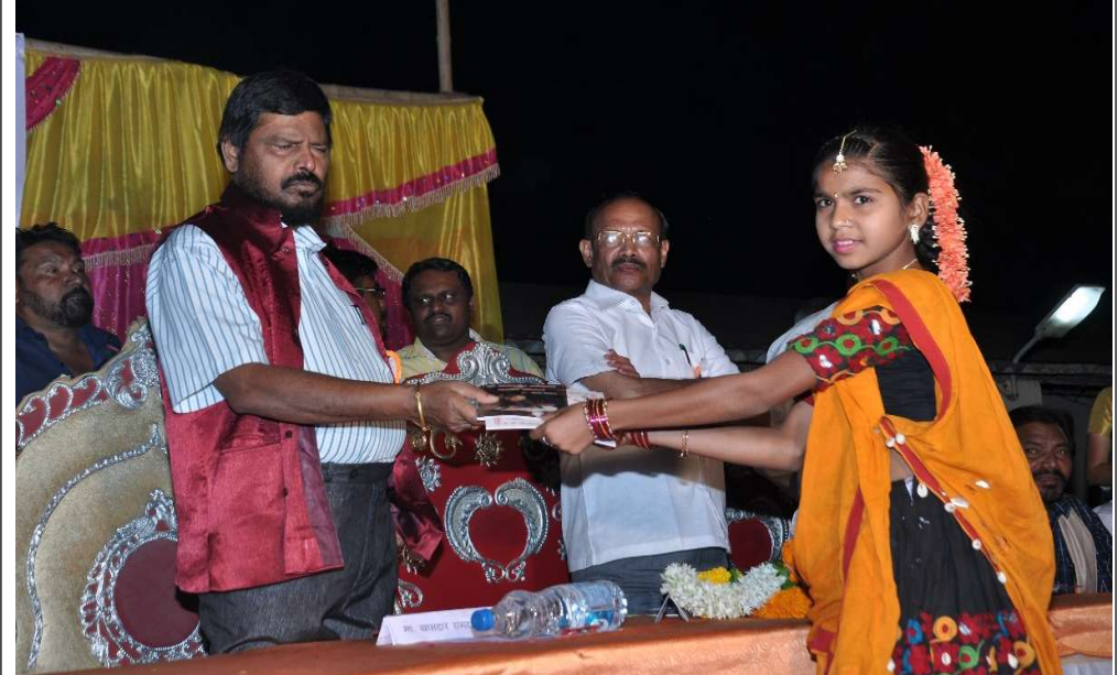
Ramdas Athawale appreciating our tribal students.