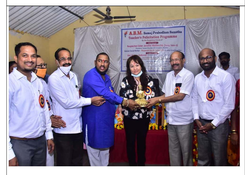
President, Taiwan Chamber of Commerce Mumbai, Visited the Institutions and appreciated the work carried out by the organisation.9<sup>th</sup> sept 2021