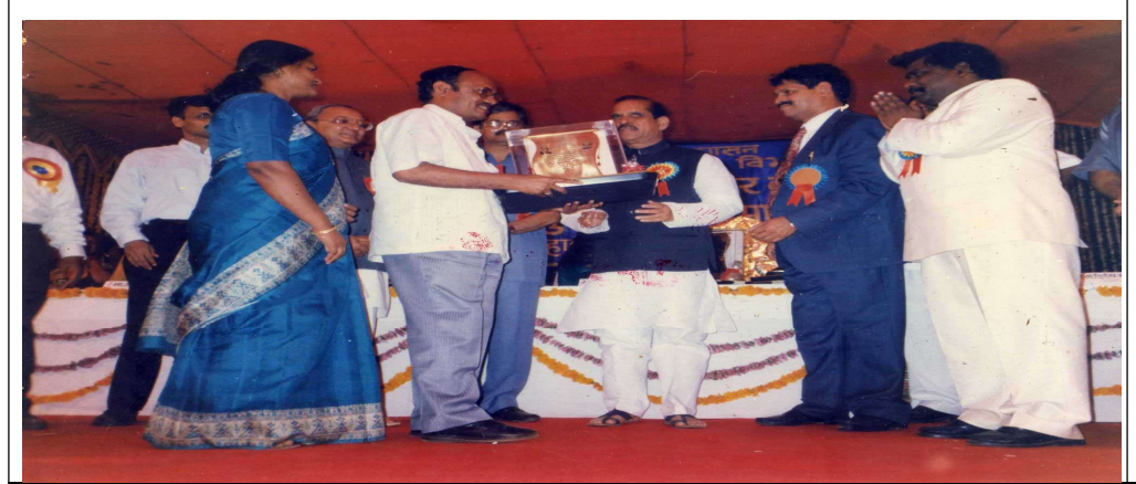
Considering an invaluable services render by this organization government of Maharashtra conferred upon Bharatratna Dr. Babasaheb Ambedkar Dalit Mitra Award by the auspicious hands of Hon'ble Chief Minister of Maharashtra.