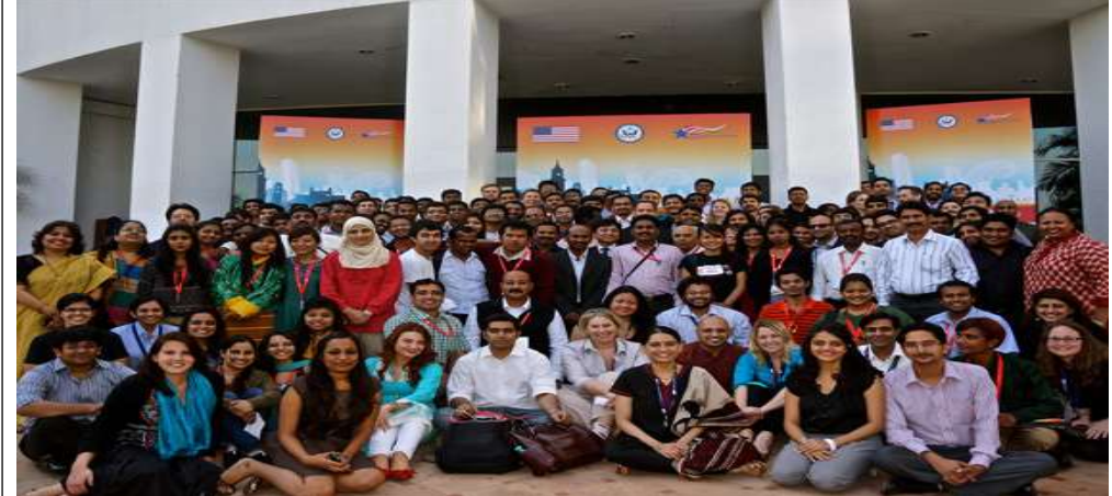
An organization started its first activity reached to the greatest height within 36 years by their commendable work which was recognize by Consulate General United State of America and invited the organization in Tech Camp which was called throughout South East Asia Continent only 57 NGO's we were among them. In the year 2013.