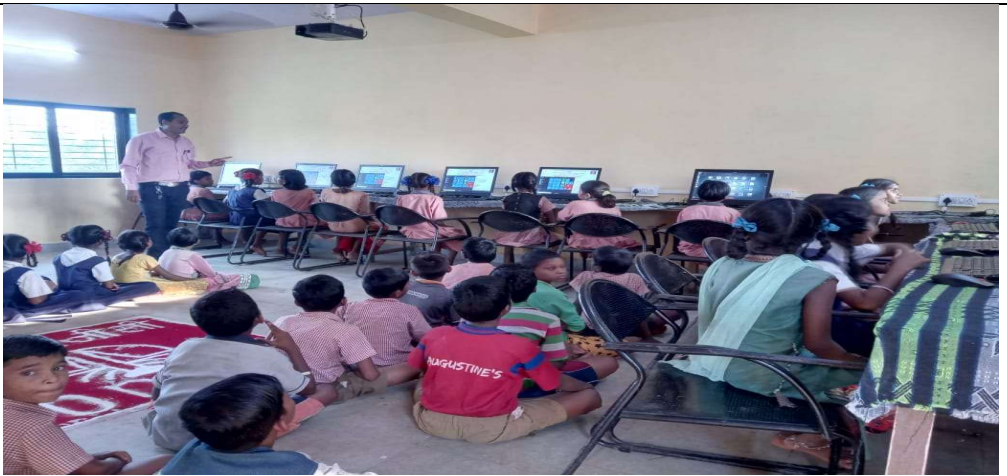
Free Computer Training Centre for SC / ST. at Bharatratna Dr.Babasaheb Ambedkar Tribal Residenatils School Shirole. Inaugrated on 4^{\rm th} oct 2018.