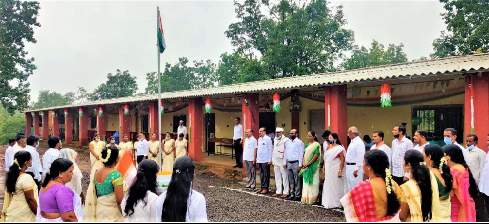
New Patra Shed Building of Primitive Tribe Boys and Girls Residentail School which got Government sanction(Grant -in- Aid) in the year sept 2019 ,A new building (ground +2)is under construction which will be completed in 2022.

Among tribal there are certain sub-communities which has been notified as most vulnerable tribe whose literacy rate is below 4% and almost all families are living below poverty line To bring them in the mainstream of society A girls Residential School open in the year 1999. It is proud to know that Hon'ble Prime Minister's office informed the State government for necessary action by which the government of Maharashtra sanctioned this only School under grant in aid school throughout Maharashtra.