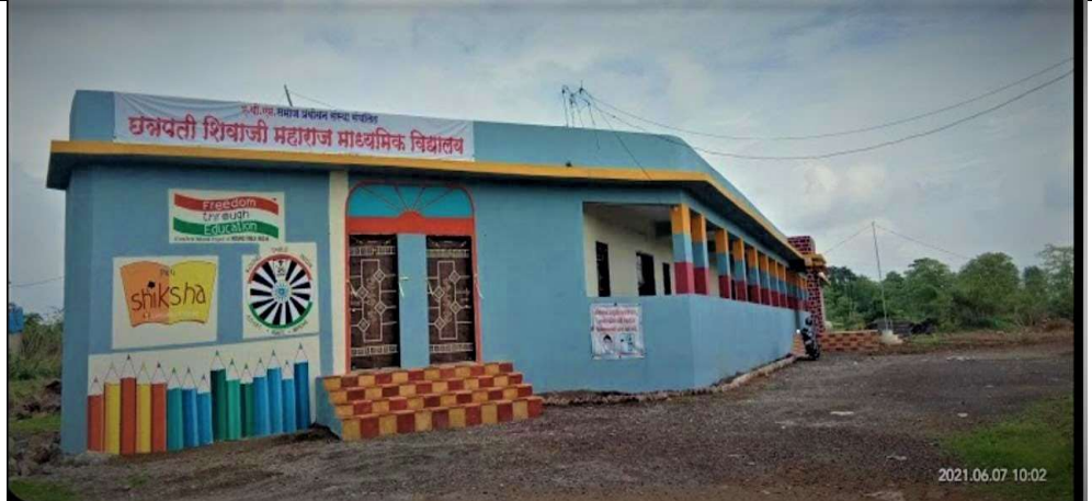
Chhatrapati Shivaji Maharaj Vidyalaya Dhamangoan which was started in Hanuman Temple now has full fledged New Building of around 6000sqft.In the year 20<sup>TH</sup> May 2021.

We found that resident of near Bhiwandi City were not allowing their girls child for secondary education. Since Bhiwandi is notorious for communal riots. We therefore open a secondary School in one of the Hanuman temple at Dhamangaon village. Majority of girls students are now learning after Junior College, 15 engineers and 5 doctors are outcome of this initiative especially for other backward class.