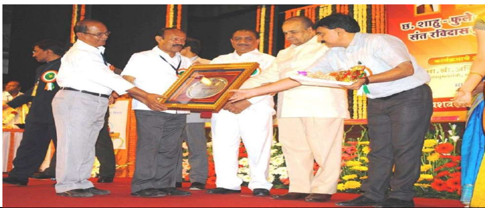
A second most prestigious award conferred upon by the auspicious hands of Governor of Maharashtra namely Shahu Phule Ambedkar after 14 years.