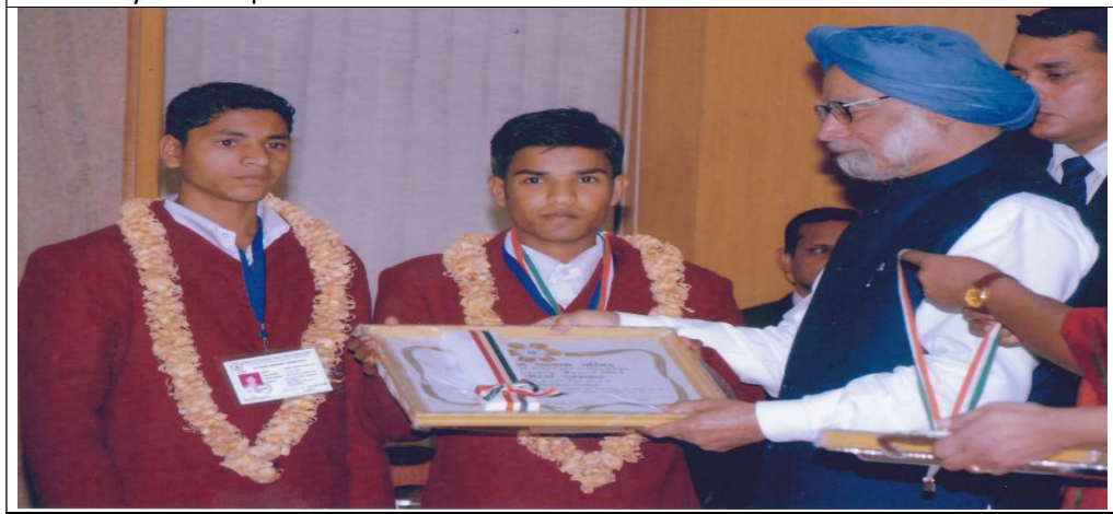
Two students of our tribal Residential School have been conferred upon National Bravery Award by the auspicious hands of Hon'ble Prime Minister of India, who fight with tiger in the forest.