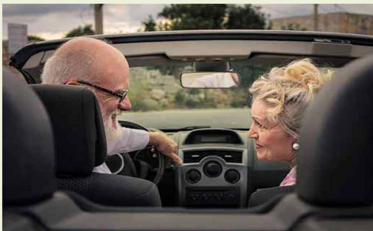
Freedom of Mobility

To realise a society where everyone can move around safely, smoothly and freely through Automated Driving Technology. "Safety" is a key priority.