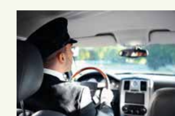
"Chauffeur Mode" Car drives for you