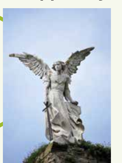
"Guardian Mode" Car supports you