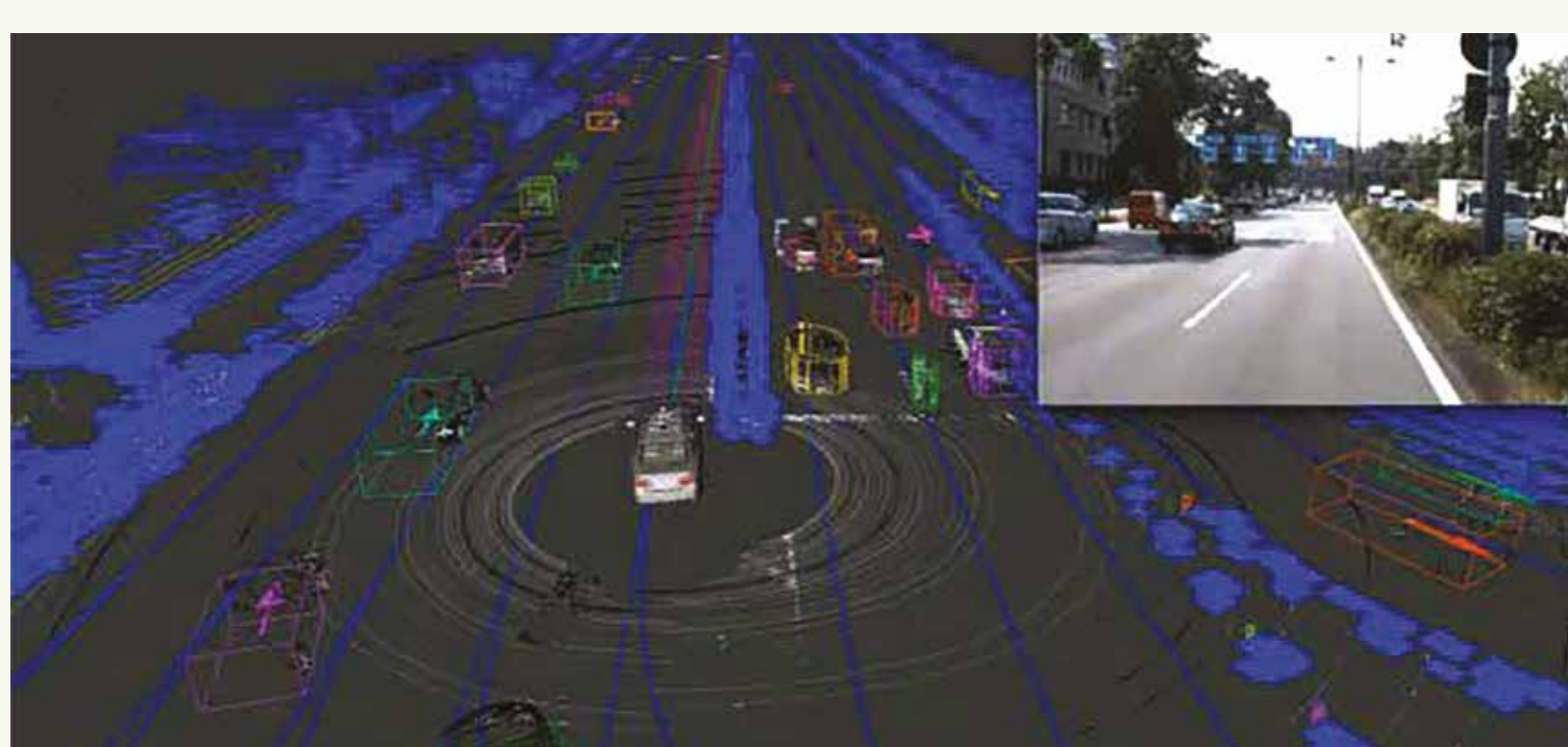
Compilation of sensor data, map data and camera

Comprehensive traffic recognition with highly accurate sensor system. Artificial Intelligence (AI) finds and follows a safe path forward.