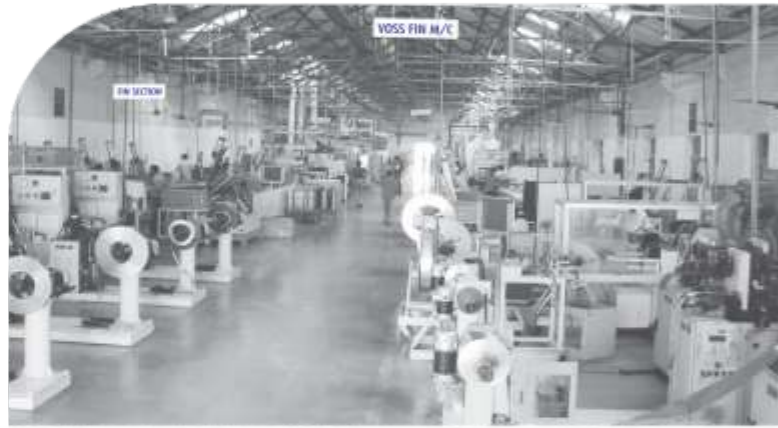
Fin manufacturing line

Continuous & Batch Nocolok brazing furnaces, brazed core pickup & inspection area