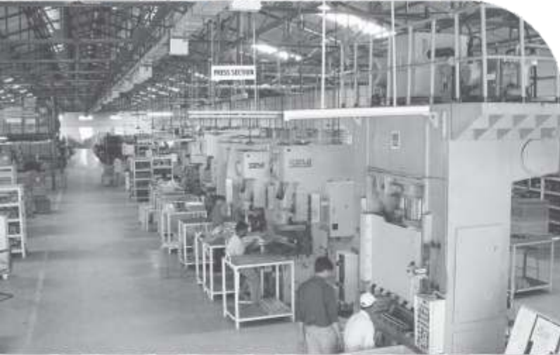
Component Press Shop

Continuous training on identified needs affecting process control and product quality is key factory management objective .