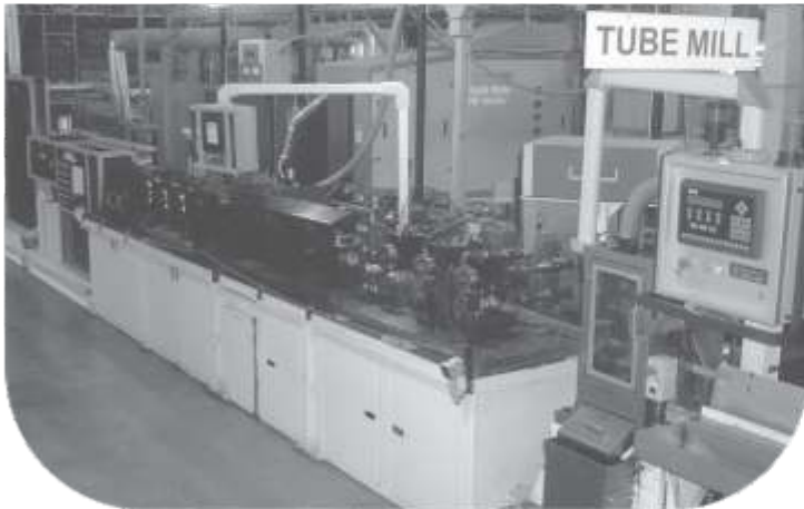
Welded Tube Mill