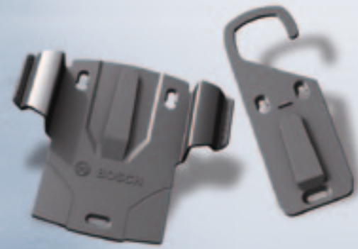
Accessories for C3 and C7: Wall mount or mobile hook