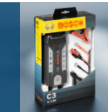
C3: All at a glance