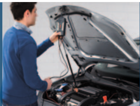
C3: With practical mobile hook