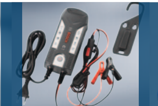
C3: Charging and mains cable, mobile hook