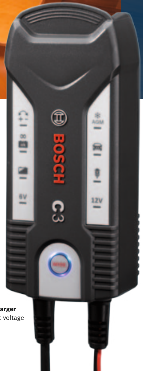
Battery charger C3: Output voltage 6V/12V

The C3 from Bosch can be used to charge weak passenger car batteries automatically and quickly. The C7 is also a good choice for those who want to keep the battery of their moped or scooter fit in the cold season with a trickle charge. The handy, compact battery charger is easy to operate with the central adjusting button and it can be hung conveniently with the supplied mobile hook, for example on the hood.