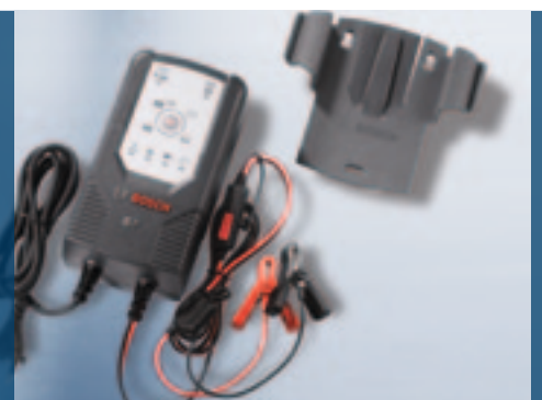
C7: With practical mobile hook