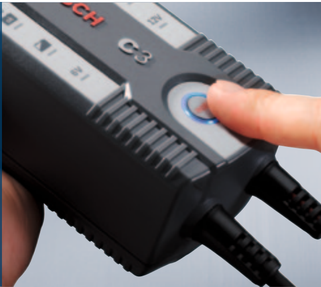
One button, many functions! Charging with intelligent monitoring