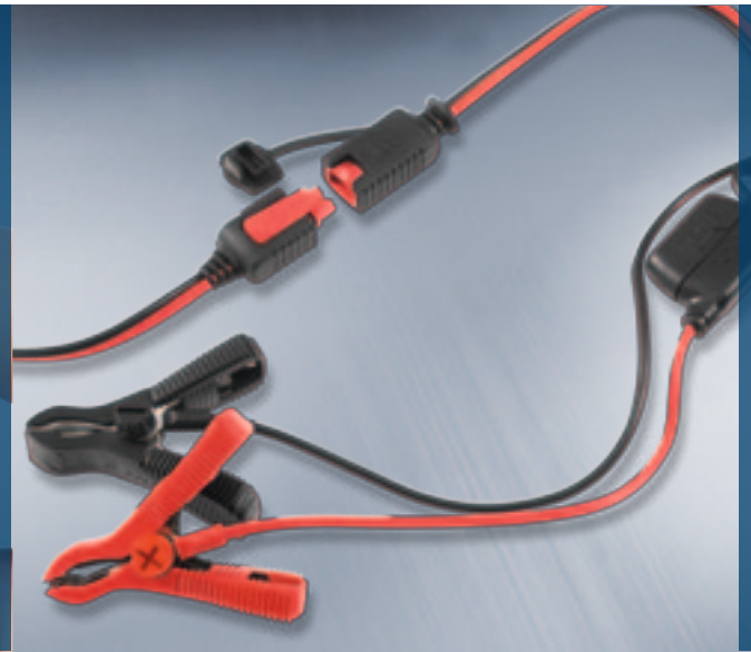
New! Battery charging cable with plug-in connection