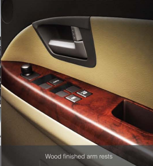
Wood finished arm rests