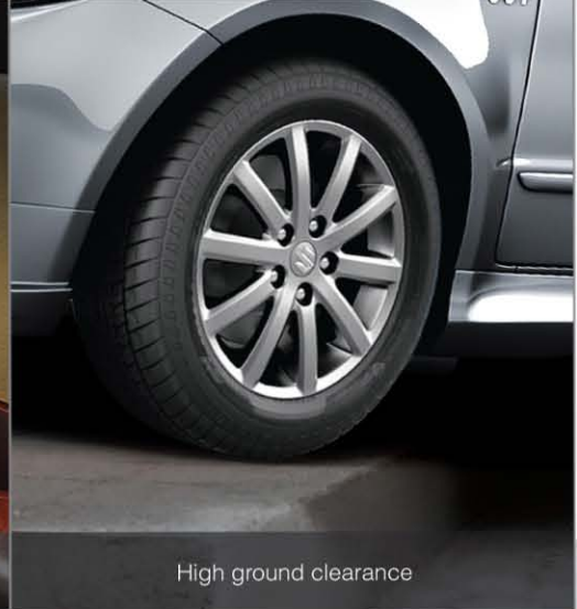
High ground clearance