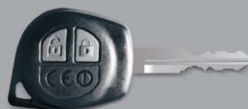
Remote embedded key for higher security.