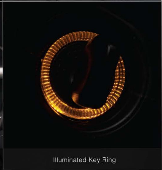
Illuminated Key Ring