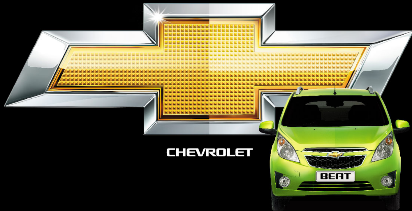
10-GMM-259 - BEAT Leaflet (front) - Size: W 27.8cm x 19.3 cm H - Date: 31-01-2011