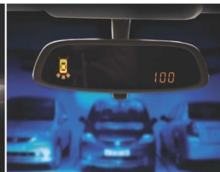
intellipark reverse assist system