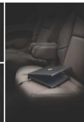
Mobile & Laptop charging point