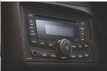
2 DIN audio system