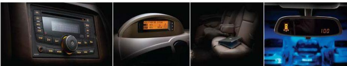
2 DIN audio system