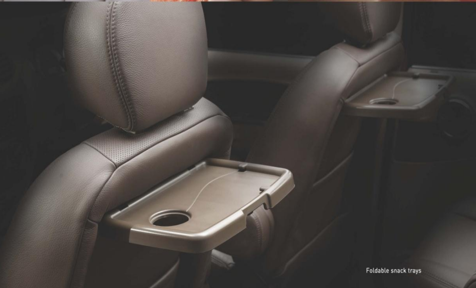
Foldable snack trays