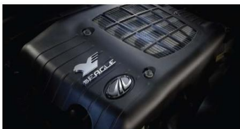
mEagle CRDe engine

Shooting at remote locations means that I have to zip quickly between destinations across the country. And the mEagle CRDe engine never lets me down. I relish every bit of the 112 BHP it dishes out as I cover highways and ghats with equal grace, even on a full load.