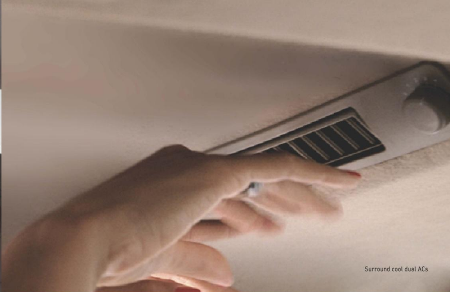
Surround cool dual ACs