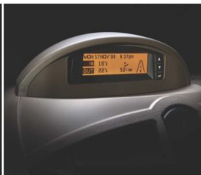
Digital drive assist system