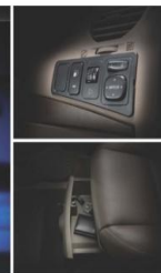
Underseat storage space