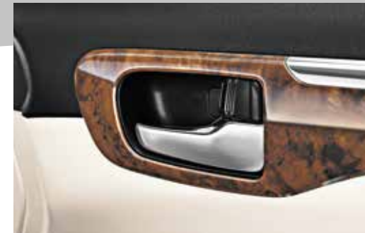
CHROME INNER DOOR HANDLES