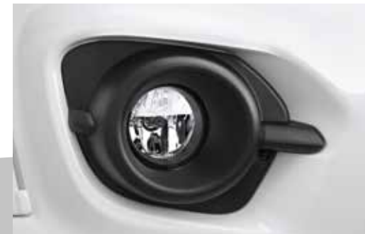
FRONT FOG LAMPS