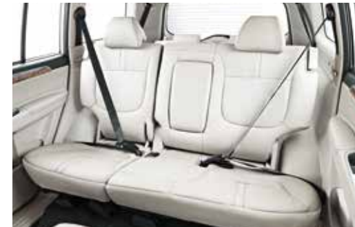
2 ND ROW SEAT WITH ARMREST