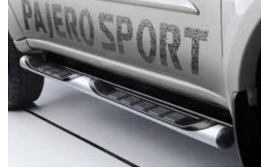
SPORTY SIDE STEPS