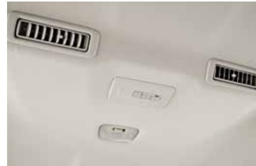
REAR AC VENTS WITH CONTROL