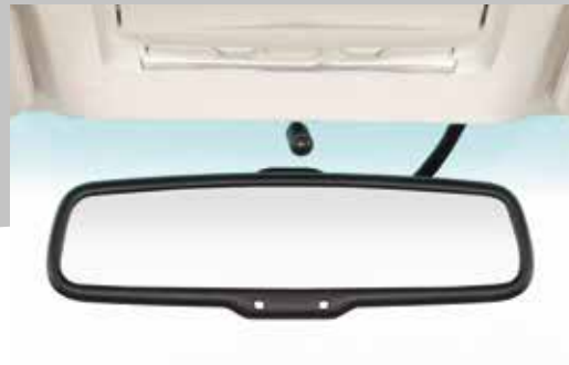
ELECTRIC CHROMIC MIRROR