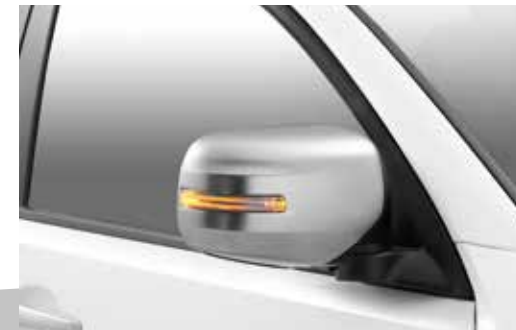
CHROME FINISHED ORVM WITH INDICATORS