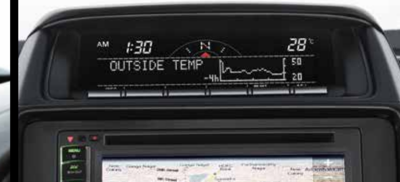
MID - MULTI-INFORMATION DISPLAY