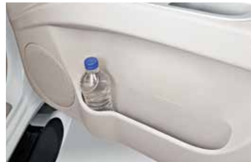
FRONT DOOR POCKETS WITH CUP HOLDER