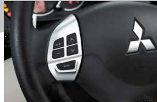
STEERING MOUNTED AUDIO CONTROLS