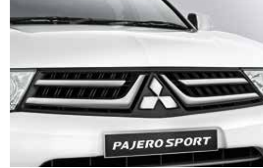
CHROME FRONT GRILLE