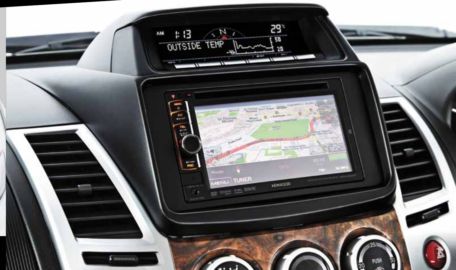
AM/FM RADIO, CD PLAYER, NAVIGATOR WITH CENTRE DISPLAY, TOUCH PANEL AND BLUETOOTH HANDSFREE PHONE INTERFACE

Outstanding low-end / flat torque and full-range performance Max Output : 131kW ( 178 PS) / 4000 r/min | Max Torque : 350 Nm @ 1800 - 3500 r/min