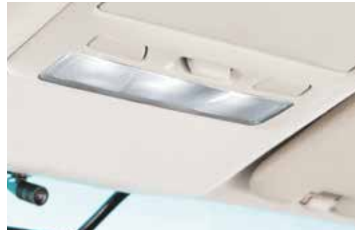
FRONT ROOM LAMPS WITH MAP LAMPS