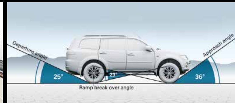
SUPERIOR TERRAIN HANDLING ABILITY