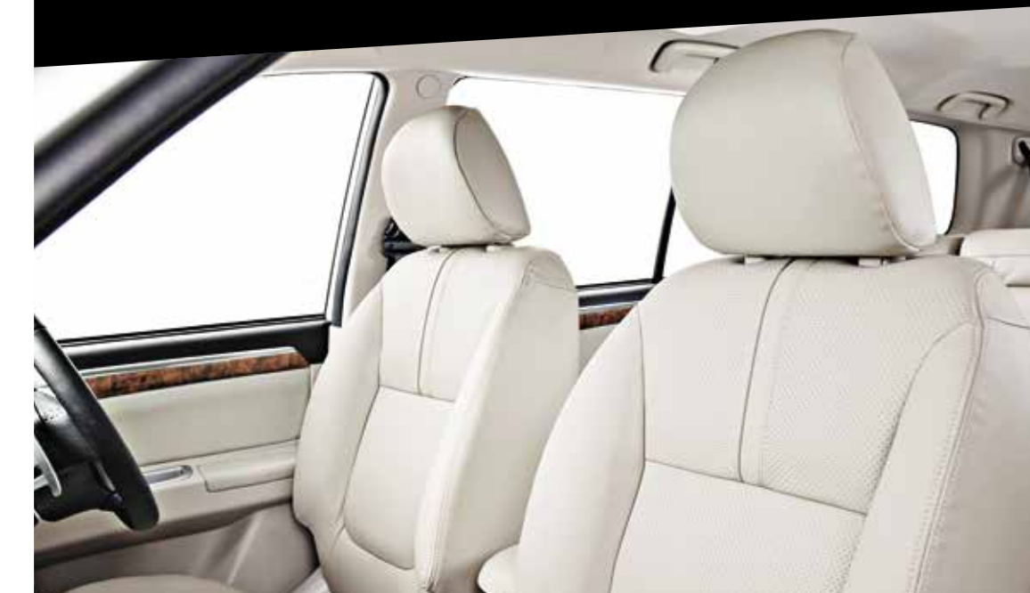
PLUSH LEATHER SEATS