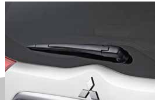
REAR INTERMITTENT WIPER & WASHER