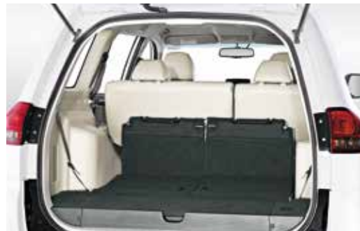
3 RD ROW FOLDABLE SEATS