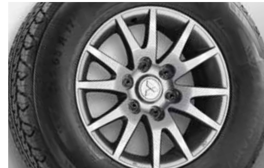
12-SPOKE ALLOY WHEELS