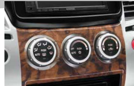
AUTOMATIC CLIMATE CONTROLS