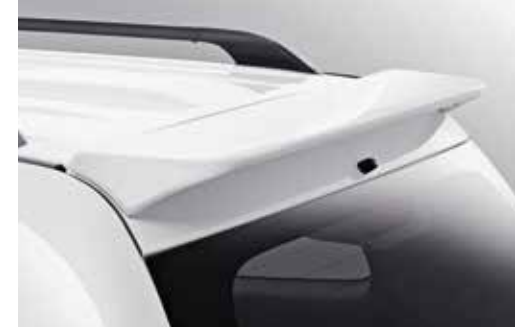
TRENDY REAR SPOILERS