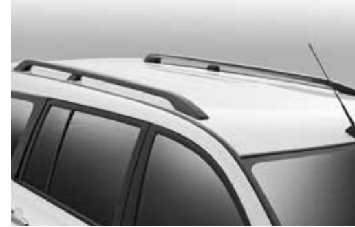
SPORTY ROOF RAILS