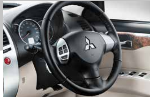
PREMIUM LEATHER WRAPPED STEERING WHEEL