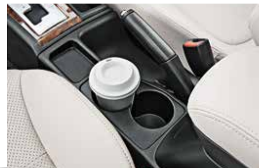
FRONT CUP HOLDERS ON FLOOR CONSOLE