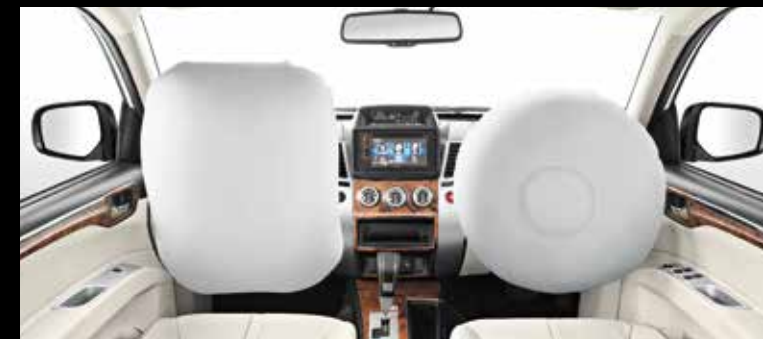
FRONT DUAL AIRBAGS