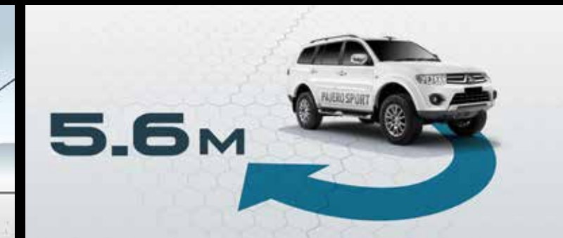
BEST-IN-CLASS MINIMUM TURNING RADIUS