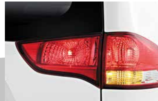
WRAP AROUND REAR TAIL LAMPS