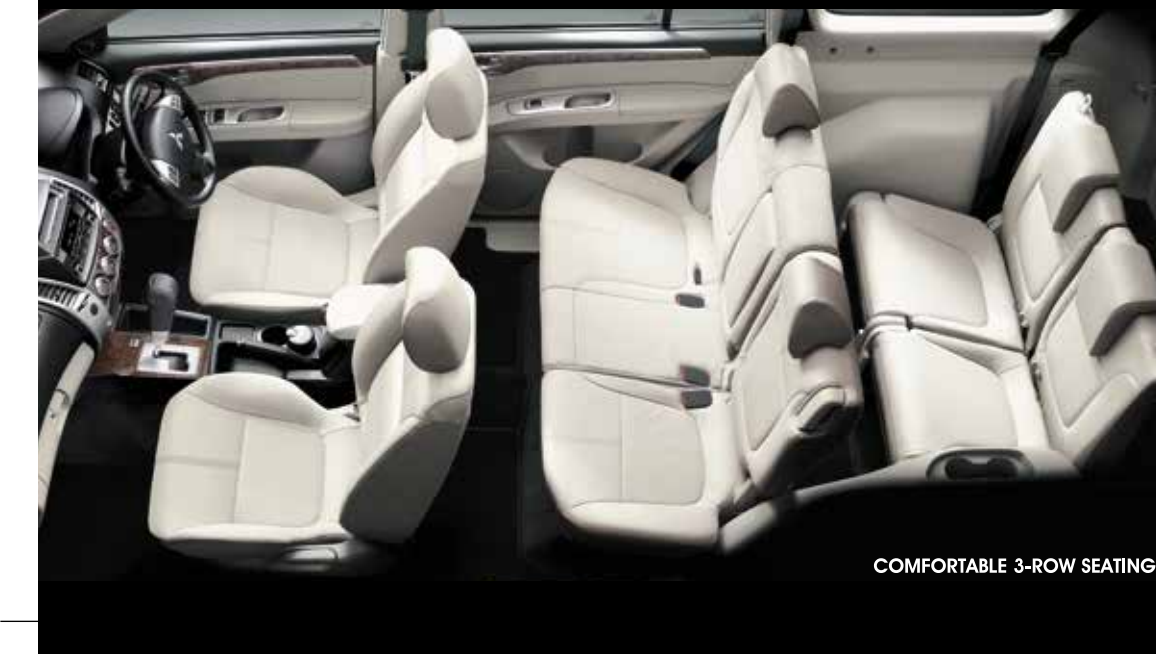
COMFORTABLE 3-ROW SEATING