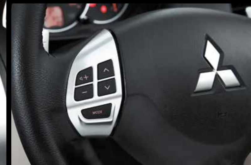
STEERING MOUNT AUDIO CONTROLS