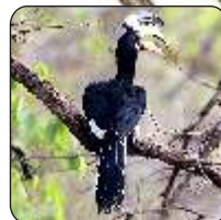
Malabar Pied Hornbill