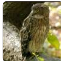
Brown Fish Owl