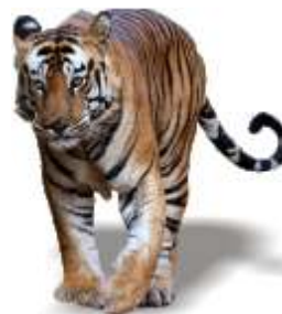
Shashi on a territorial stroll

You only have a chance of seeing them, but they will definitely see you.