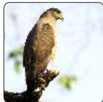
Crested Serpent Eagle