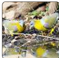
Yellow-footed Green Pigeon