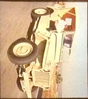
Atenshun: This is one 'jeep' that cannot be climate controlled. Looks like this Ford is ready for some more battle action in India