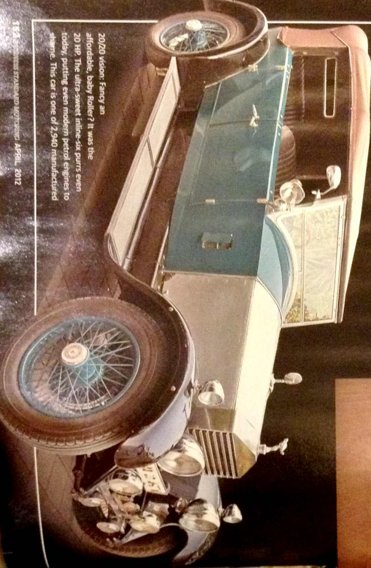
20/20 vision: Fancy an affordable, baby Böhler? It was the 20 HP. The ultra-sweet inline-six purrs even today, putting even modern petrol engines to shame. This car is one of 2,940 manufactured