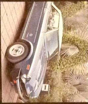
Spider senses: When Fiat exited the US in 1982, this car continued to be sold there until 1985 — as the Pininfarina Azura. The design was retained since the Spider's debut in 1956