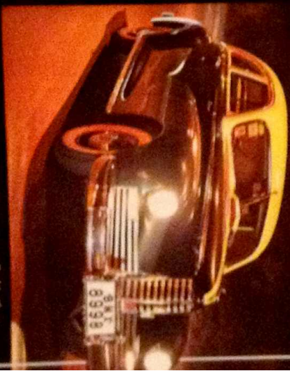
At a fair clip: The Clippert's '68 sedan' shape was refined in those days... and still is! This post-WWII car targeted the mass market without losing Packard's premium appeal