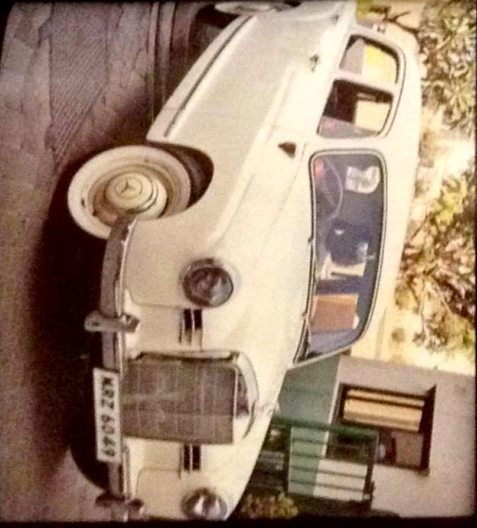
Back from the brink: This poston Merc is in unbelievable concours condition today, right down to the smallest of details like the 'rodos fur' roof lining and Bakelite contacts and points